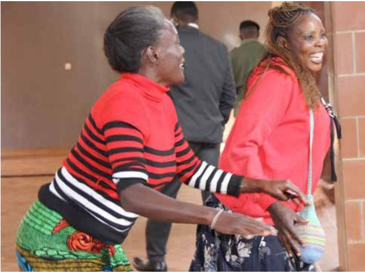
HH supporters outside the magistrate's