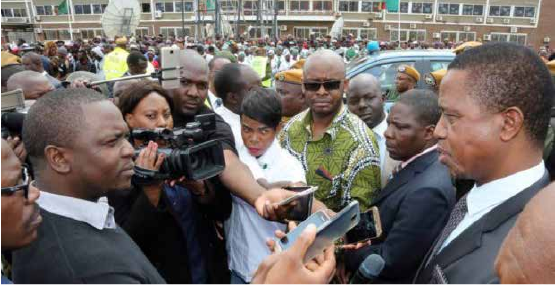
President Edgar Lungu addresses journalists at Kenneth Kaunda International Airport