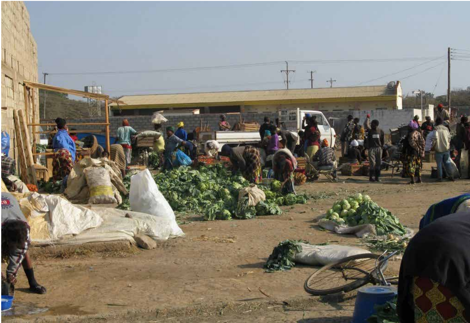
A market in Kabwe

"We have indigenous Zambians who are investing in Kabwe fabrics known as Kifiko. We are encouraging the local people to come and invest, all these cotton farmers, commercial farmers should come on board and invest."