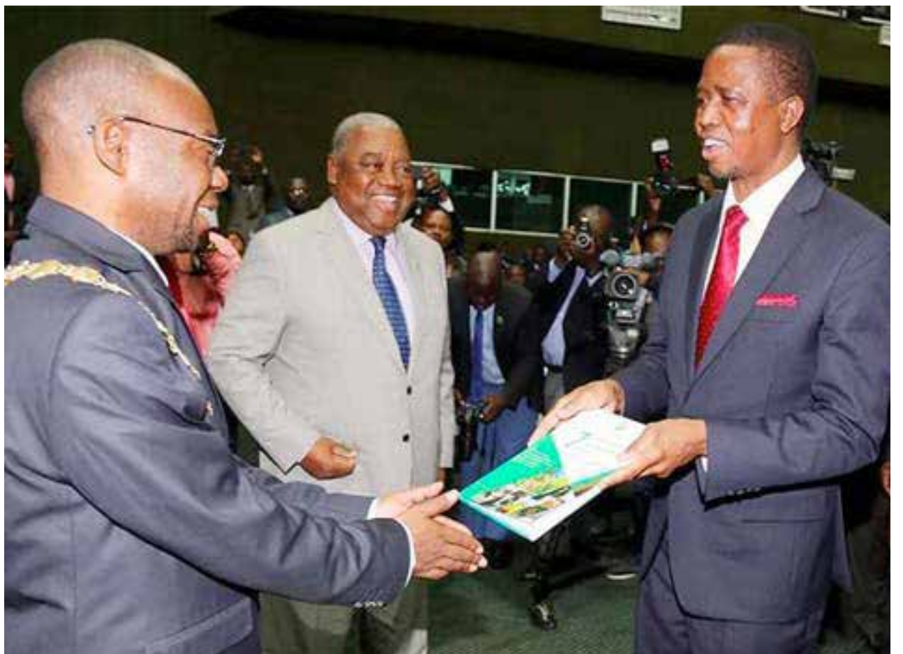
President Lungu at the launch of the 7th National Development Plan

National Development and Planning Lucky Mulusa said the 7NDP would generate more employment opportunities and incomes for the people of Zambia anchored on the formulation of policies that would