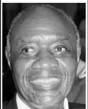
Dr. Vernon J Mwaanga is an accomplished diplomat who served as Ambassador of Zambia to Russia and as Zambia's Permanent Representative to the United Nations. He served twice as Foreign Affairs minister and four times as Information and Broadcasting Minister under various regimes.

Africa Freedom Day is an important day set aside by our founding fathers to mark the day when the Organisation of African Unity (OAU) – now known as the African Union – was founded on 25th May, 1963, in Addis Ababa, Ethiopia, to launch among many other objectives, the