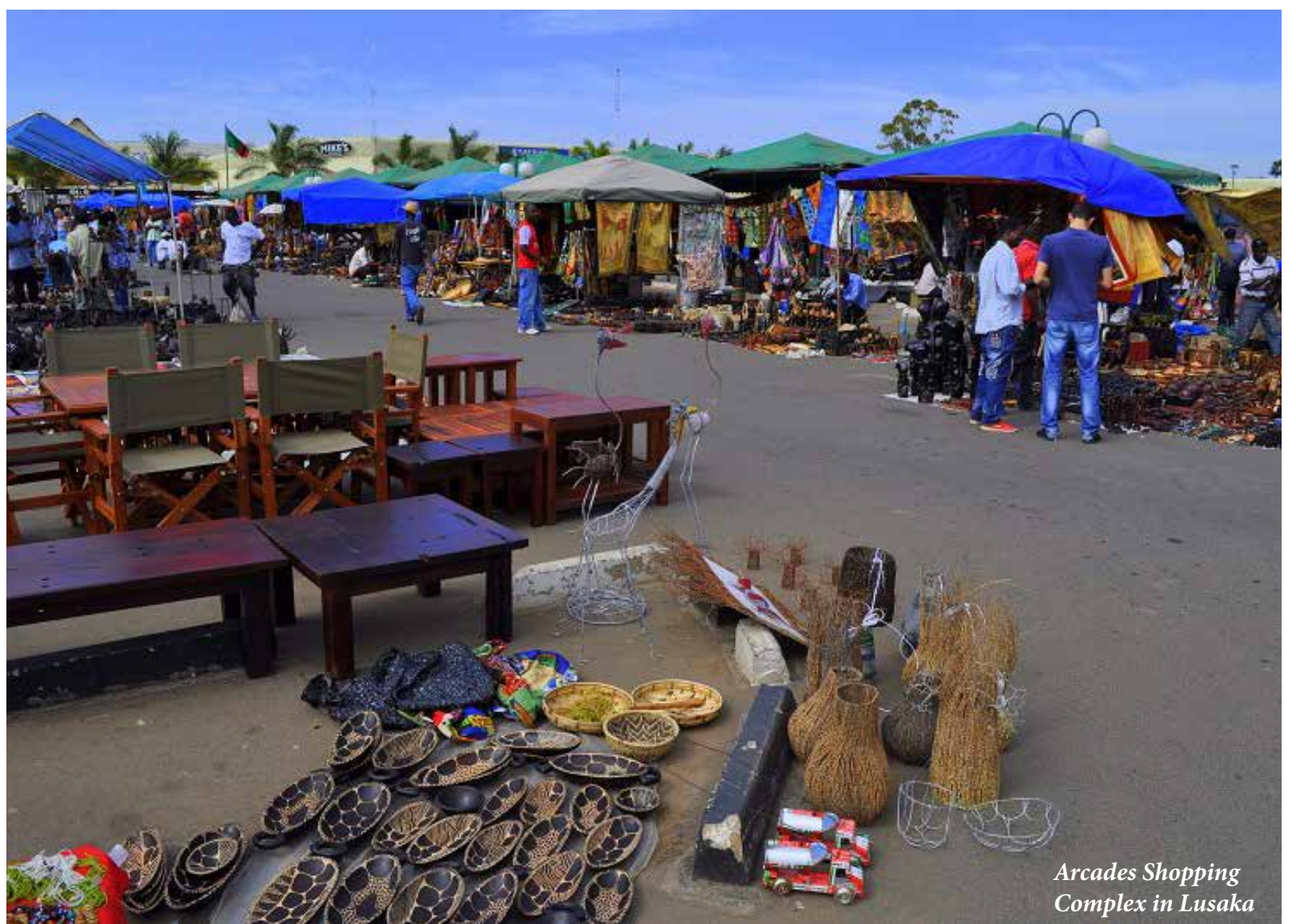
Arcades Shopping Complex in Lusaka