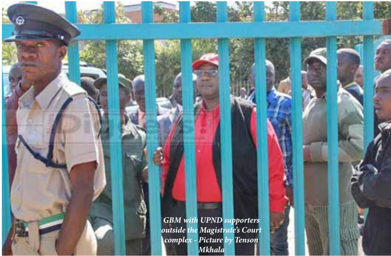
GBM with UPND supporters outside the Magistrate's Court complex