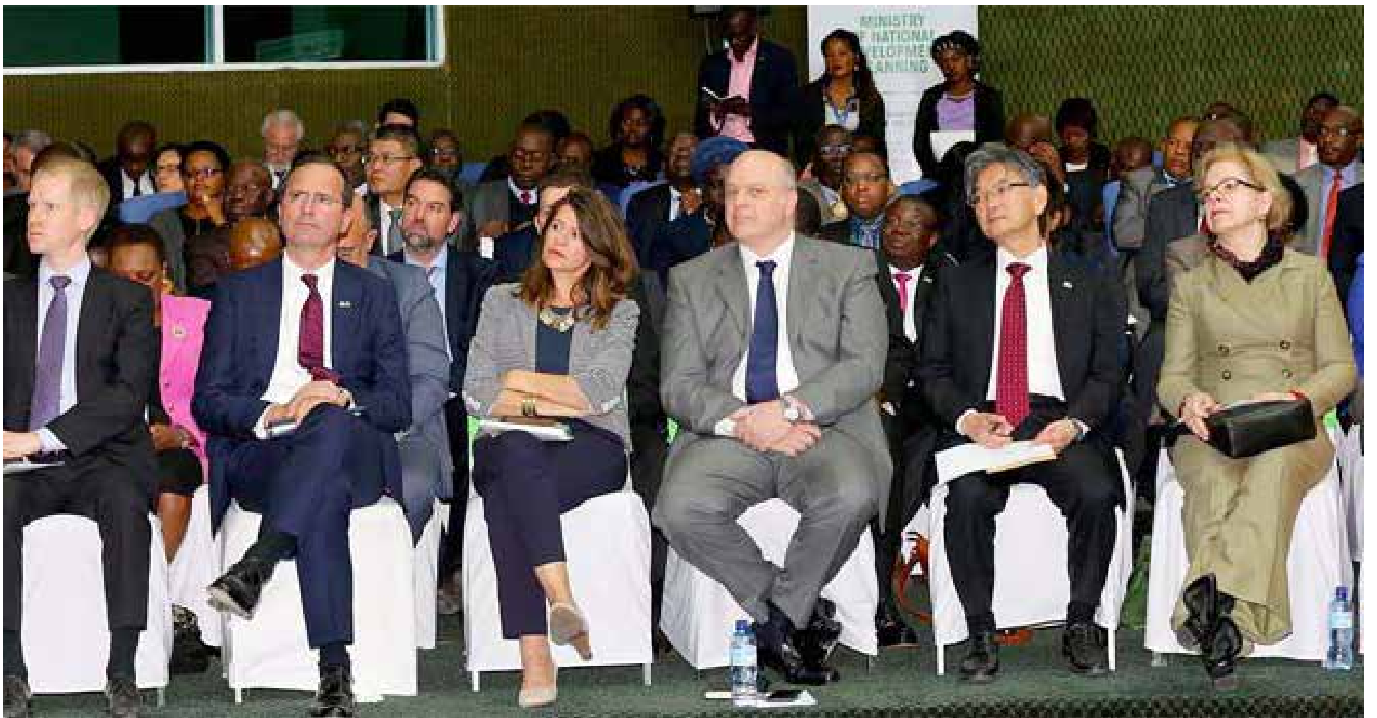
Diplomats at the launch of the 7th National Development Plan – picture courtesy of State House