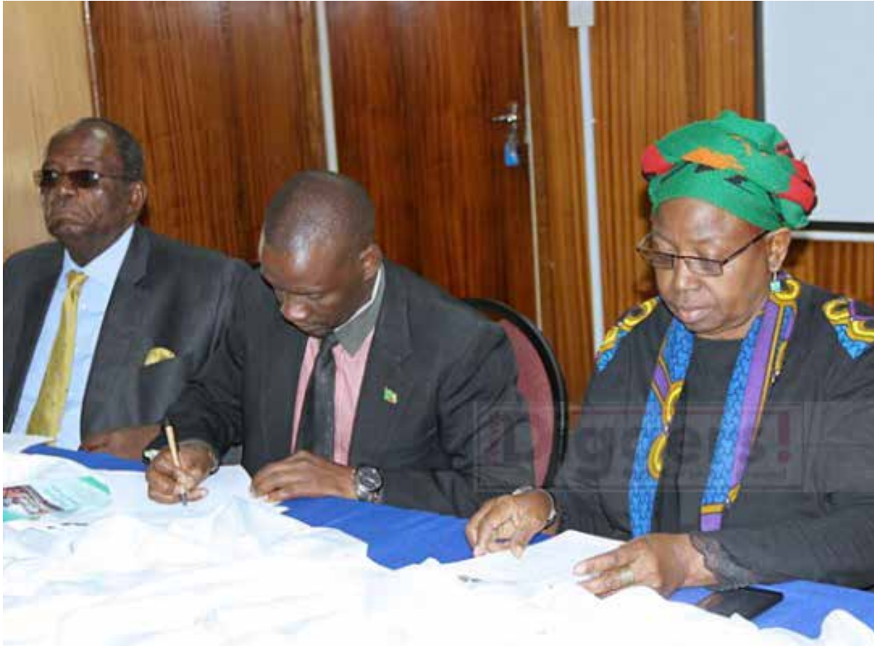
CISCA officials at the press briefing