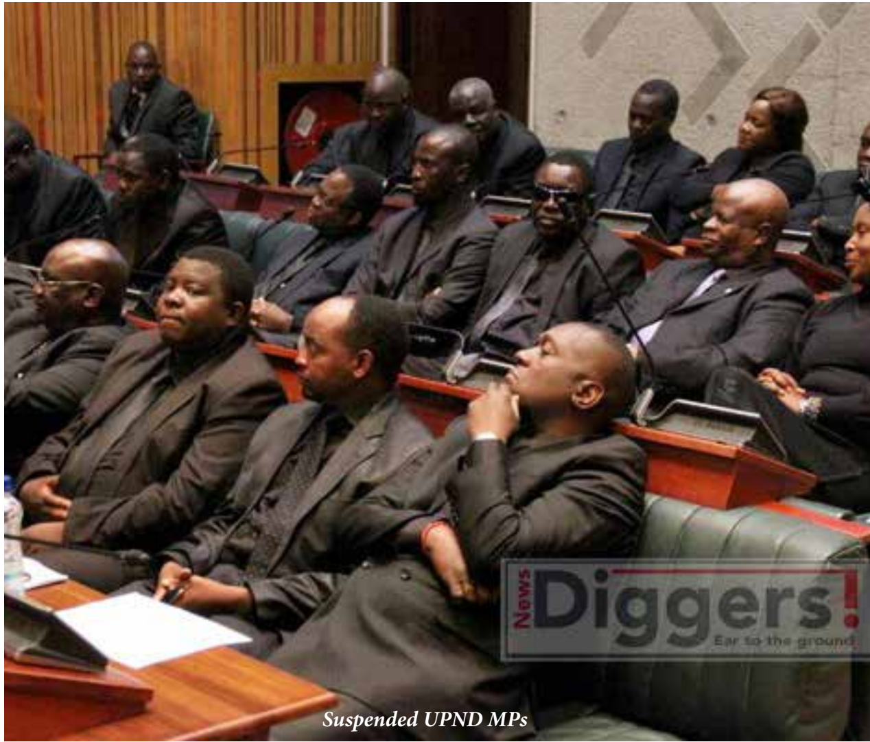
Suspended UPND MPs