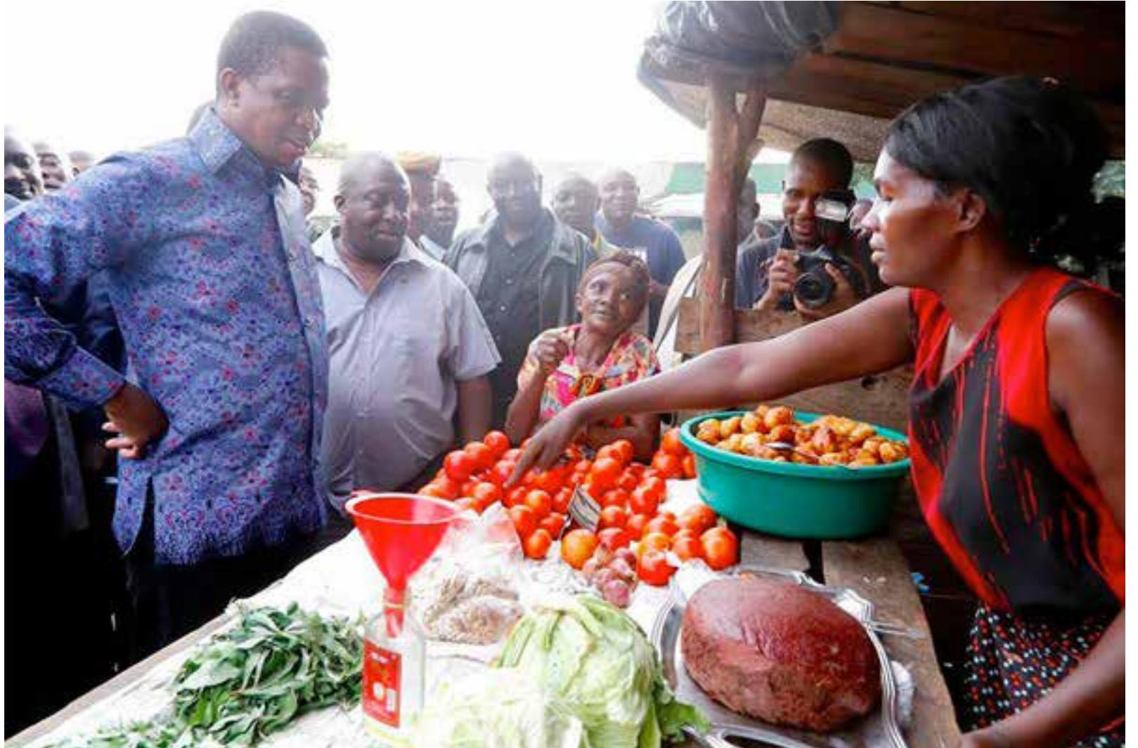
President Lungu with recipients of empowerment fund