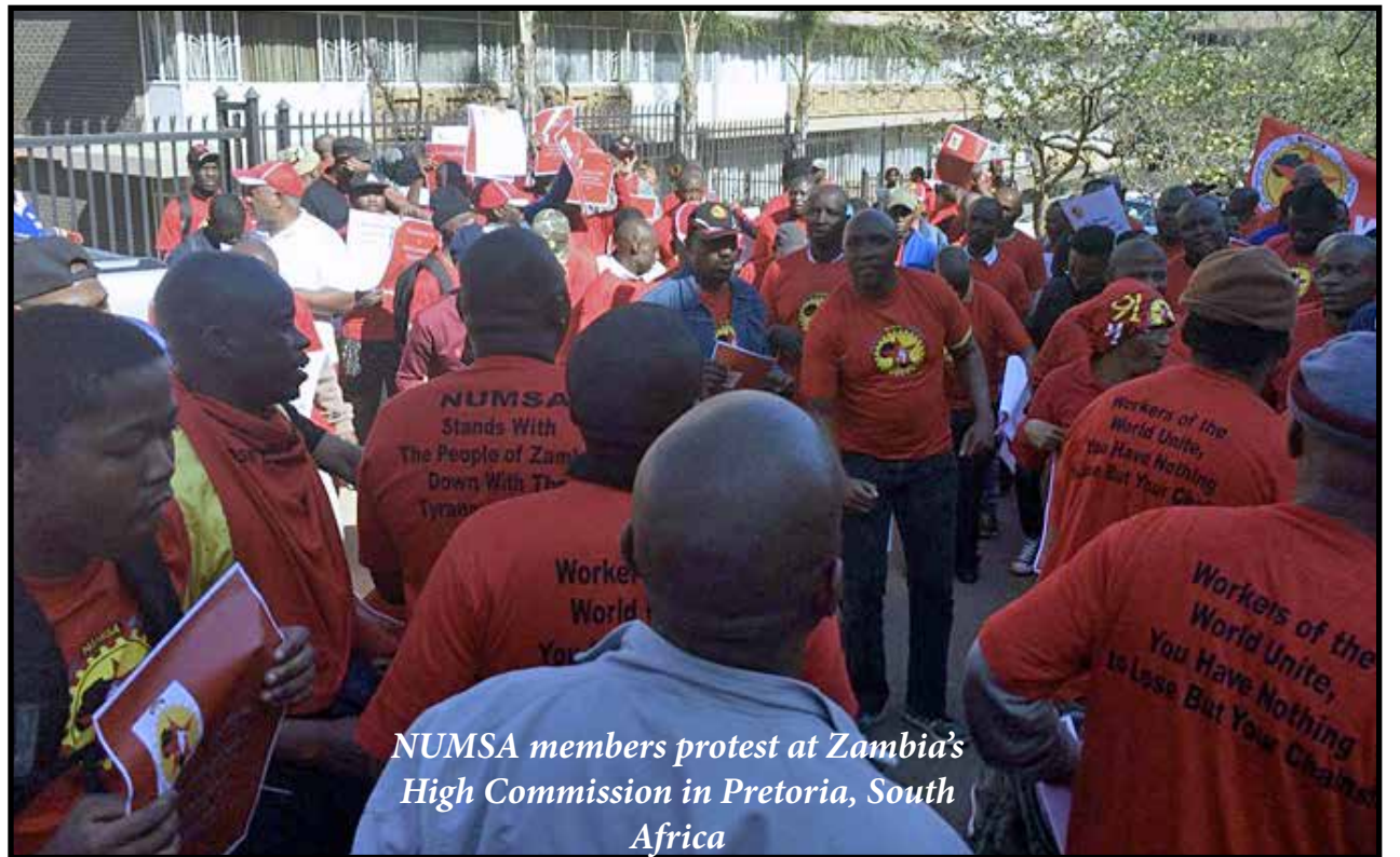
NUMSA members protest at Zambia's High Commission in Pretoria, South Africa