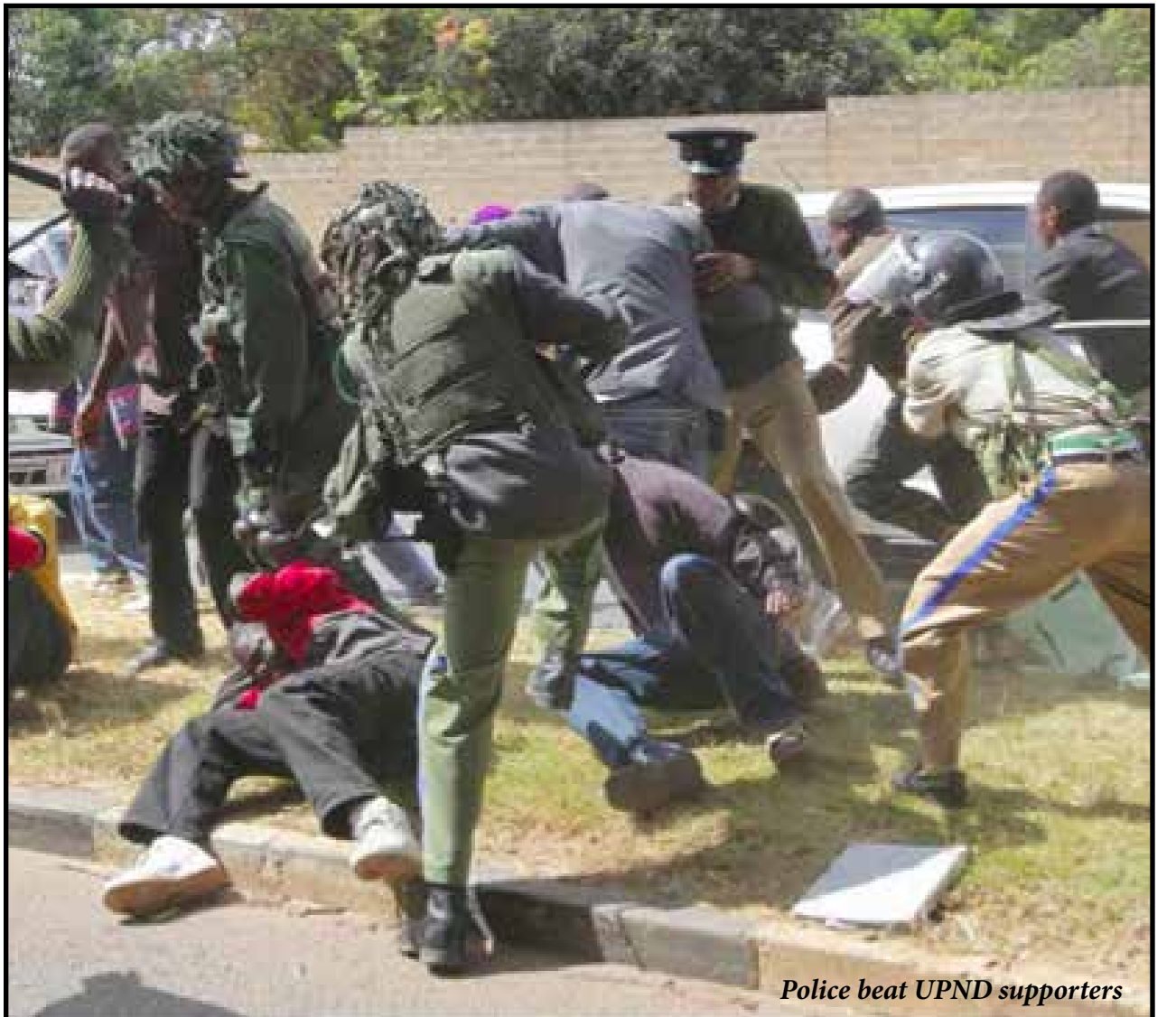
Police beat UPND supporters

"As we already indicated, the fire at city market is still being investigated. The fire experts are still establishing whether that fire caused by an electrical fault or it was caused by a person but people should understand to say that an electrical fault can also be caused by a person because someone can just tie...you know those who know how to connect these wires can just do so and then when you just switch on it blows up, so we are not ruling out any possibility here and this is the reason we are saying that even as the officers are on the ground trying to establish this, we have also instituted our investigations. And then the other reason which is making us to do this is because we have seen the way things are happening, pylon after pylon, market after market," said Katongo.