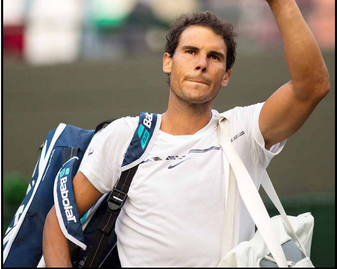
Two time Wimbledon Champion Rafael Nadal waves to the crowd before leaving the court after his fourth-round elimination by Gilles Muller at Wimbledon 2017