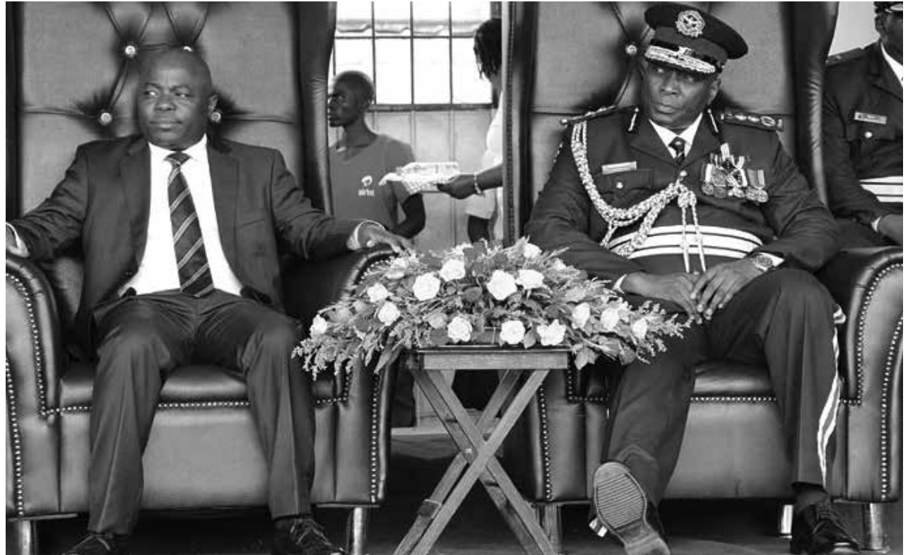
Inspector General of police Kakoma Kanganja (R) with Home Affairs minister Steven Kampanyongo