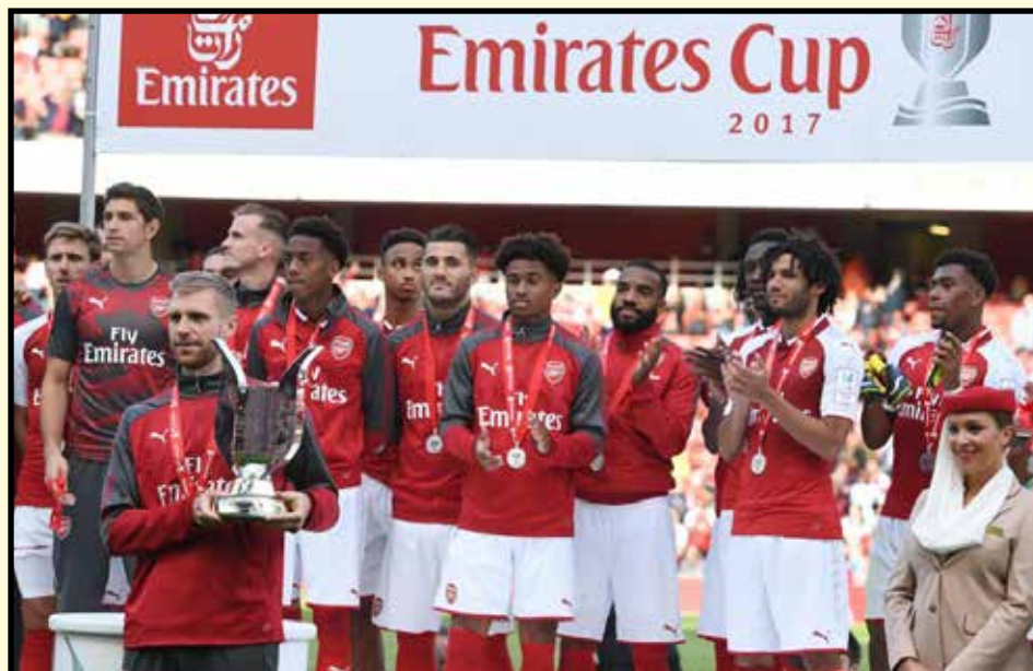
Arsenal players celebrating their 2017 Emirates Cup win