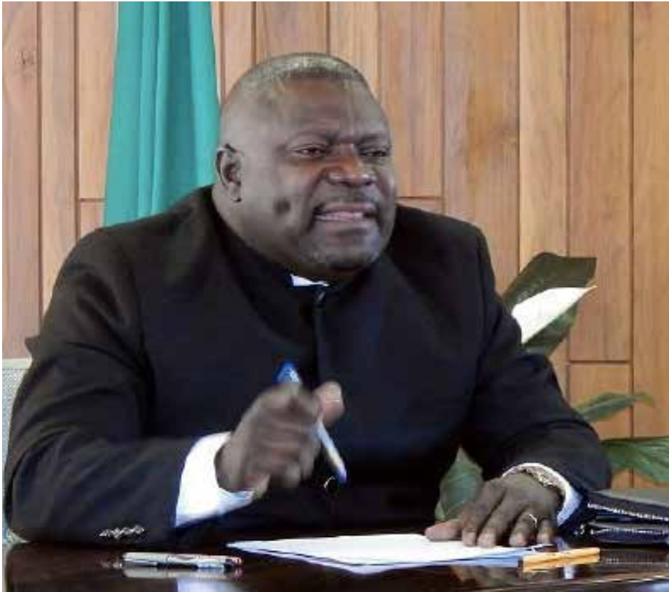
National Planning and Development Minister Lucky Mulusa