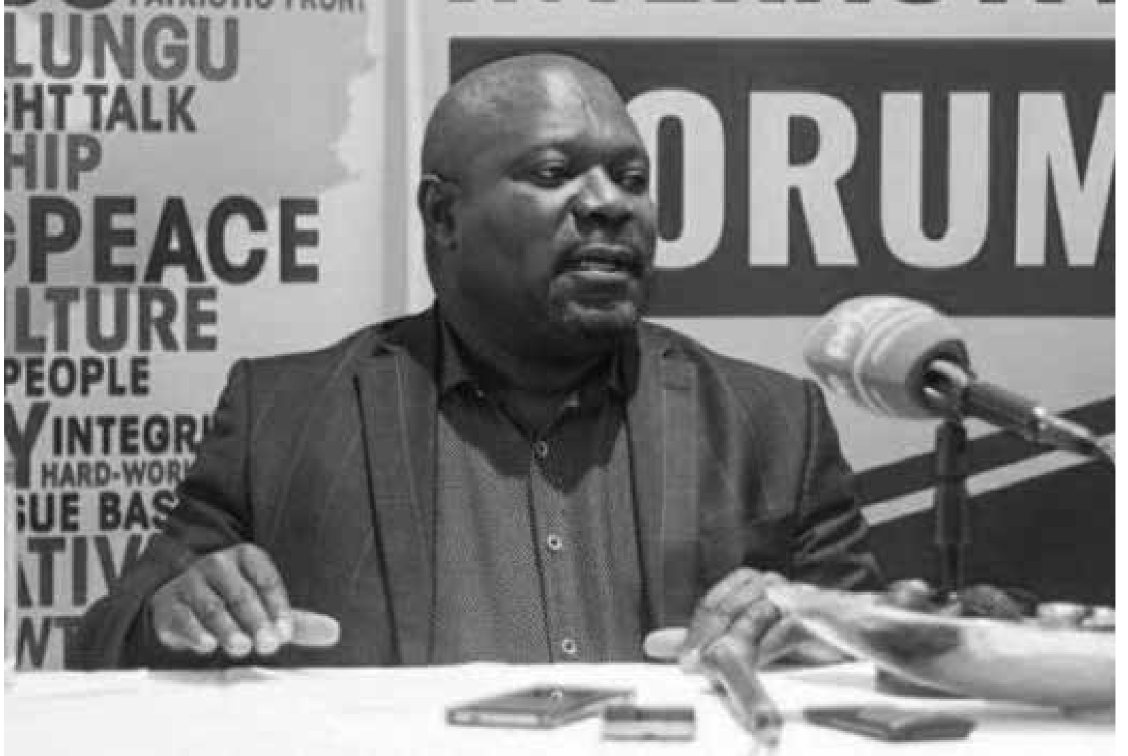
National Planning Minister Lucky Mulusa

constitution, University of Lusaka read the Constitution, when you