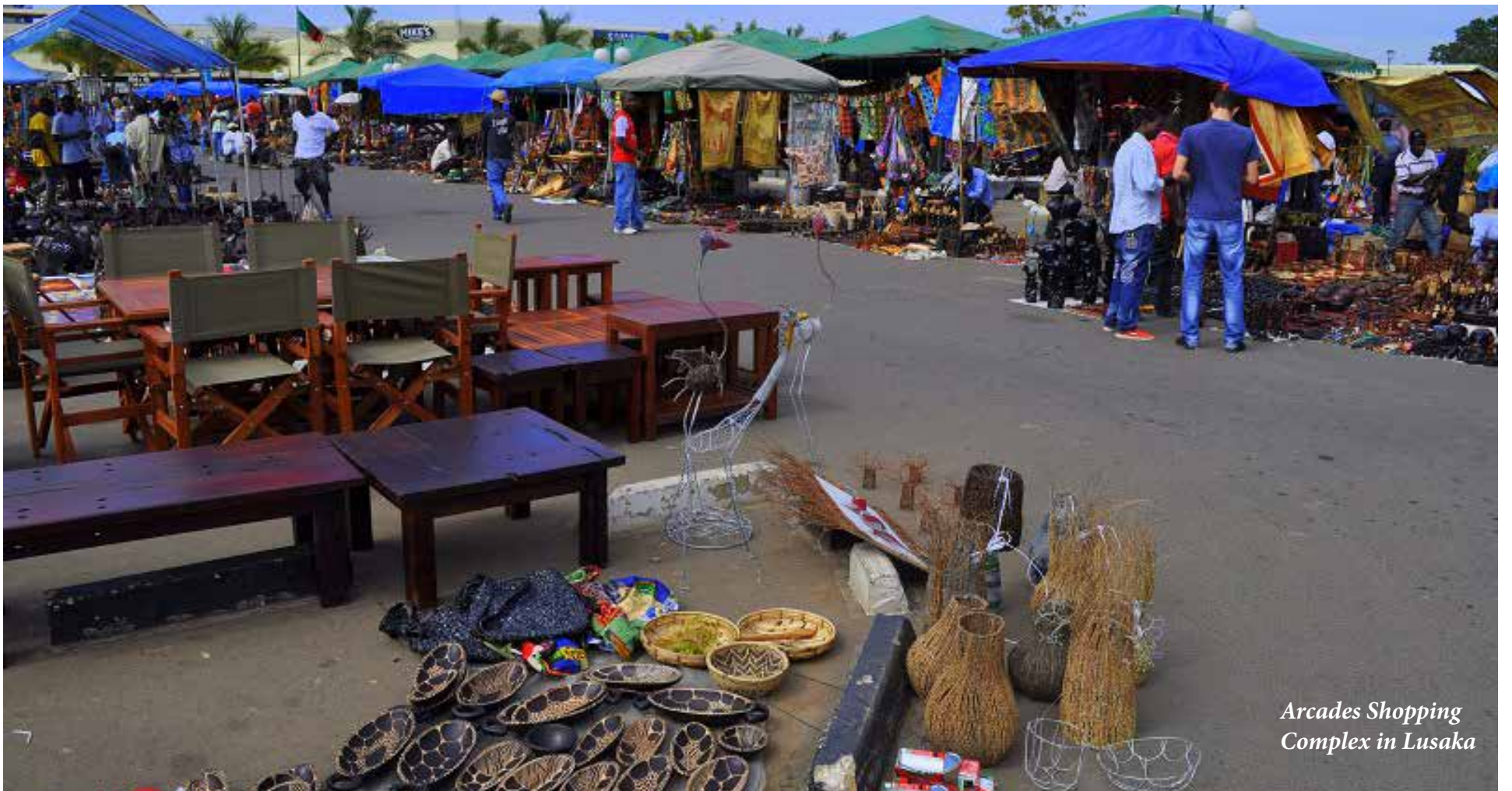
Arcades Shopping Complex in Lusaka