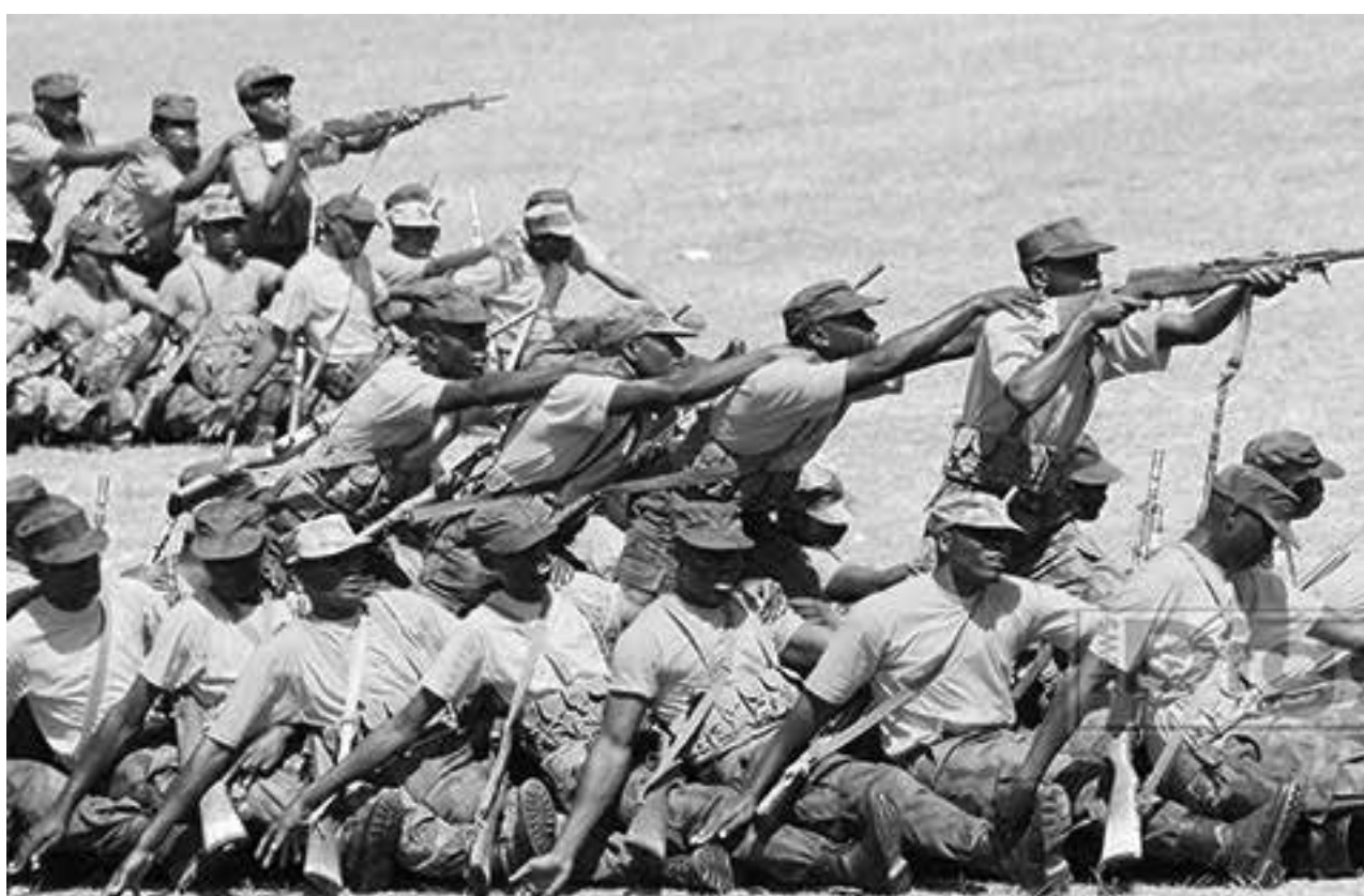
ZNS officers perform at the 91st Agriculture show in Lusaka

"It is also important for law enforcement officers to enhance community service policing and work towards identifying individuals in possession of, and abusing, military weapons such as an AK47 assault rifle."