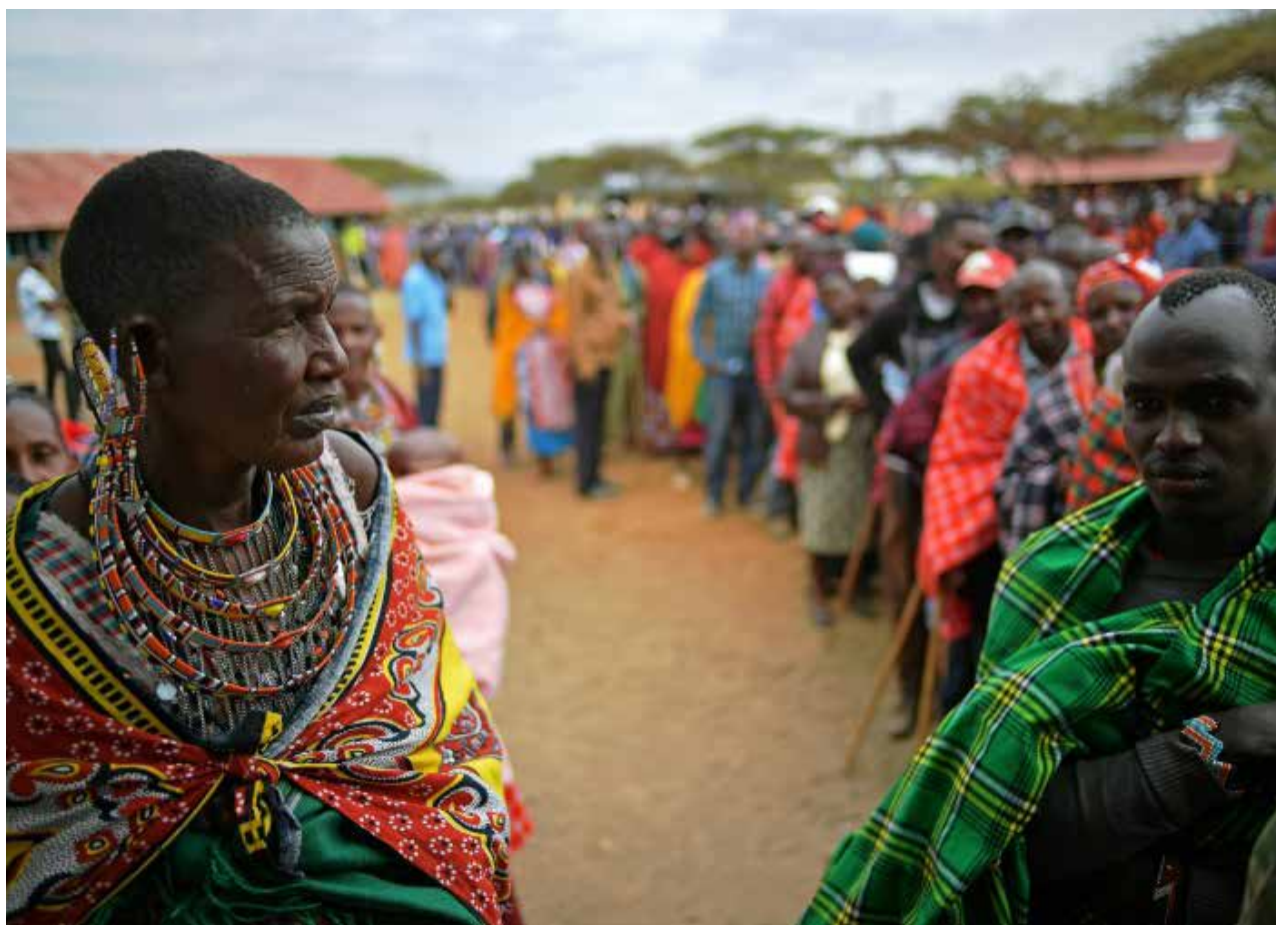
Maasai voters queue before voting at a polling station in Saikeri, Kajiado West County

However, it admitted that a lack of mobile data coverage had delayed the delivery of the supporting documents, forms 34A and 34B. BBC News