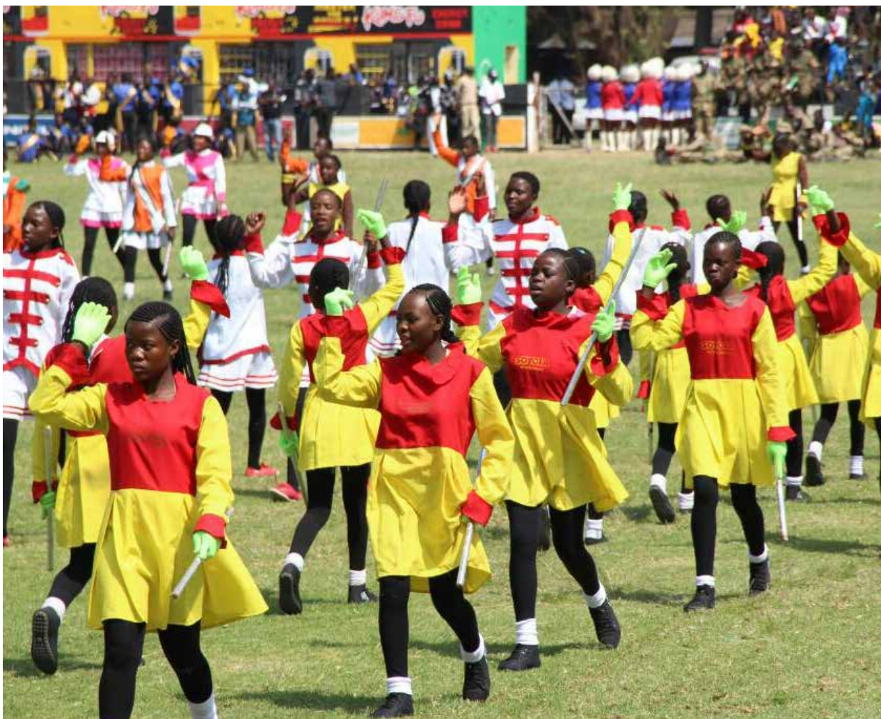
Majorettes from different parts of the country perform during the 91st Agriculture and Commercial show

And Lubinda said there were a lot of challenges that had led to the poor performance by ZIALE. “I cannot pre-empt this yet but one of the reasons according to the submissions I have received so far that has led to the poor performance at ZIALE is the preference of private colleges and Universities as opposed to Public Universities. But I am yet to issue a full report to this effect because right now I am still receiving submissions,” said Lubinda.