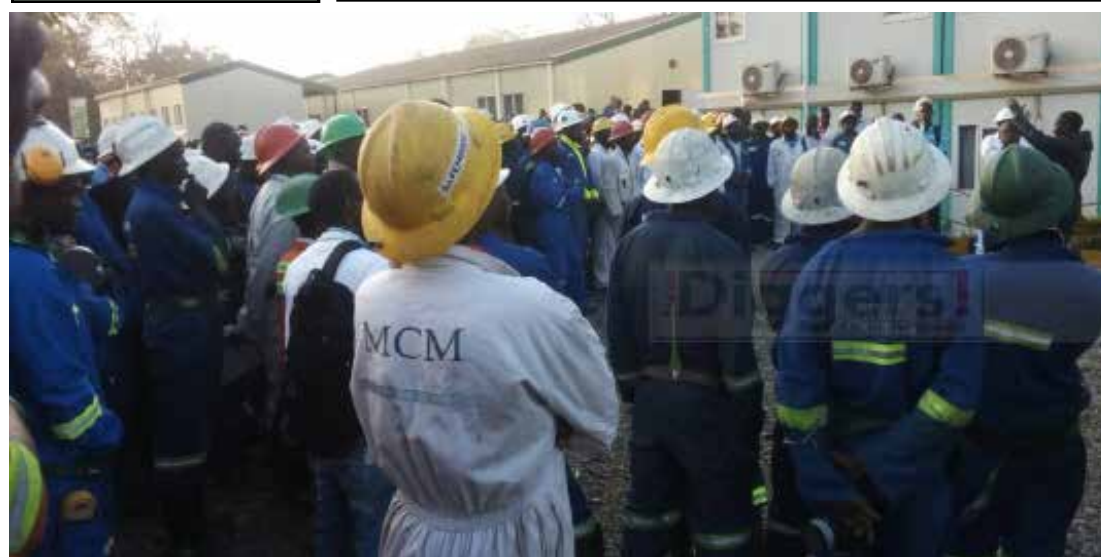
A Mopani Copper Mines manager addresses employees today