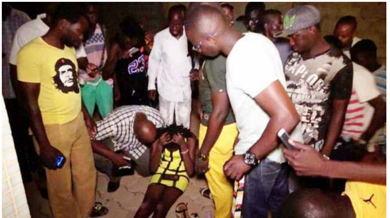
A wounded restaurant customer sits on the ground after the attack

in the building. A jihadist attack on a cafe nearby left 30 people dead in January last year. There are fears that the attack is the work of one of the affiliates of al-Qaeda that are active in the Sahel region, the BBC’s Alex Duval Smith reports. The shooting began shortly after 21:00 (21:00 GMT) on Sunday on Ouagadougou’s busy Kwame Nkrumah Avenue.