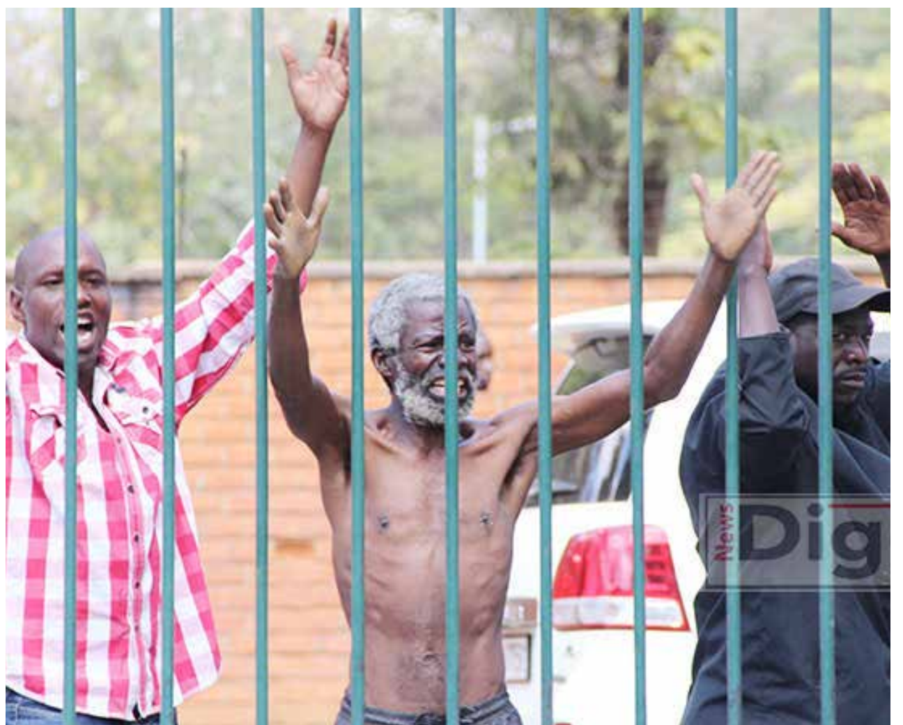
UPND supporters at Lusaka High Court during HH's treason case August 14, 2017