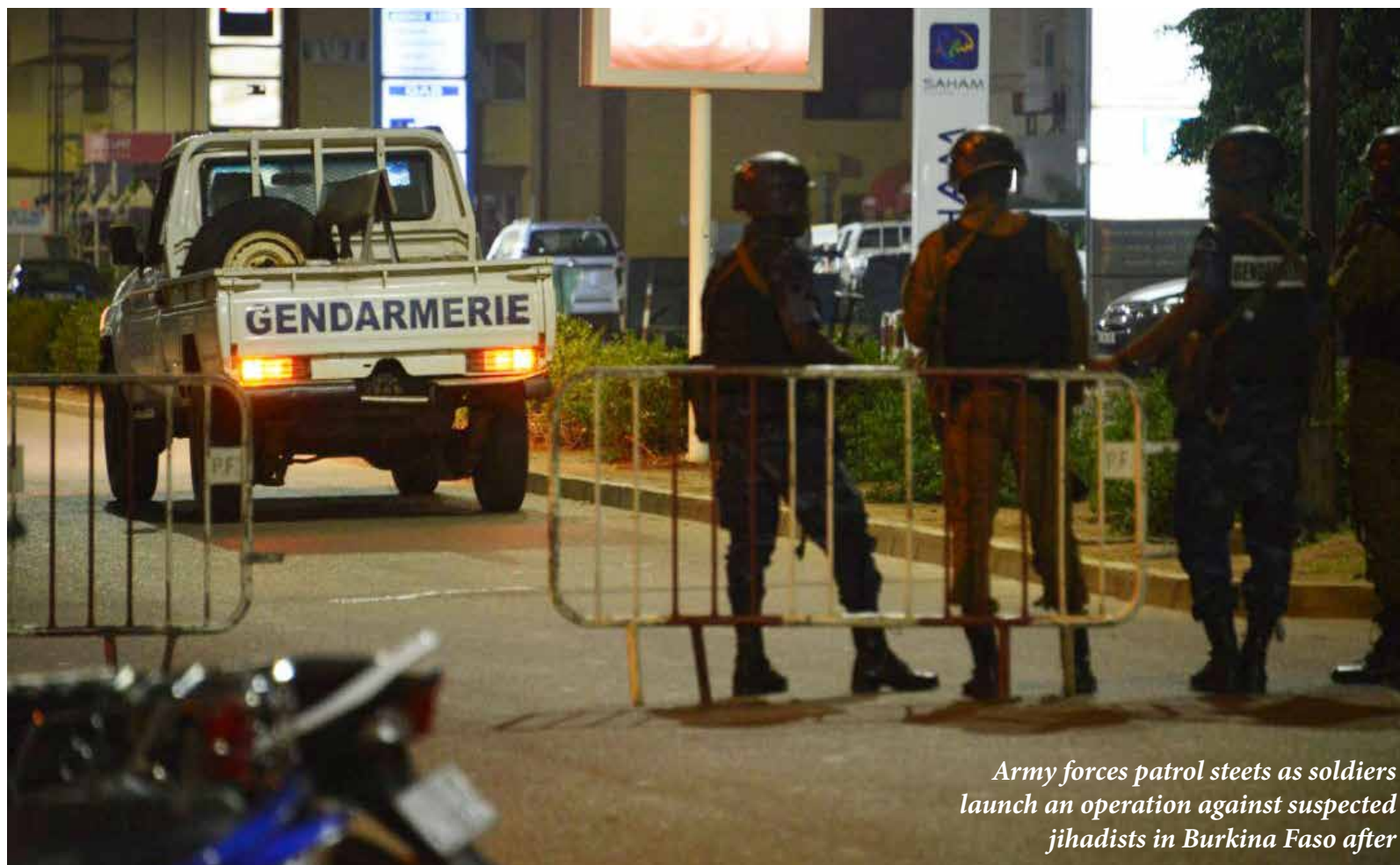
Army forces patrol steets as soldiers launch an operation against suspected jihadists in Burkina Faso after

A multinational force run by African nations to target jihadist forces in the Sahel region has been established, but it will not be operational until later this year. BBC News