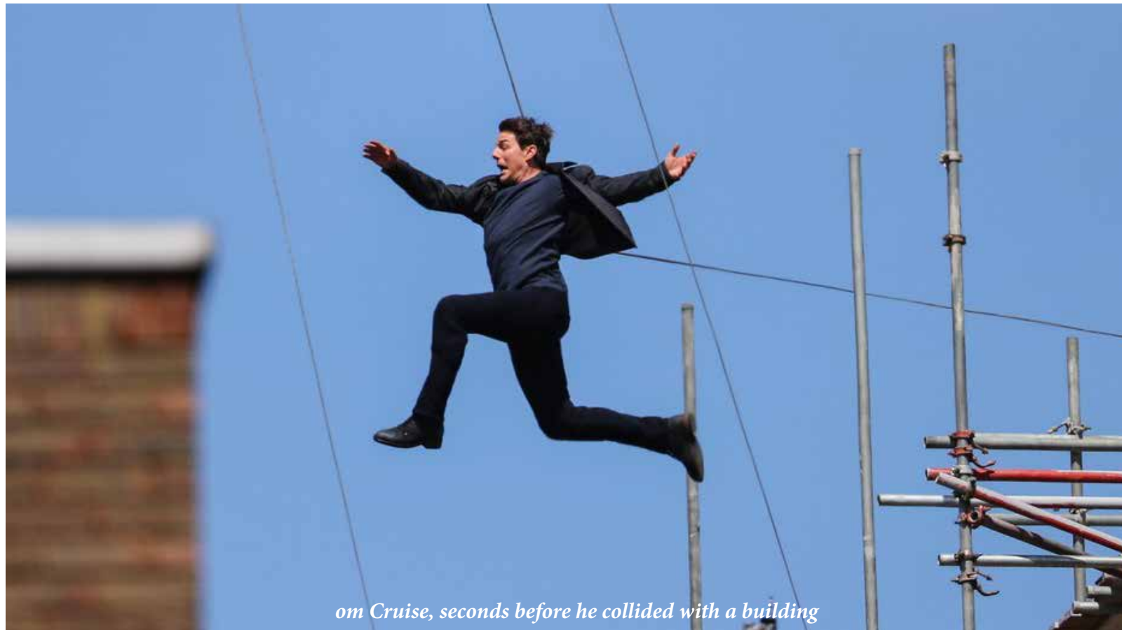
Tom Cruise, seconds before he collided with a building

accident after co-star Emily Blunt undertook a driving scene at high-speed. Yahoo News