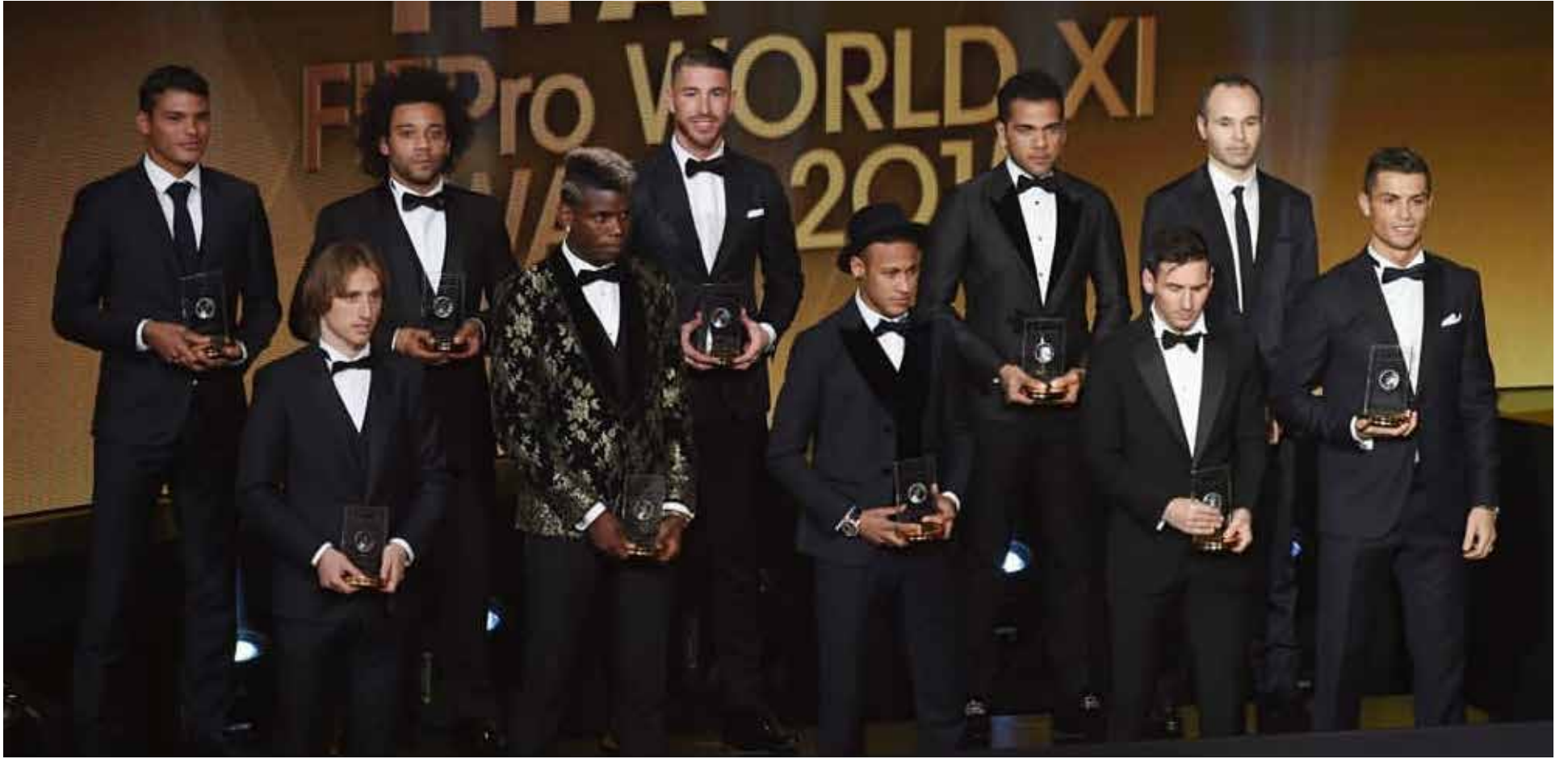
The 2016 FIFA mens team of the year at the Ballon d'Or gala

Real Madrid have dominated the shortlist, with over 20 players vying for the personal accolade after impressive seasons. Andres Iniesta is one of the more surprising names on the 24-man shortlist for the Best FIFA Men's Player award for 2017.