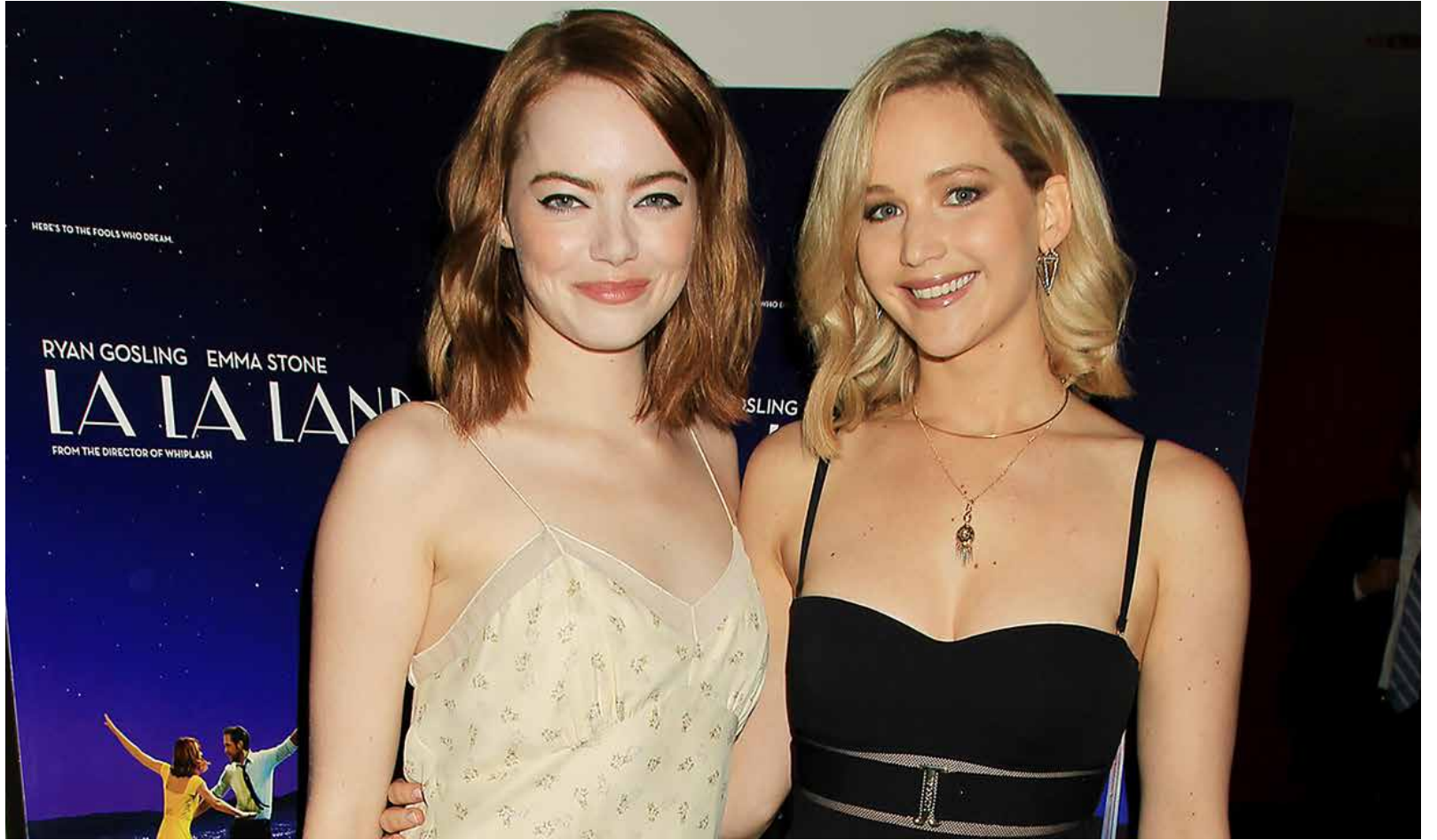
Emma Stone (l) with Jennifer Lawrence

Carell. The film, out Sept. 22, tells the true story of the 1973 tennis match between Billie Jean King and Bobby Riggs. Yahoo News