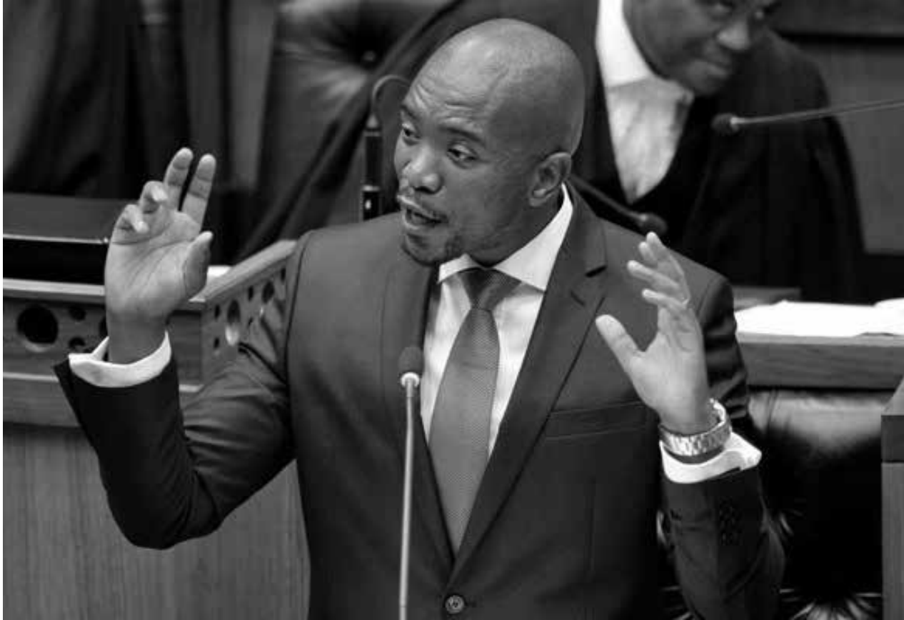
South Africa's Democratic Alliance leader Mmusi Maimane