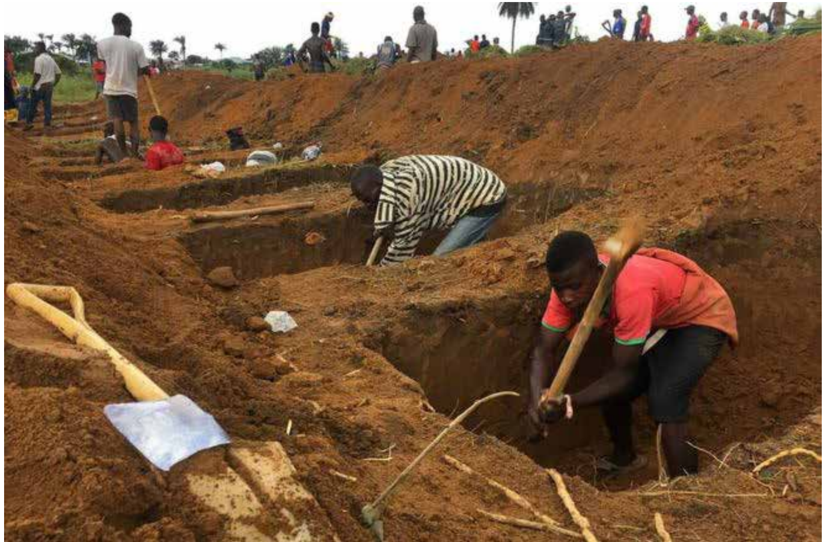
The graves were prepared at Waterloo, 30km from Freetown

A mass burial for about 300 people killed by a mudslide and flooding has taken place on the outskirts of the capital Freetown.