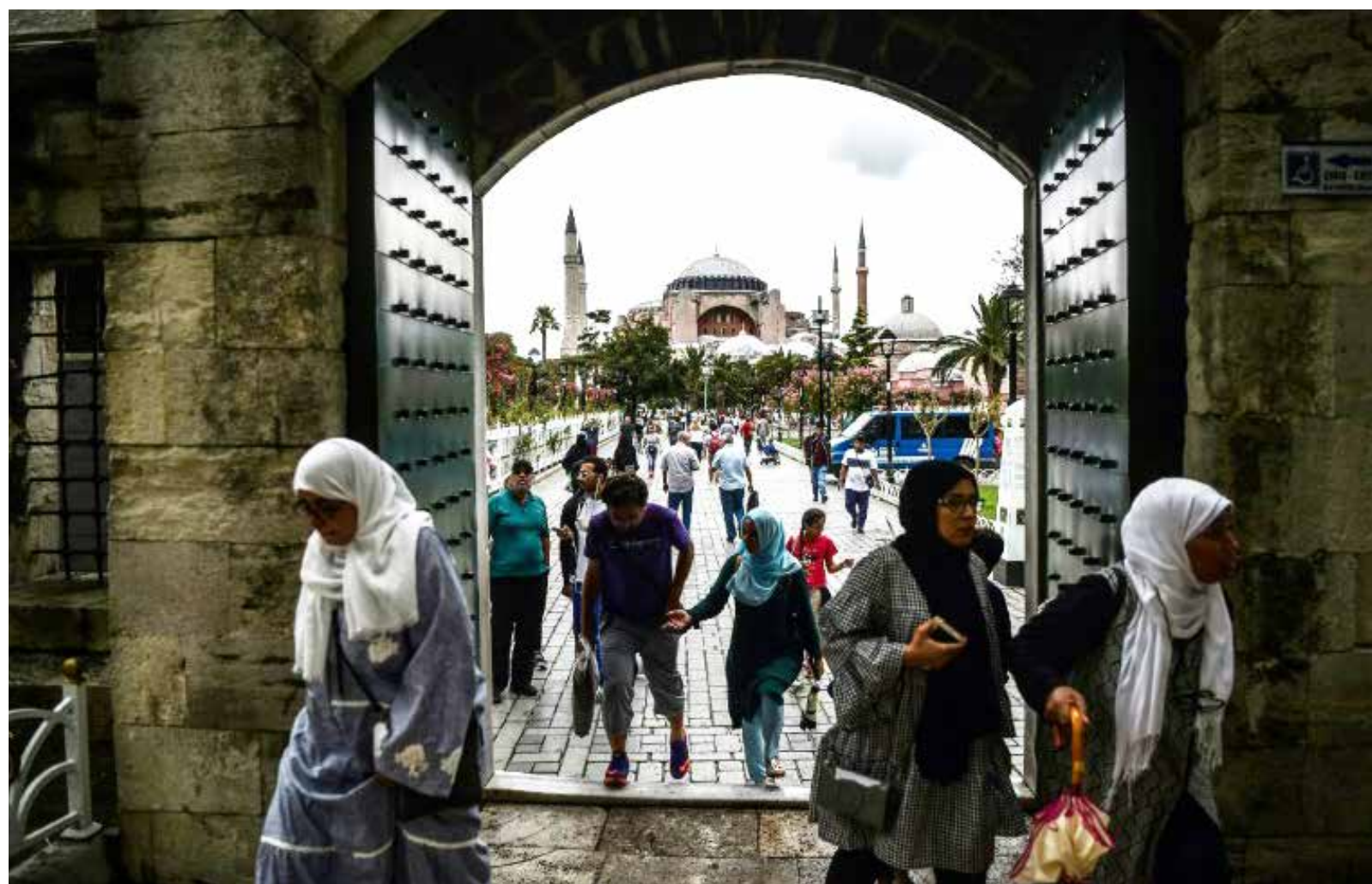
People enter to Sultanahmet (Blue) mosque during a rainy day in Istanbul

"In all but one of the cases the suspects have been apprehended," Mr Kasingye said. BBC News