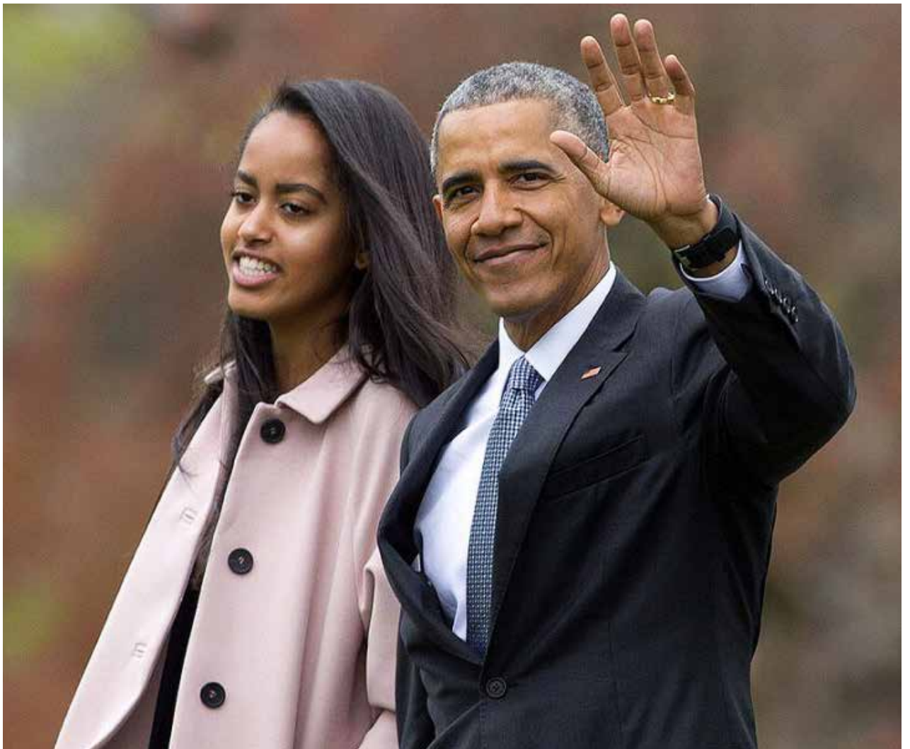
Former US President Barack Obama with his daughter Malia

Obama revealed last year the advice he gave his older daughter about higher education. “Be open to new experiences when you go to college,” he said. “Don’t go to college just to duplicate the same experience you had in high school.” Yahoo News