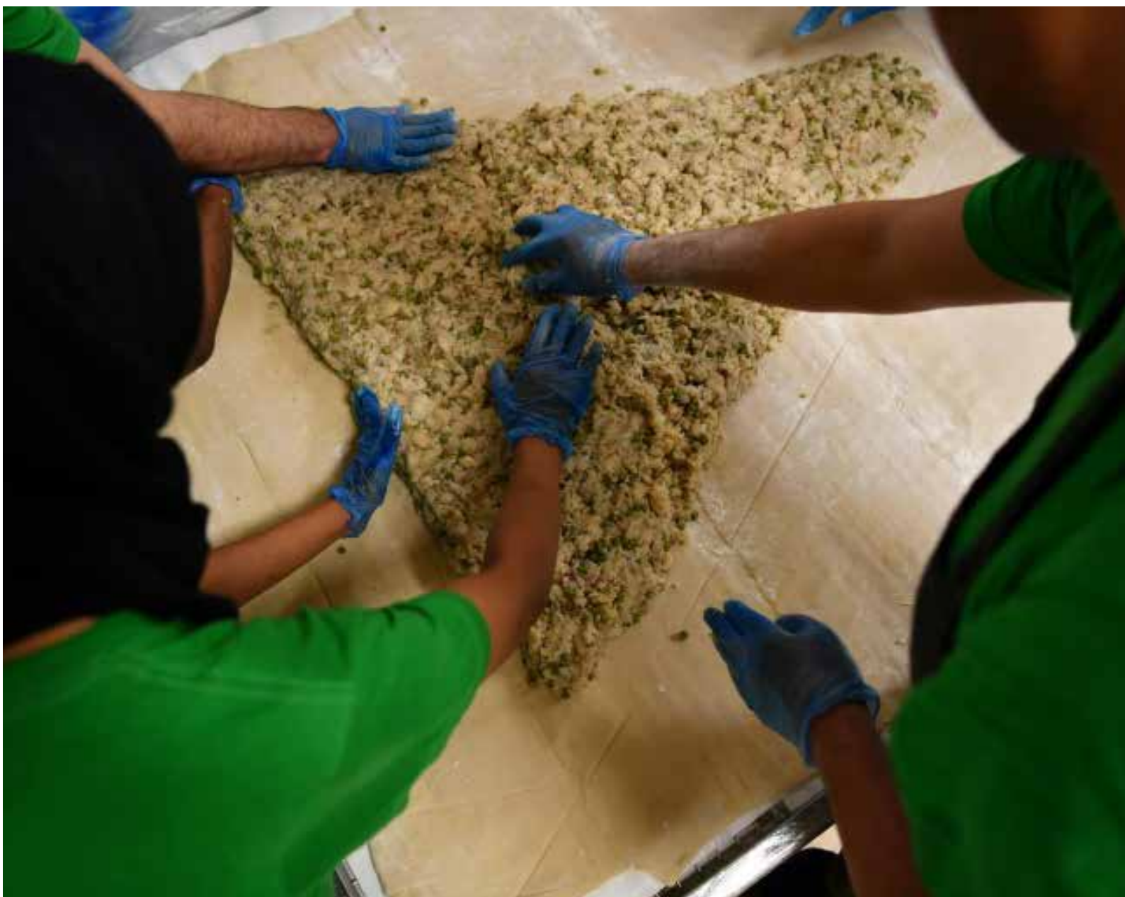
Muslim Aid staff and volunteers attempt to construct and cook the world's largest samosa at the East London Mosque

In November, Jon sat down with Entertainment Tonight and claimed that he hasn't seen all eight children together “probably in three to four years.” Yahoo News