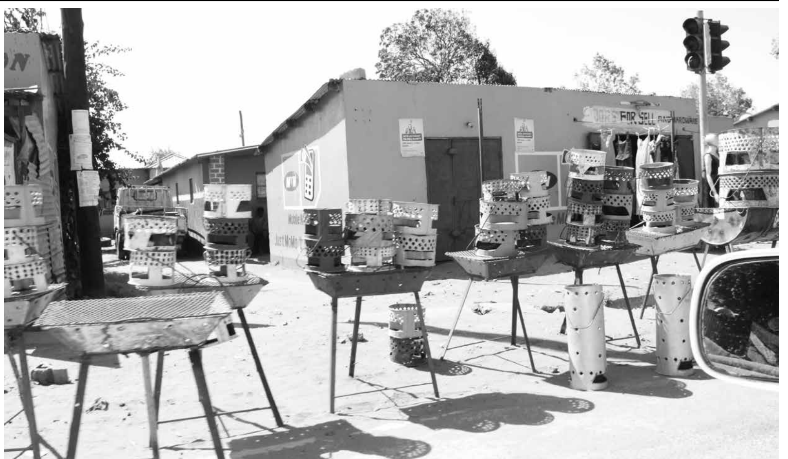
Different types of braziers being displayed along Alick Nkhata road in Lusaka’s Kalingalinga Township

wish to remind you that your office is obligated to provide answers from any Zambian who seeks clarification. I am deeply disappointed that you have chosen to avoid this issue of debt in the hope that it will die a natural death and you shall not be called to account. We demand an answer from your office.”