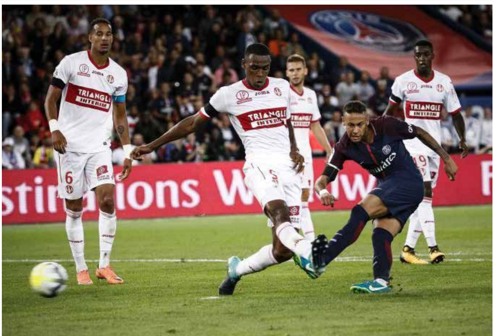
PSG's Neymar gets a shot away as four defenders look on helplessly.