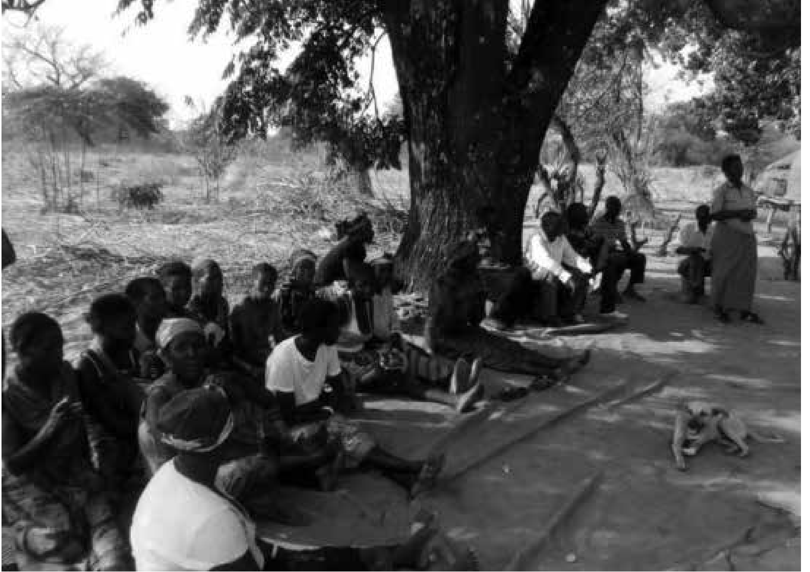
Some farmers in Sioma talk to officials from WWF - picture by Thomas Mulenga

Lubinda disclosed that he was converted to conservation farming when WWF started the sensitization project on conservation farming in the area in 2009.