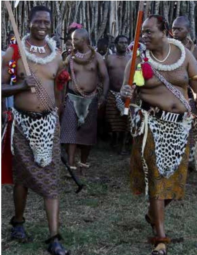
President Lungu with King Mswati III (above)