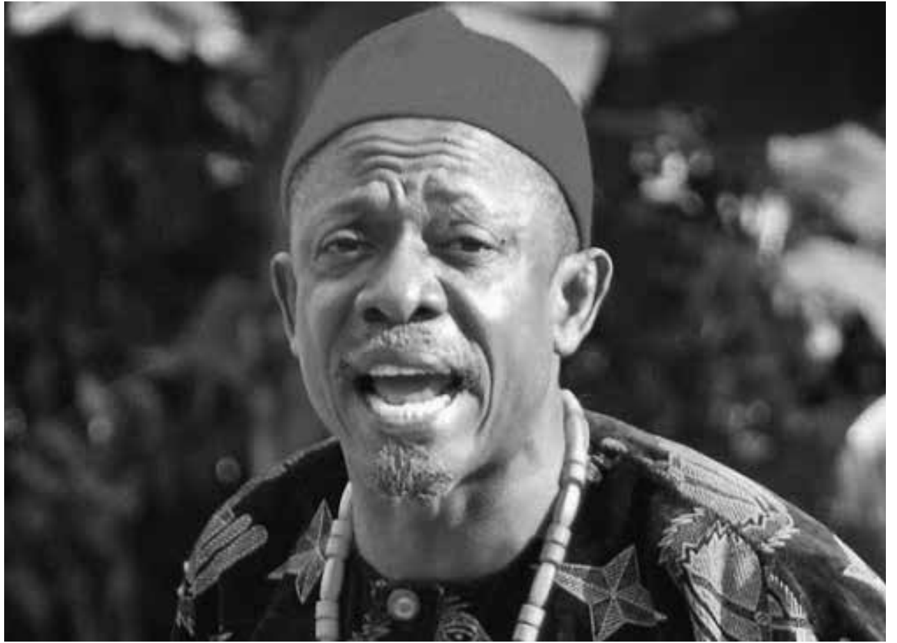
Nigerian actor Nkem Owoh (Ukwa)

“At one point I declared that I was not going to feature at a government function because I was trying to avoid politics. I was in politics before even