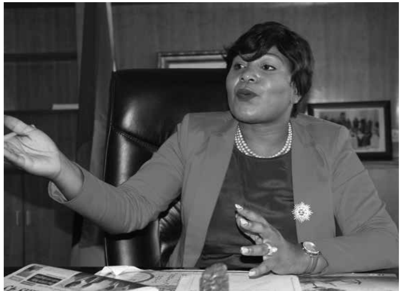
Information Minister Kampamba Mulenga during an interview with News Diggers! at her office in Lusaka