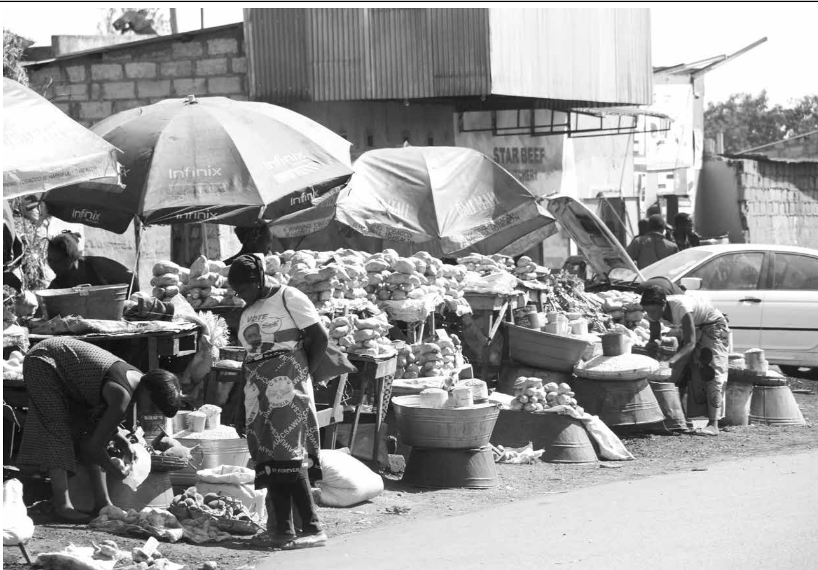
A woman buying sweet potatoes in Lusaka’s Mtendere Township.