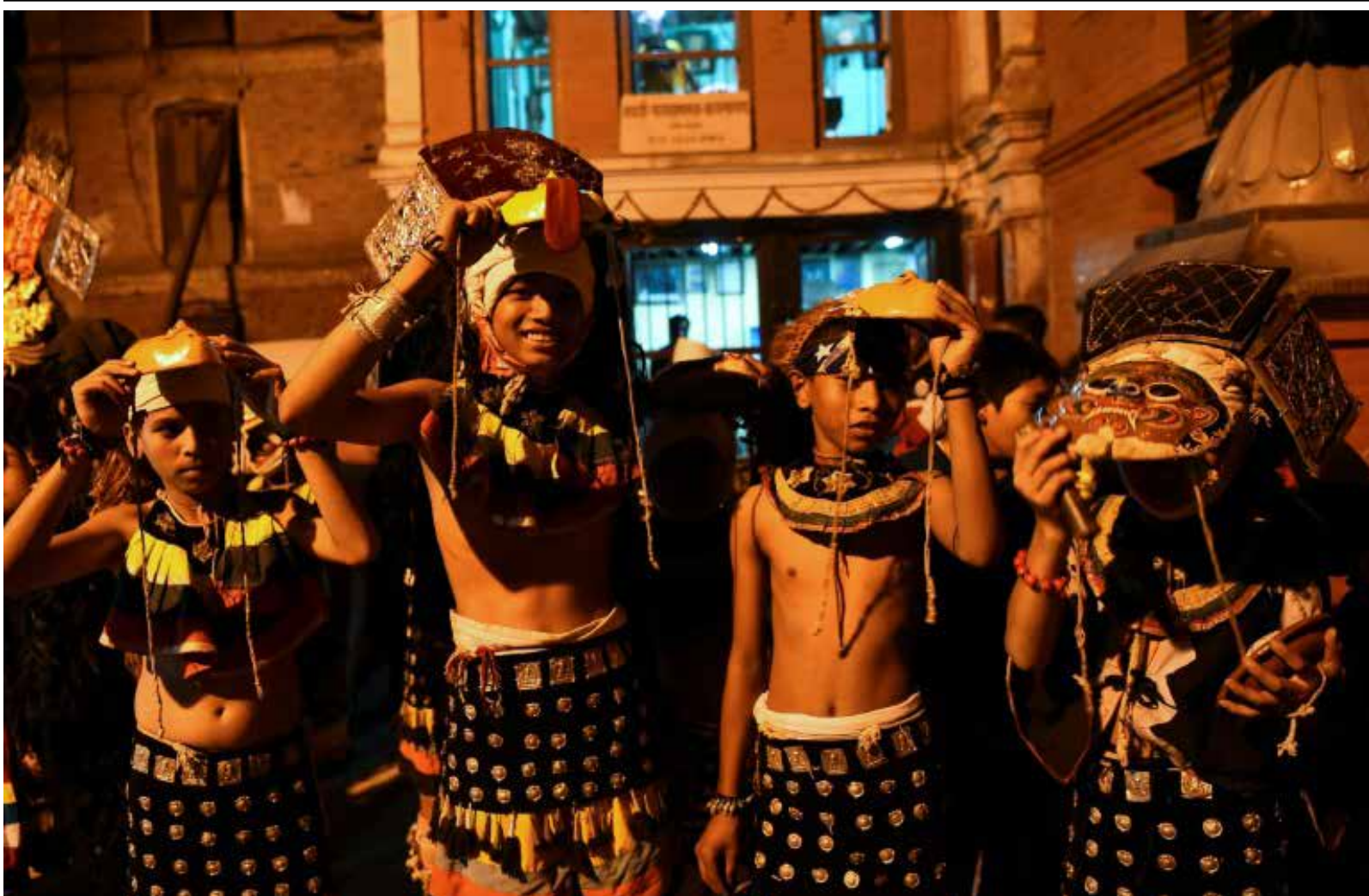
Nepalese dancers prepare to perform a traditional dance on the second day of the Hindu festival of Indra Jatra, which symbolises unity, victory and power, in Kathmandu.

Harvey himself released a statement in January as the outrage began to bubble up, explaining then why he met with the President and affirming that "he would sit with Trump anytime." Yahoo News