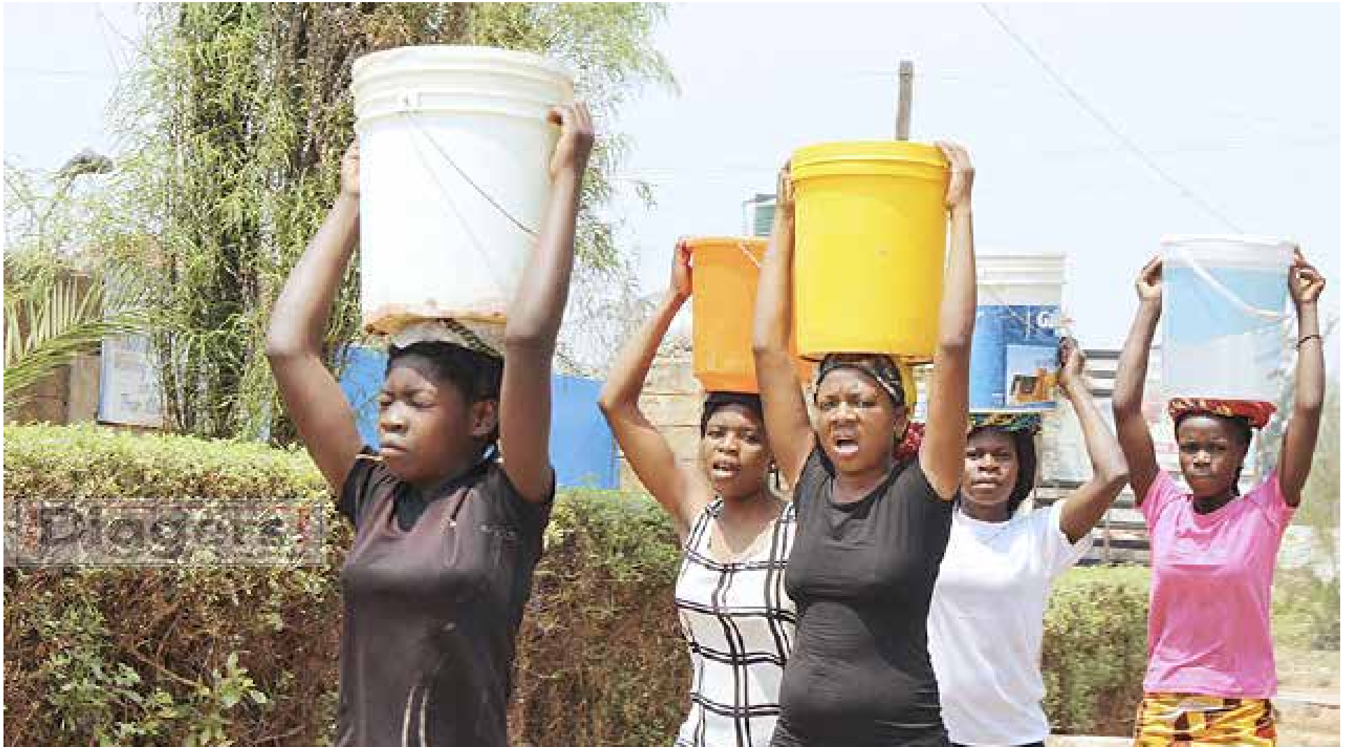
WATER BLUES: Mtendere compound residents return from drawing water in Kabulonga as the announced 5-day interruption of water supply in several residential areas in Lusaka takes effect