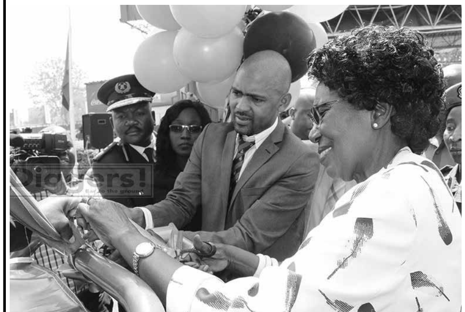
Vice president Inonge Wina and Local government minister Vincent Mwale cuts a ribbon during the hand over of 42 fire fighters to the council in Lusaka September 13, 2017