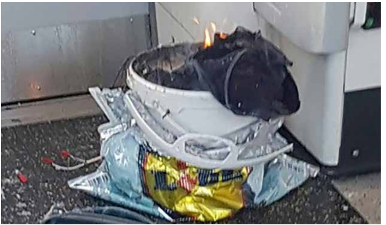
The "bucket bomb" went off in a packed carriage on a London Underground train, and although the device is thought to have malfunctioned it still caused a large explosion followed by what witnesses said was a fireball

British media on Sunday appeared to show a man walking from the property on Friday morning, carrying a bag similar to the one containing the failed device.