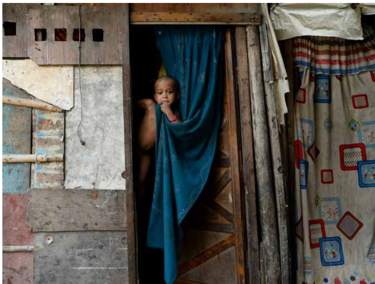
A young Rohingya refugee is held up in her makeshift shelter in New Delhi

"A major aim of the output will be to help Ethiopians and Eritreans better understand their place in the world. The new language services will also provide the BBC's global audience with a far better perspective and understanding of the Horn of Africa," he added. BBC News