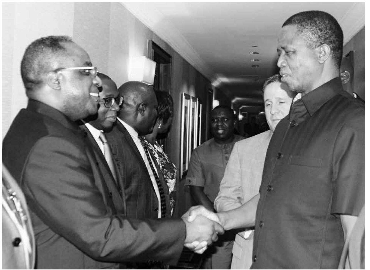
President Edgar Lungu greets Zambia's staff at the country's Embassy in New York after arriving for the 72nd UN General Assembly