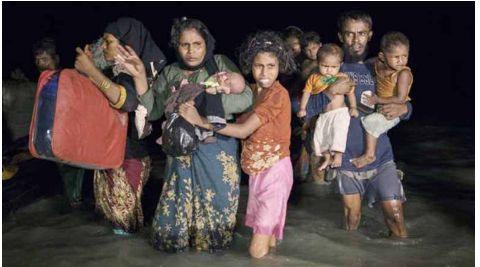
Many Rohingya fled by night into Bangladesh leaving everything behind

Since then, there have been periodic flare-ups and, in the past year, the emergence of