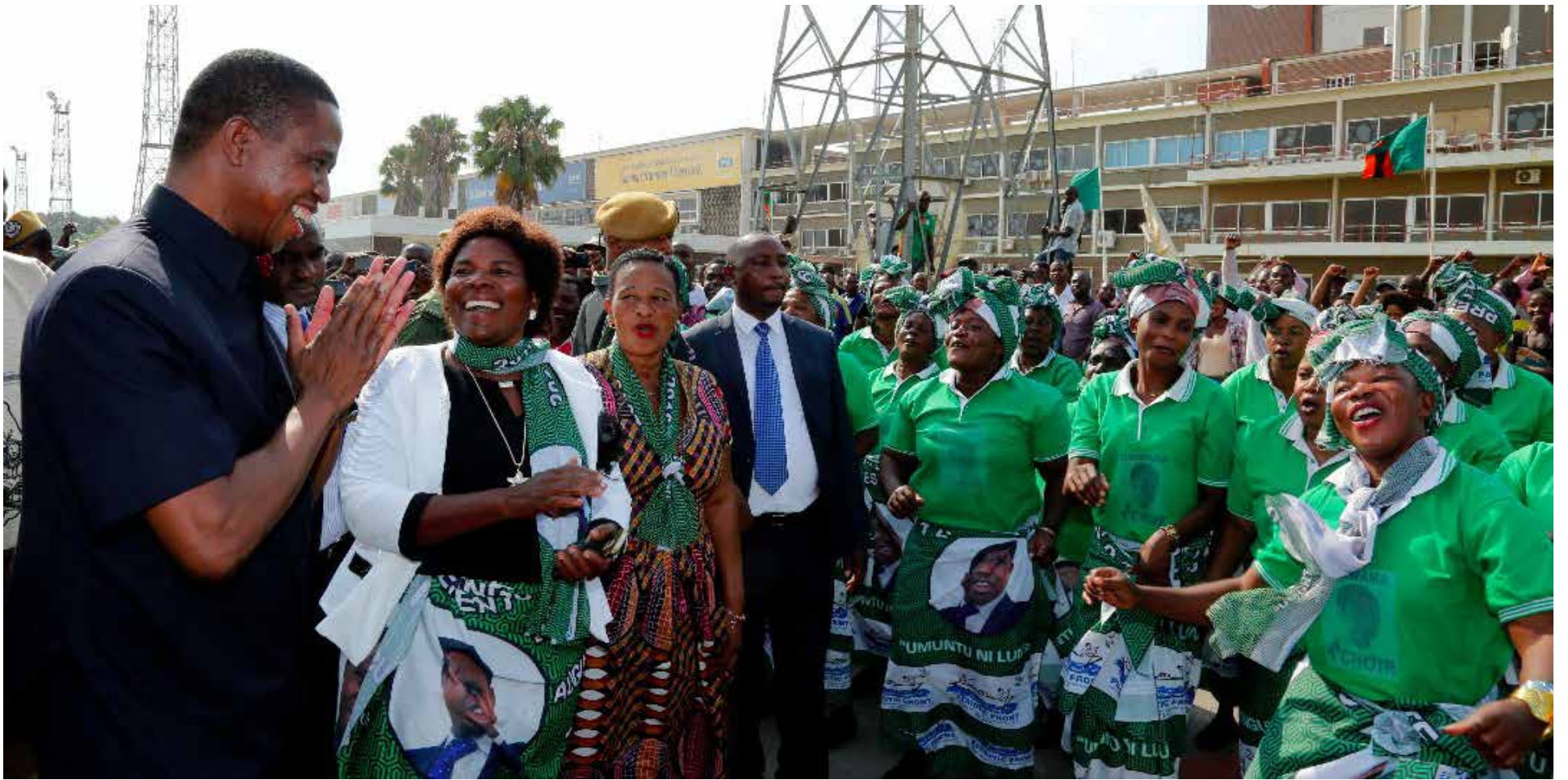
President Edgar Lungu salutes his supporters who escorted him at Lusaka's Kenneth Kaunda International Airport shortly before departure for Botswana today