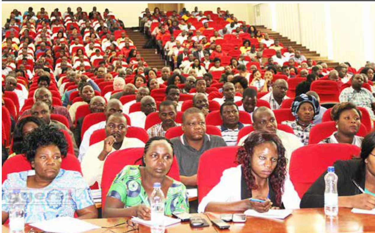
Agro dealers at government complex in Lusaka during a meeting with officials from the Ministry of Agriculture on September 27, 2017

Of course outsourcing is not illegal but KCM can only outsource if the contractor has an employment licence and abides by the provisions of section 56 of the Employment Amendment Act No. 15 of 2015 which deals with employment agency permits and this can only be done after negotiations between management and the unions. So KCM are hereby reminded again to stop those transfers if they have started effecting them before conclusion of discussions and we urge both parties to sit and negotiate matters that relate to outsourcing," said Mulenga.