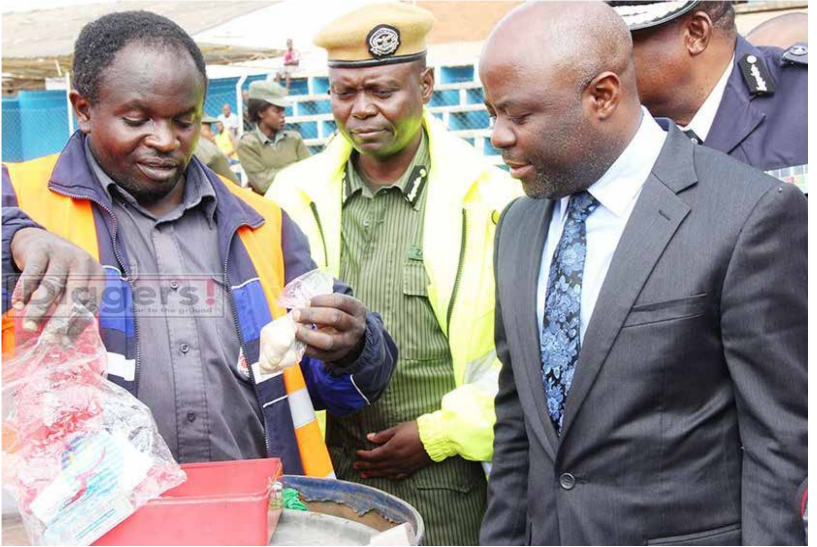
Home Affairs minister Stephen Kampyongo inspects drugs that were confiscated by a combined team of police, immigration and drug enforcement commission officers in Chibolya Township on September 29, 2017

which we thought was going to help him but it wasn’t to be. And so I think we shall continue revising some of these programs but again we also have to look at the source, where is this chamba coming from? You remember sometime back we used to have programs of going through these provinces to sensitize the people that are cultivating these substances so that we deal with the source as well as the market,” Kampyongo said.