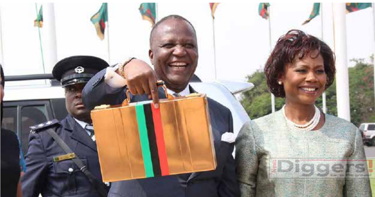
Finance minister Felix Mutati and wife arrive at Parliament to present the 2018 budget - Story P4