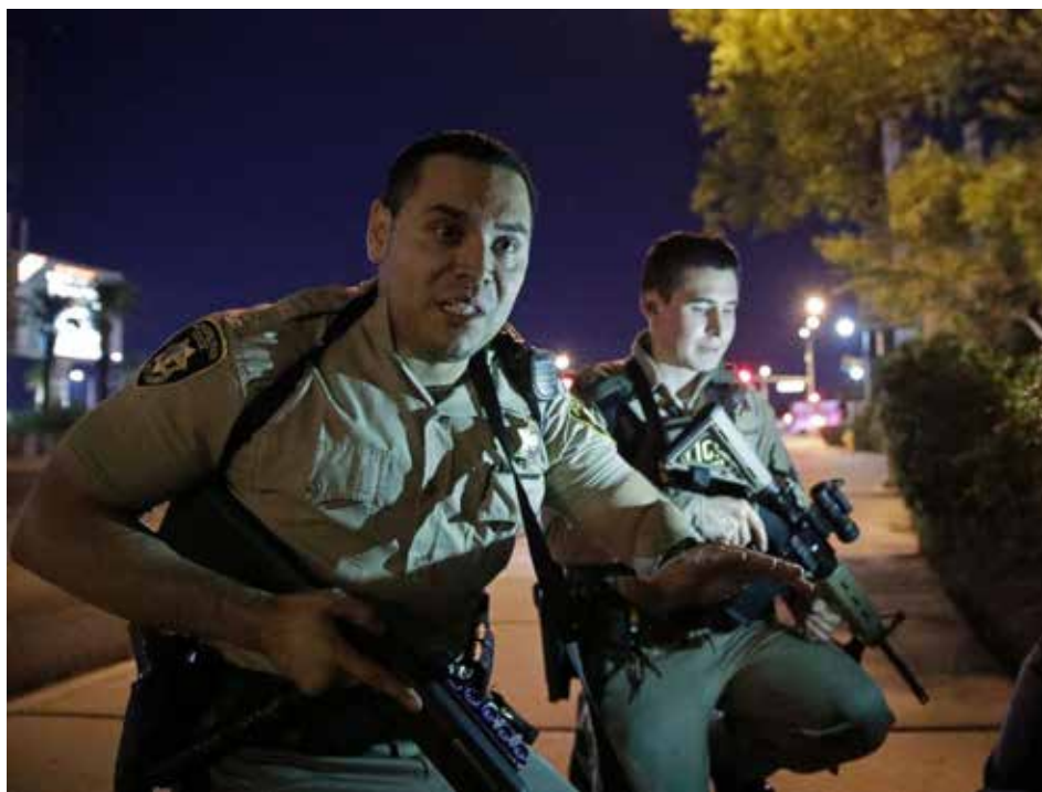
Police officers advise people to take cover near the scene of a shooting near the Mandalay Bay resort and casino on the Las Vegas Strip, Sunday, Oct. 1, 2017, in Las Vegas.

gave a window into the chaos that ensued, with some thinking that fireworks were going off. The final night of the Route 91 Harvest Music Festival was taking place across the street from Mandalay Bay. Jason Aldean was the night’s headliner; other performers included country stars Jake Owen, Big & Rich, Luke Combs and Dylan Scott. In the wake of the shooting, the Las Vegas Police Depart-