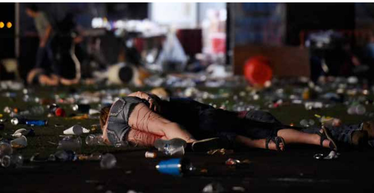
Victims lie dead after the shooting incident in Las Vegas