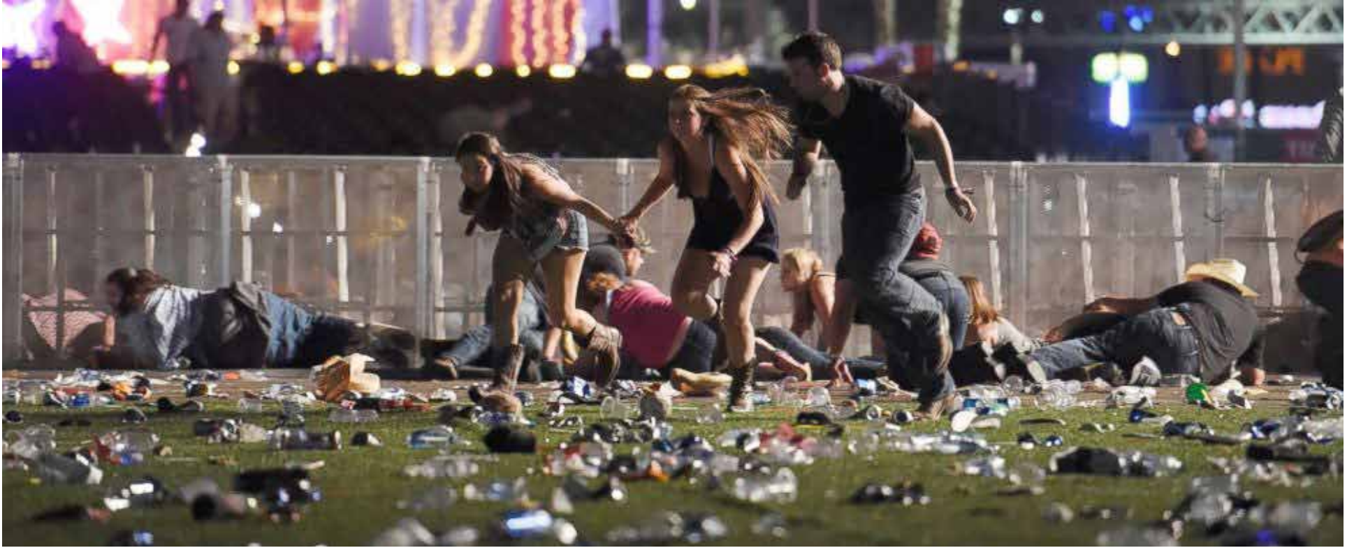
A video showed the terrifying aftermath as the injured lay on stretchers or on the ground with responders and bystanders surrounding them to give aid.

More than 58 people were killed and over 500 injured when a lone gunman opened fire from a perch high up in the Mandalay Bay Resort and Casino in Las Vegas Sunday night, police said, making it the deadliest shooting in modern U.S. history.