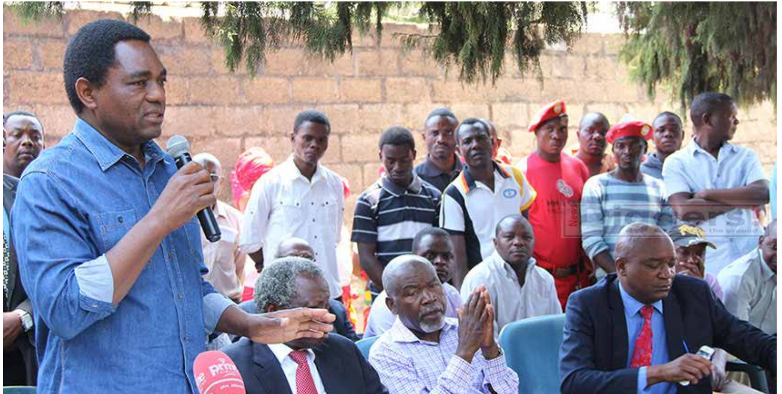
Hichilema addresses a press conference at the UPND secretariat in Lusaka today