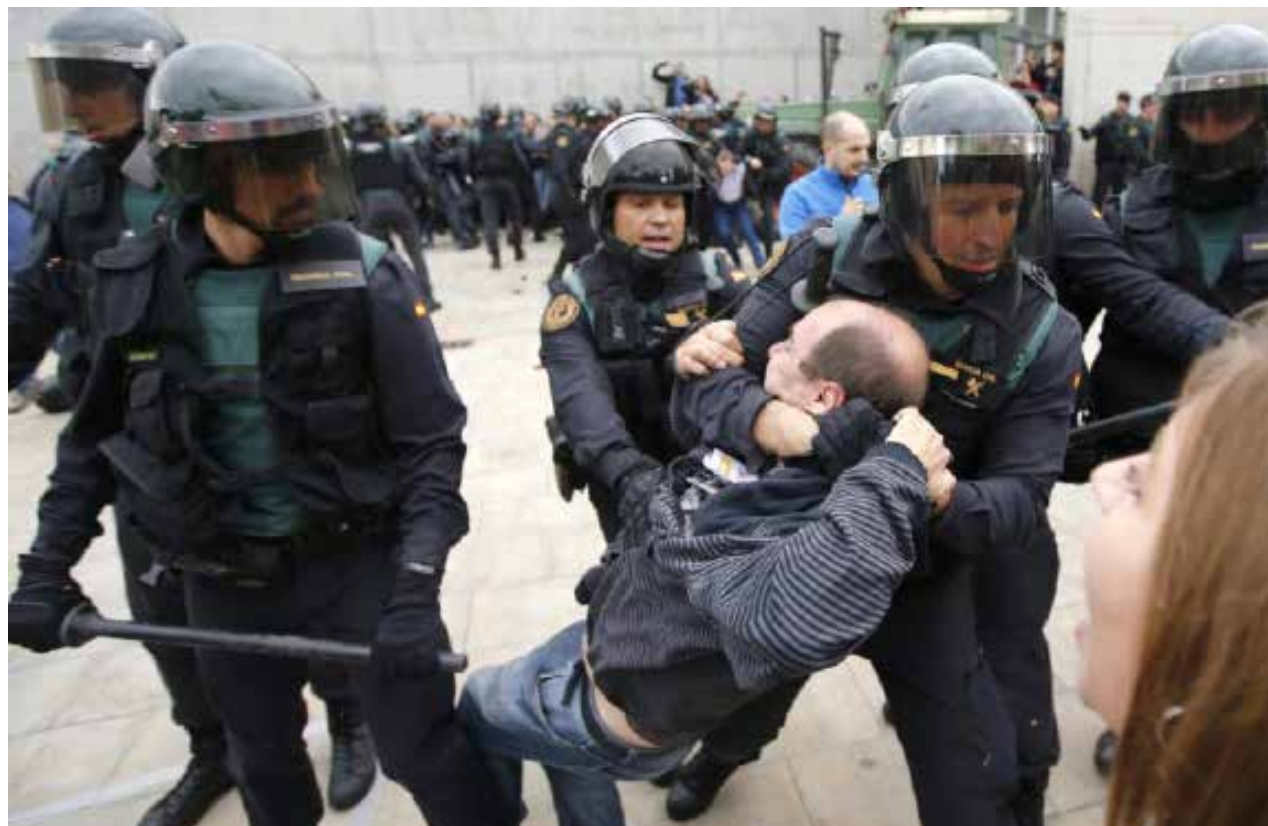
Spanish police battles Catalonia referendum voters in Barcelona

"So what we plan to do is to build ahead and have a stock of Falcon 9 and Dragon vehicles, so that customers can be comfortable if they want to use the old rocket, the old spacecraft - they can do that because we'll have a bunch in stock.