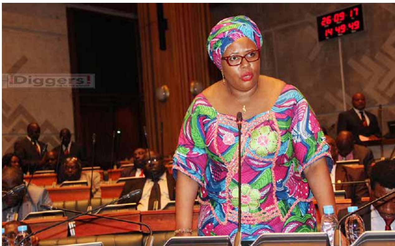
Agriculture minister Dora Siliya gives a ministerial statement on the implementation of the e-voucher system in the 2016/2017 farming season in parliament on September 26, 2017

"Yes we have not in the past the national broadcaster promoted local content because of constrained funds. The K3 was not adequate and of course it is an open secret that one of the avenues is that the TV levy is to service the wage bill. So now the upping of this the K3 to K5 will look also at other avenues. The troubles that ZNBC has had for a long time. Obviously we want the national broadcaster to improve. Also to help our local artists to produce as much of the local content. Actually for us right now, you head honorable [Felix] Mutati saying 'the only foreign content that will land without that tax is education' because you can't take education away from the people. So we as government are trying as much as possible to ensure, look we have bought this state of the art equipment, how do we obviously help our local artists? Some of them do not have the capacity but the talent is there and we don't want to start borrowing money to start feeding into our local artists. And this is the only way possible, the maintenance, the content fund and it is all in K5 and the increment is only K2."