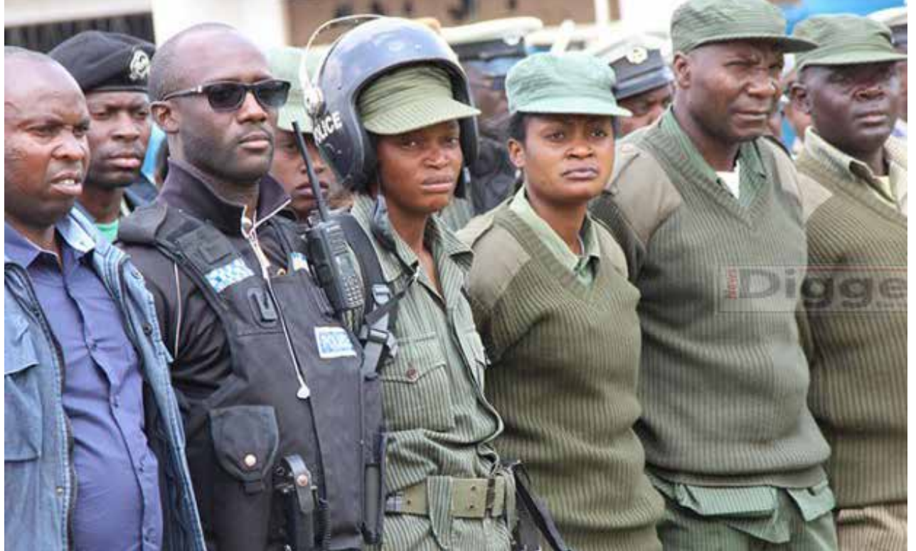
Police officers at Edwin Emboela Stadium during the screening process of suspected Chibolya drug dealers on September 29, 2017

members to actively participate in the awareness meetings.