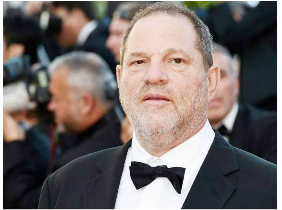
Oscar-winning producer Harvey Weinstein was sacked this weekend from The Weinstein Company following a series of sexual harassment allegations

Italian film star Asia Argento and two other women claim that disgraced Hollywood producer Harvey Weinstein raped them, in a bombshell New Yorker expose published