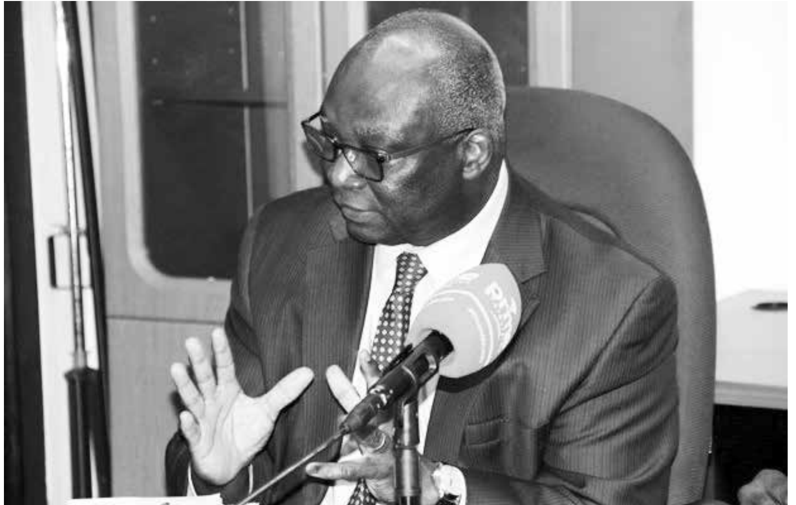
IMF leader of delegation Tsidi Tsikata during a press briefing in Lusaka

strengthen human capital and support financial inclusion for small and medium scale enterprises. Domestic risks to the outlook include delayed fiscal adjustment which would continue to crowd out credit to private sector and entrench an unsustainable debt situation, and unfavorable weather conditions which would affect hydro power generation and agricultural output. External risks include tighter global financial conditions and volatility in the world copper price.