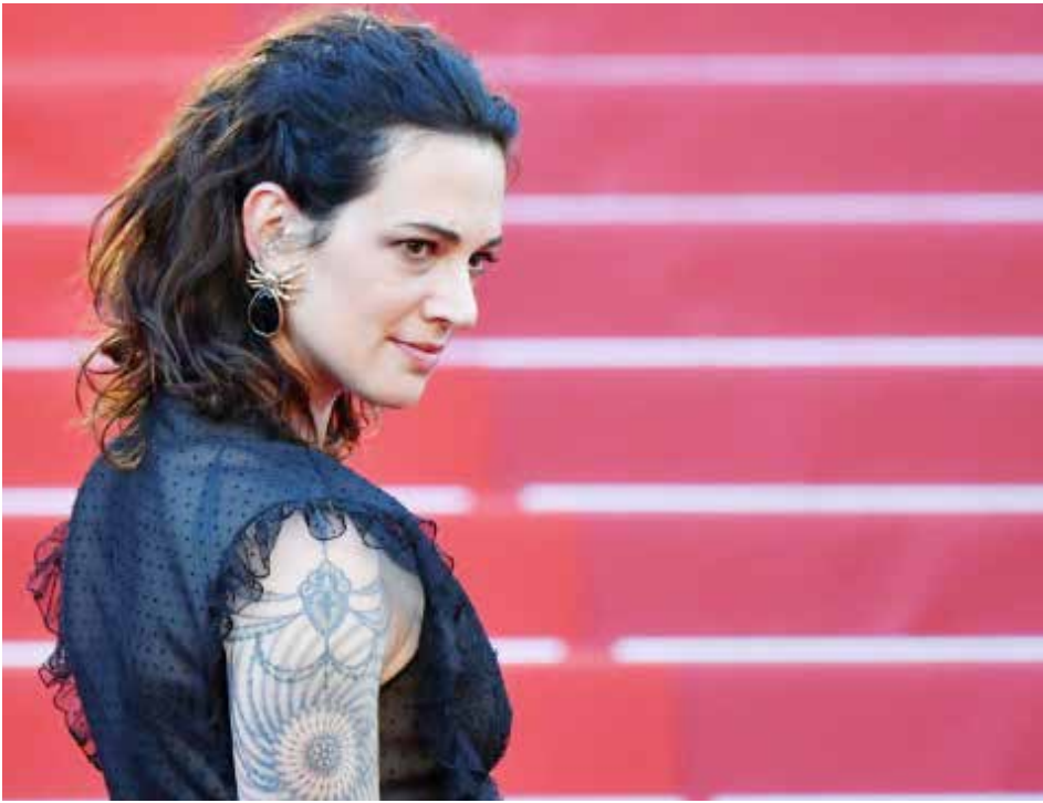
Italian actress Asia Argento Argento, seen here in Cannes earlier this year, said that Harvey Weinstein forced oral sex on her 20 years ago