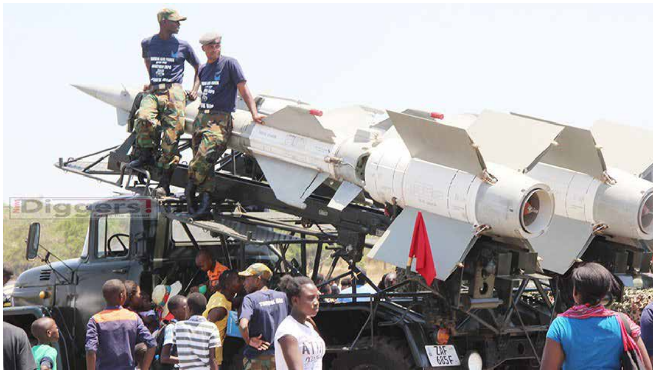
A military vehicle displayed during ZAF Open Day at City Airport in Lusaka on October 14, 2017