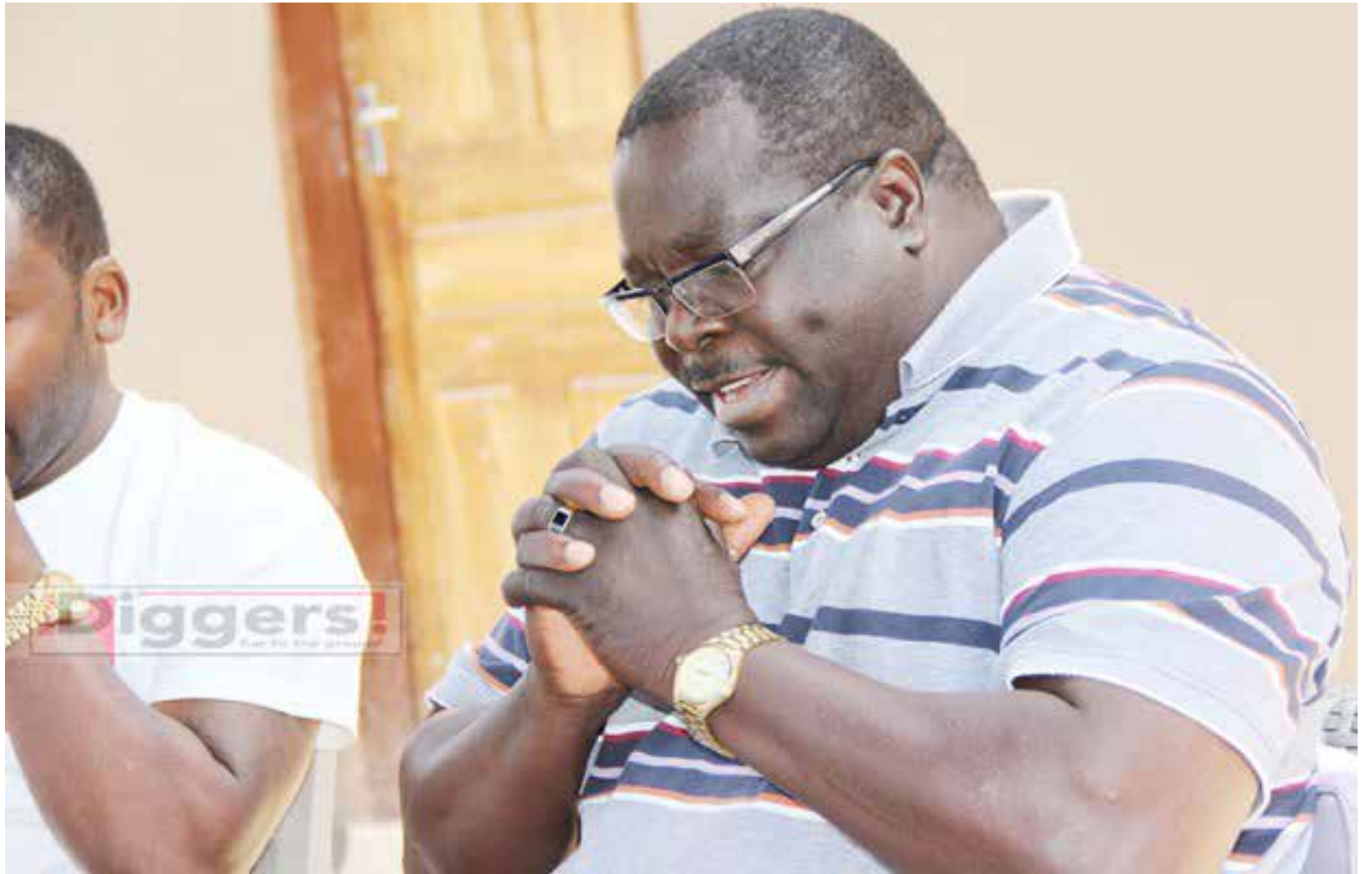
Former Information minister Chishimba Kambwili speaks to journalists at his house in Lusaka September 4, 2017

"My expectation is that people will go to the national prayer day genuinely, and I am using the word 'genuinely', to pray for national building, reconciliation and fostering development by putting the poor people