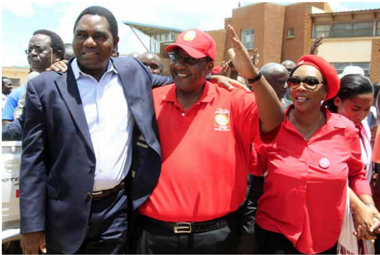
File picture: HH and GBM outside the Lusaka Magistrates' Court earlier this year