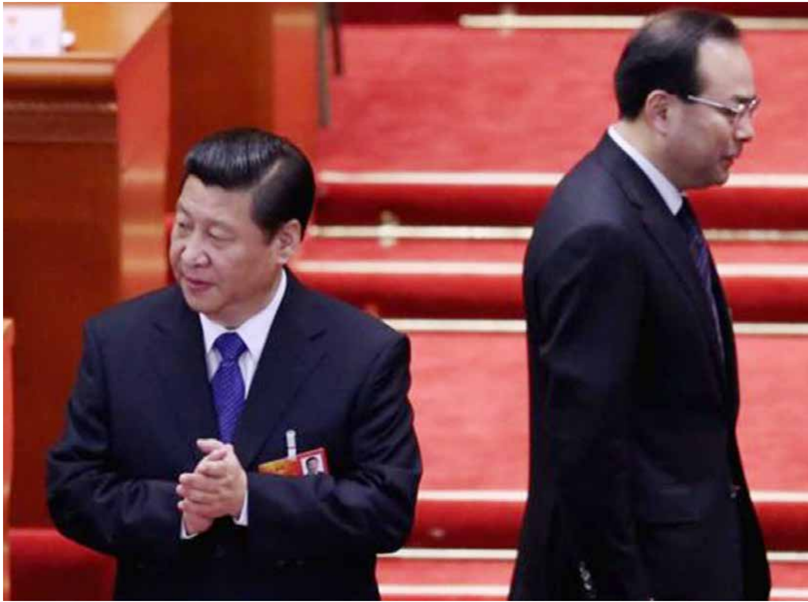
Former top politician Sun Zhengcai (right) was among several named as having plotted against Xi Jinping (left)

The party is widely expected to rewrite its constitution to enshrine this theory before congress ends next week.