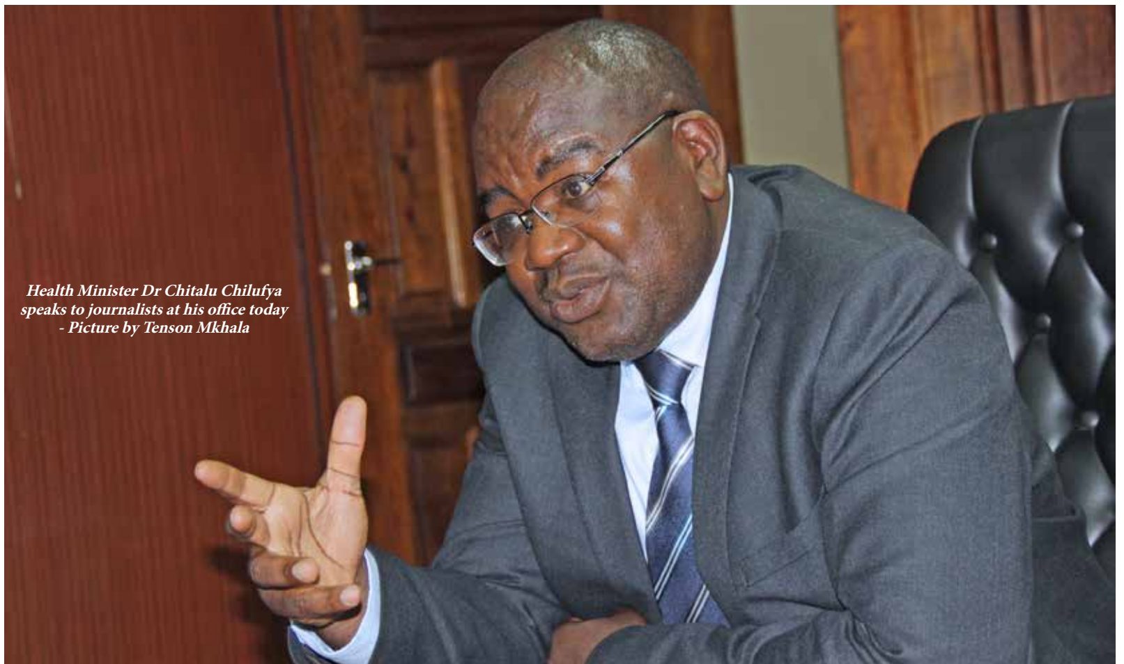
Health Minister Dr Chitalu Chilufya speaks to journalists at his office today