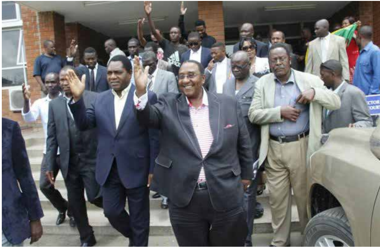
UPND Leader Hakainde Hichilema with his vice Geoffrey Bwalya Mwamba at the Lusaka High Court

that period. These were 20th, 21st, 27th of August, 2016 thus the 14 days period was reduced by four days... the court must have settled for the first scenario where all excluded days were counted. The court did not however, sit on weekends - Saturdays and Sundays thus denying the parties four days from the time stipulated for the petition, as already observed above."