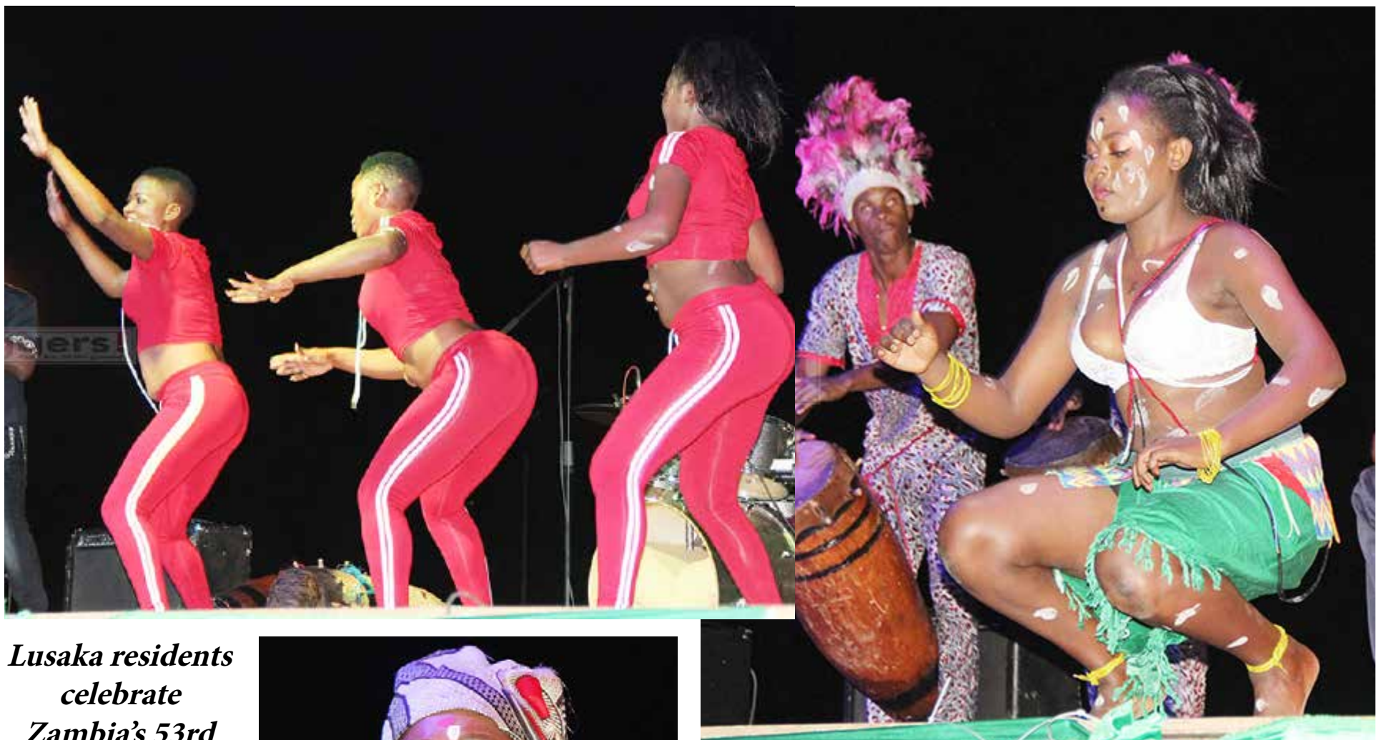
Lusaka residents celebrate Zambia's 53rd Independence at the Lusaka Showgrounds. The Zambia Army performed drills and a fire works display at the event which was graced by vice-president Inonge Wina