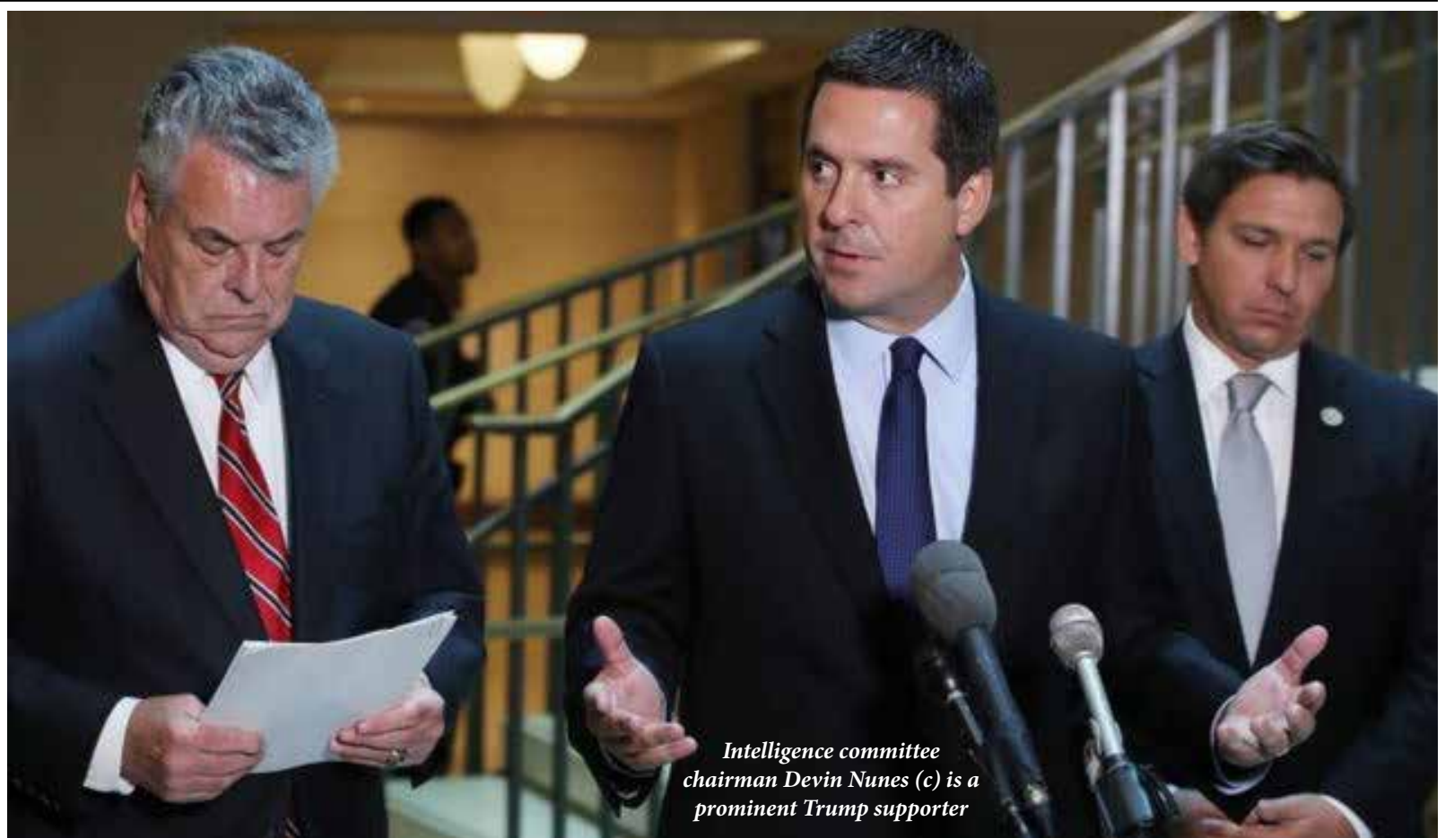
Intelligence committee chairman Devin Nunes (c) is a prominent Trump supporter

He has spearheaded a sweeping anti-corruption campaign which has seen more than a million officials disciplined. It has been seen by some as a massive internal purge of opponents. BBC News