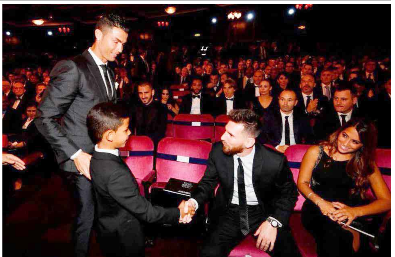
Cristiano Ronaldo takes his son to meet arcviral Messi at the 2017 FIFA Best award ceremony held in London. Ronaldo scooped the top award for the men's category ahead of Messi and Neymar who came second and third respectively

"He is ready to play, to enter the 11. I'm happy with his work. Friday may be a good opportunity for him. I'm sure he's ready." Yahoo