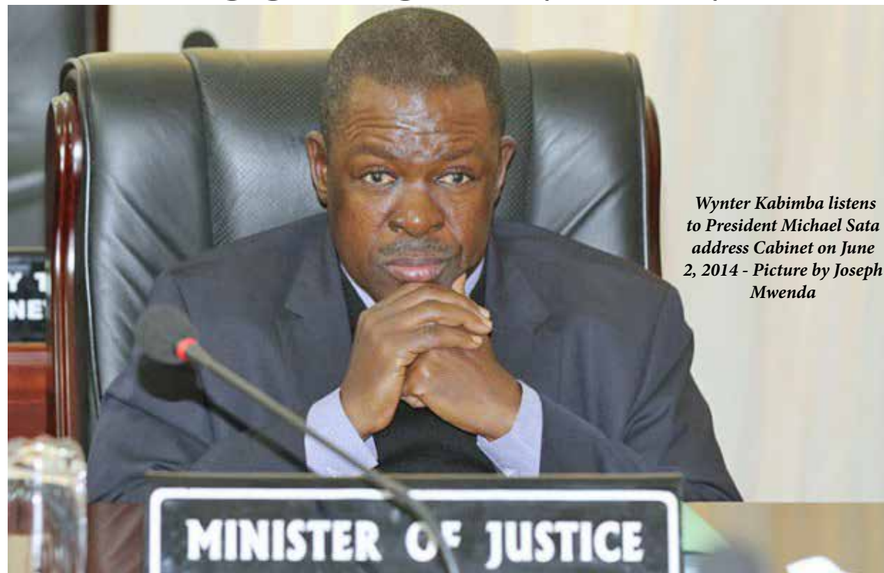
Wynter Kabimba listens to President Michael Sata address Cabinet on June 2, 2014

"Everything going on in this country just tells you that this is a government of selfish leaders, we know for example that even when this ban was