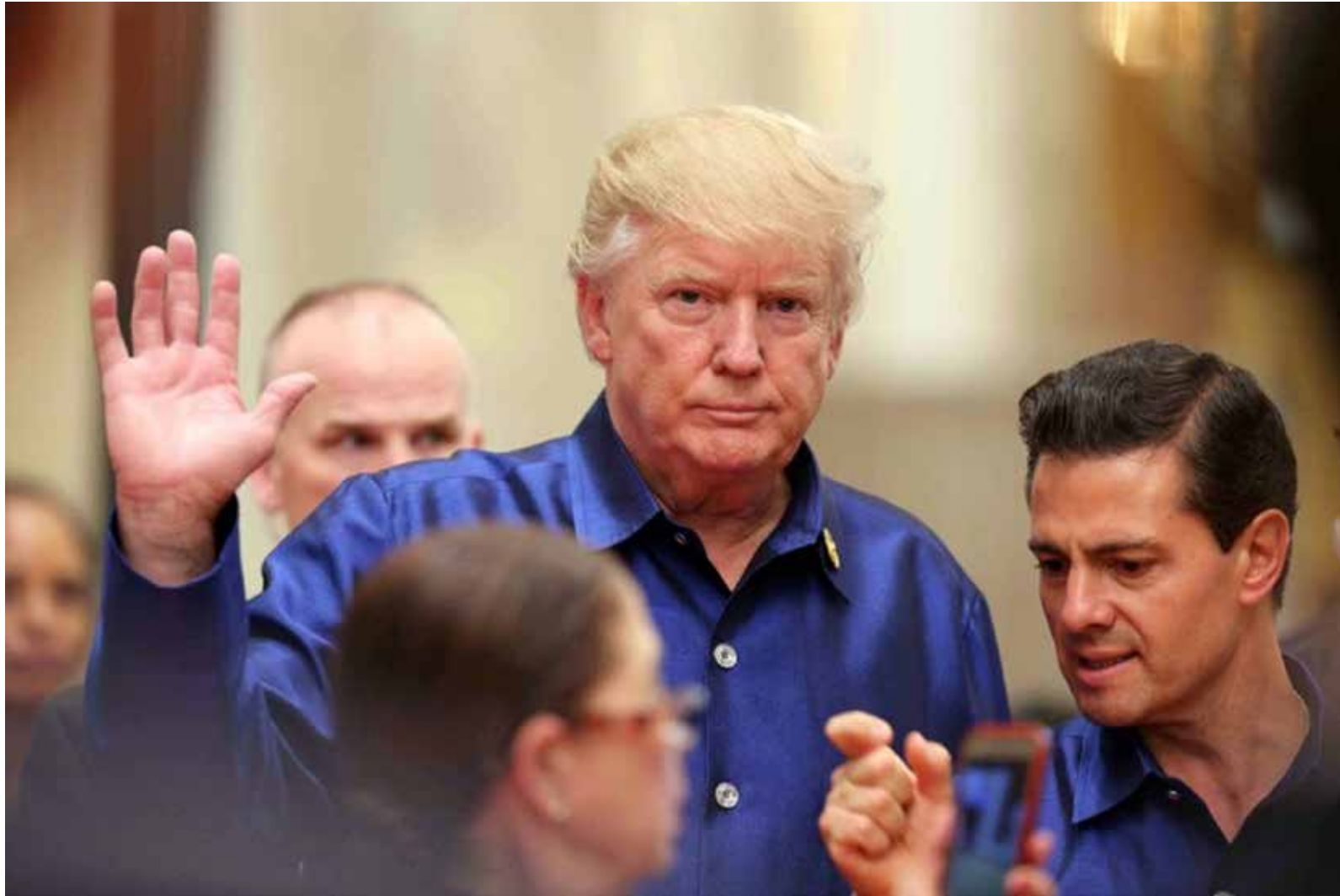
US President Donald Trump (C) waves next to Mexico's President Enrique Pena Nieto (R) ahead of the Asia-Pacific Economic Cooperation (APEC) Summit leaders gala dinner in the central Vietnamese city of Danang

Mr Trump will travel to Manila later on Sunday for the final stop on his Asia tour, before flying back to the US. BBC