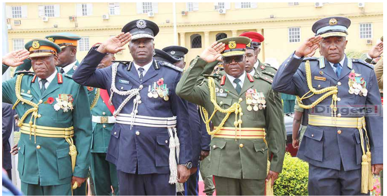
Top right: War veterans move to lay wreaths at the Cenotaph as defence chiefs (r) salute. Below, President Lungu pays his respects to the fallen heroes, as Vice-President Inonge Wina, Speaker Patrick Matibini, his deputy Catherine Namugala, Chief Justice Irene Mambilima join in the commemorations