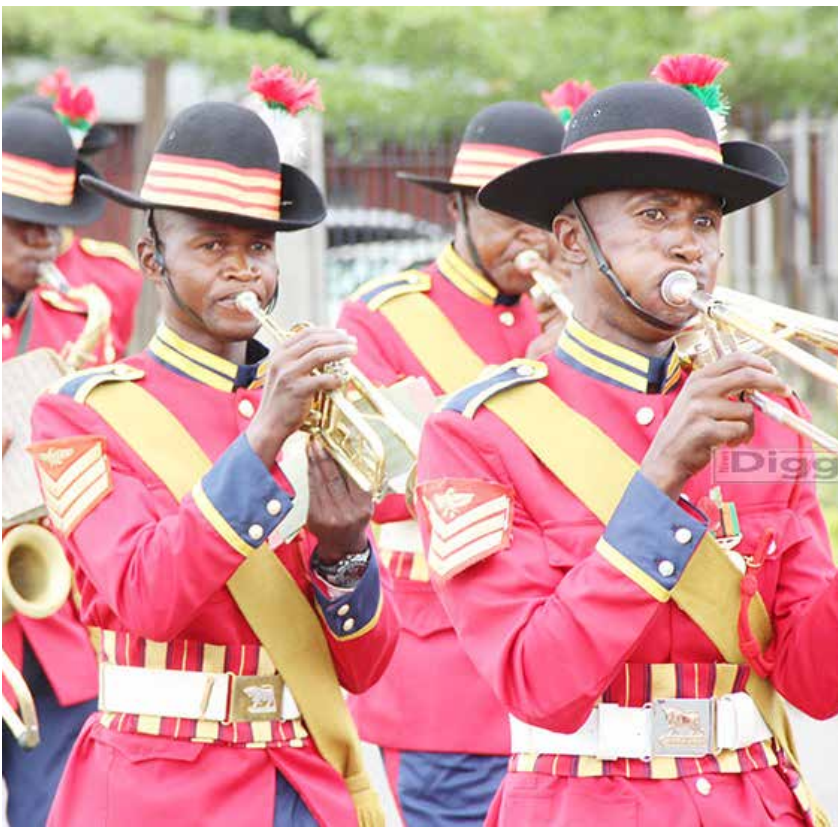
Top right: War veteran at the remembrance day parade at the National Cenotaph in Lusaka yesterday. Below Zambia army band entertains attendees at the event