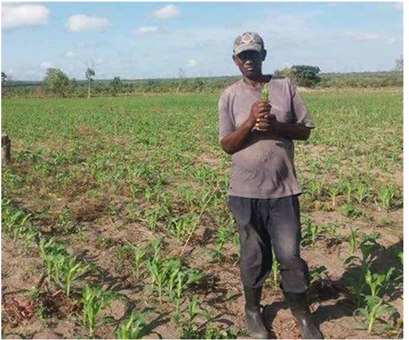
Army worms are back: a farmer displays the damage to maize crops