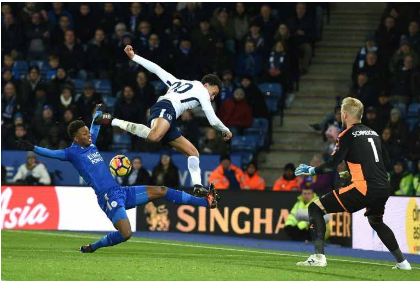
Leicester City's Demarai Gray (L) vies with Tottenham Hotspur's Dele Alli during a Premier League match in Leicester, central England

"We have forest and it is more comfortable for us to win," Chilufya said.