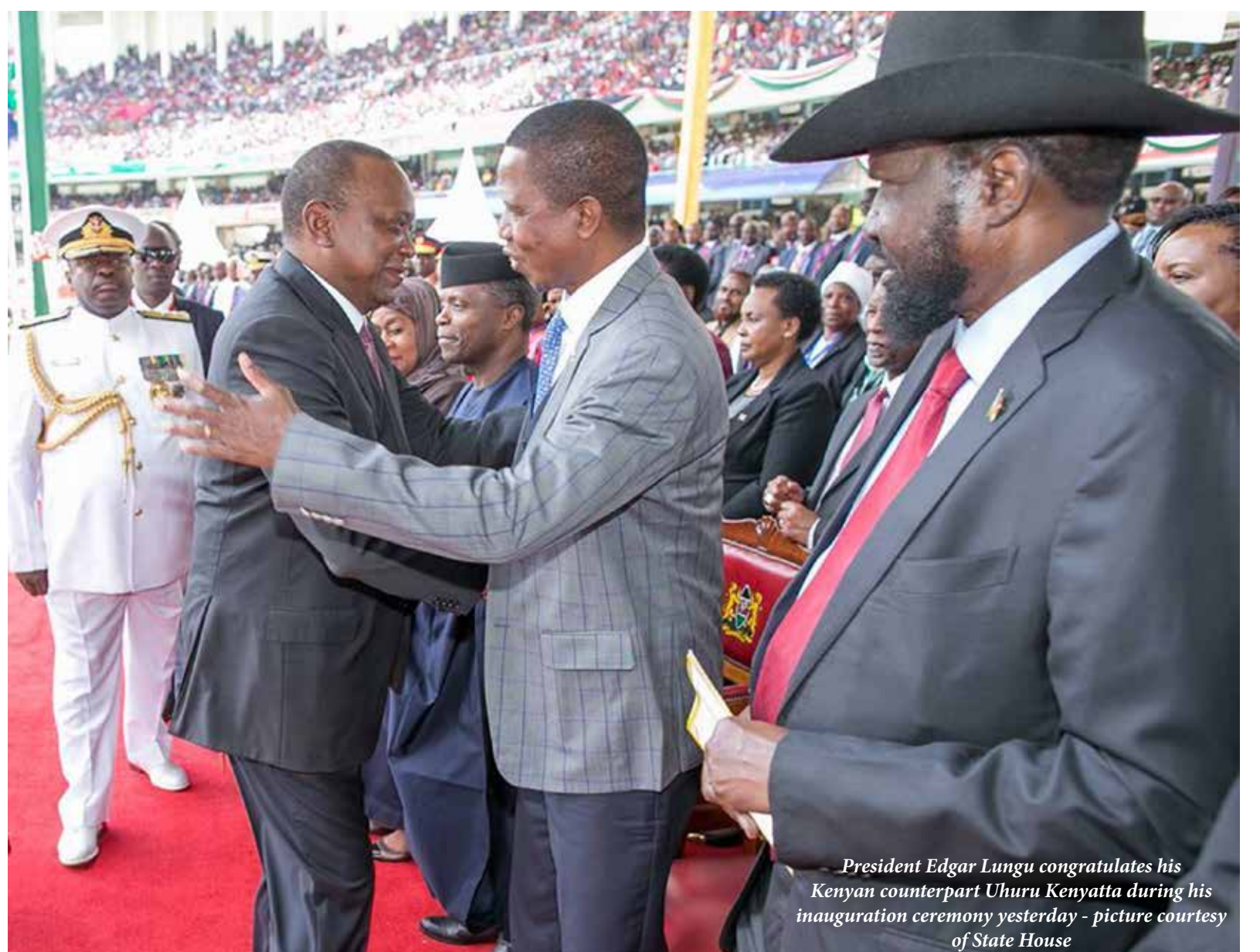
President Edgar Lungu congratulates his Kenyan counterpart Uhuru Kenyatta during his inauguration ceremony yesterday

We have heard you, please switch off your microphone and I would want to start spending time with your officer so that you understand some of these things.