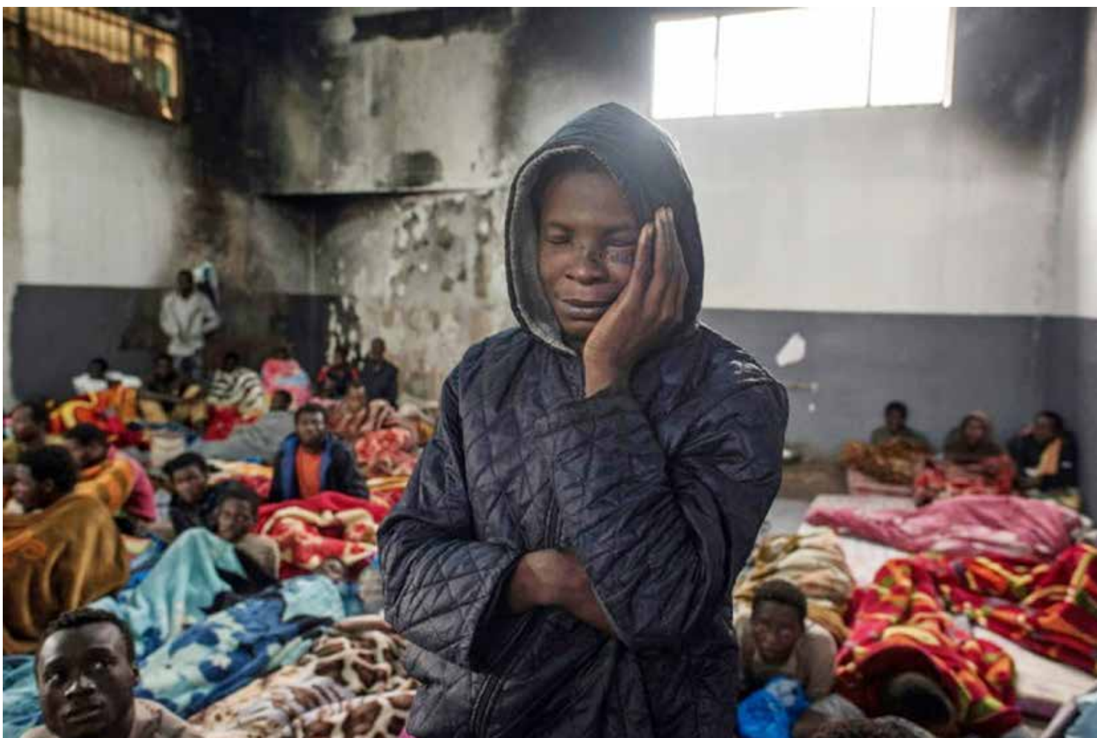
A migrant stands in a packed room at the Tariq Al-Matar detention centre on the outskirts of Tripoli, Libya