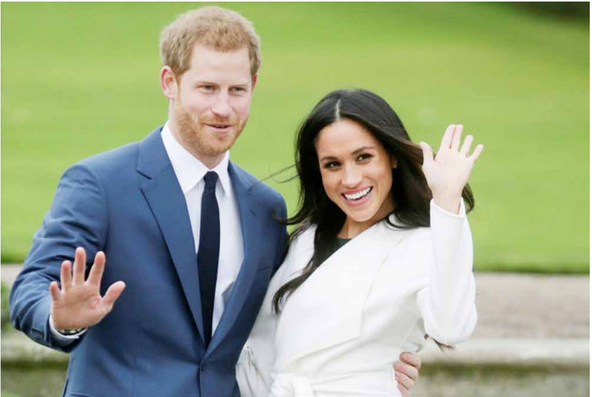
Britain's Prince Harry and his fiancée US actress Meghan Markle pose for photographs in the Sunken Garden at Kensington Palace in London following the announcement of their engagement