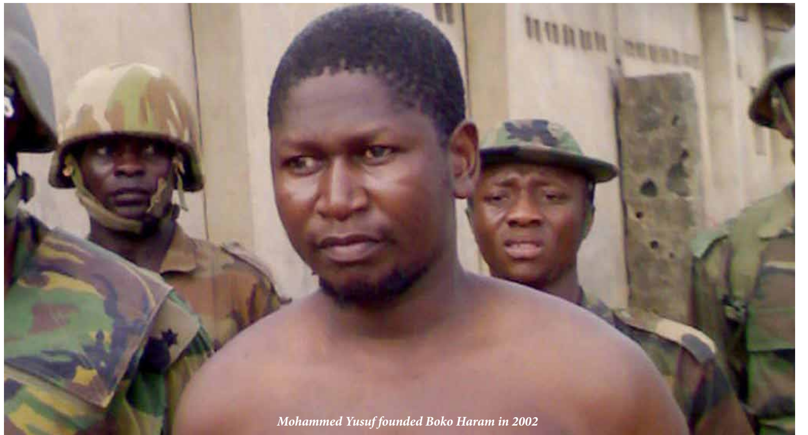
Mohammed Yusuf founded Boko Haram in 2002

The home of the founder of Nigeria's Islamist militant group Boko Haram is to be turned into a museum, in the