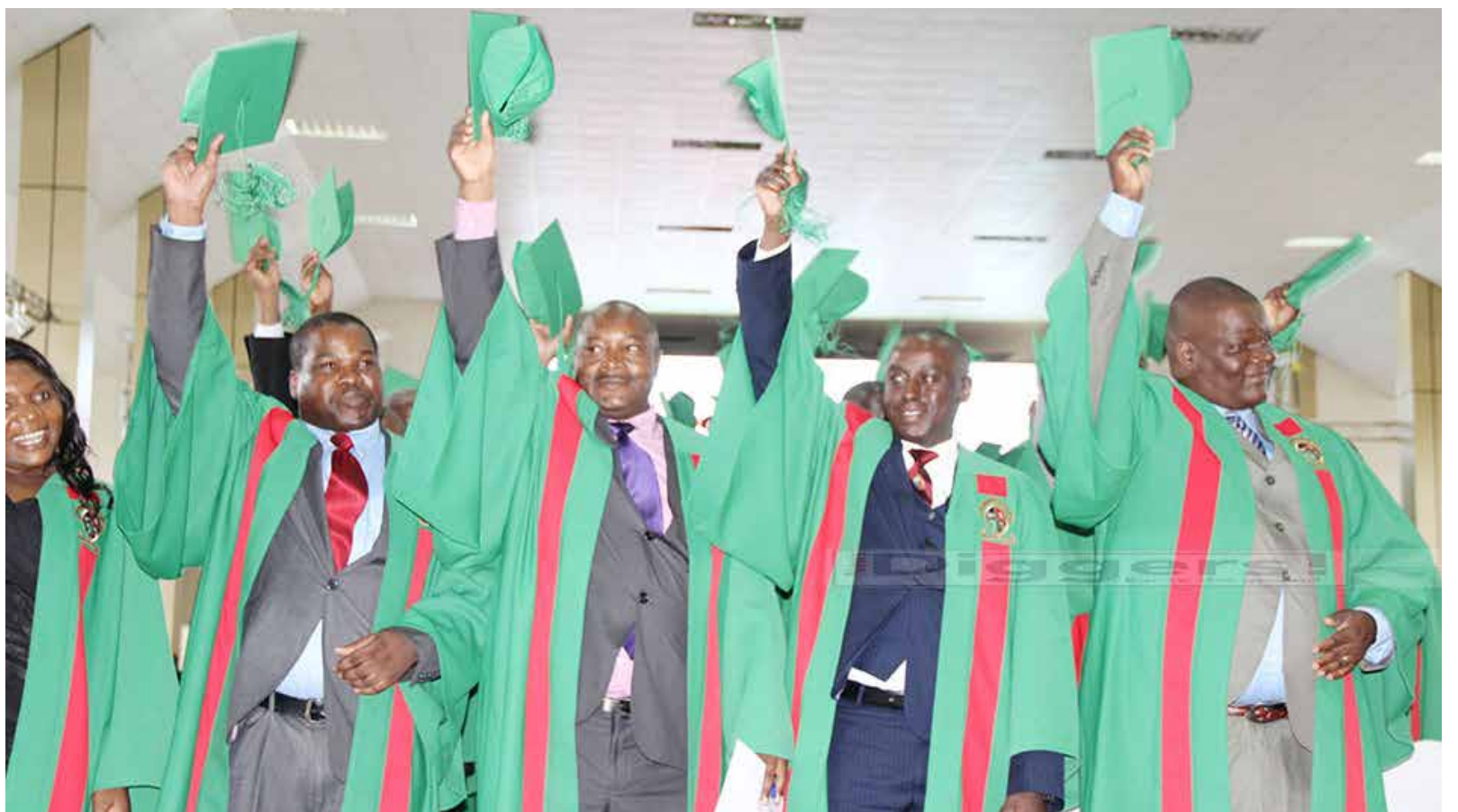
Diploma in defence and security studies students during their graduation ceremony held at Zambia National Service (ZNS) officer's mess in Lusaka's Chamba Valley on November 29, 2017

"We wait to hear from you within seven days from the date of this letter of we will launch a requisite court action in the High Court of Zambia against the unreasonable deportation of our client."