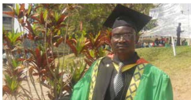
Students doing RESEARCH PROJECTS DIPLOMA/ DEGREE/MASTERS/PhD