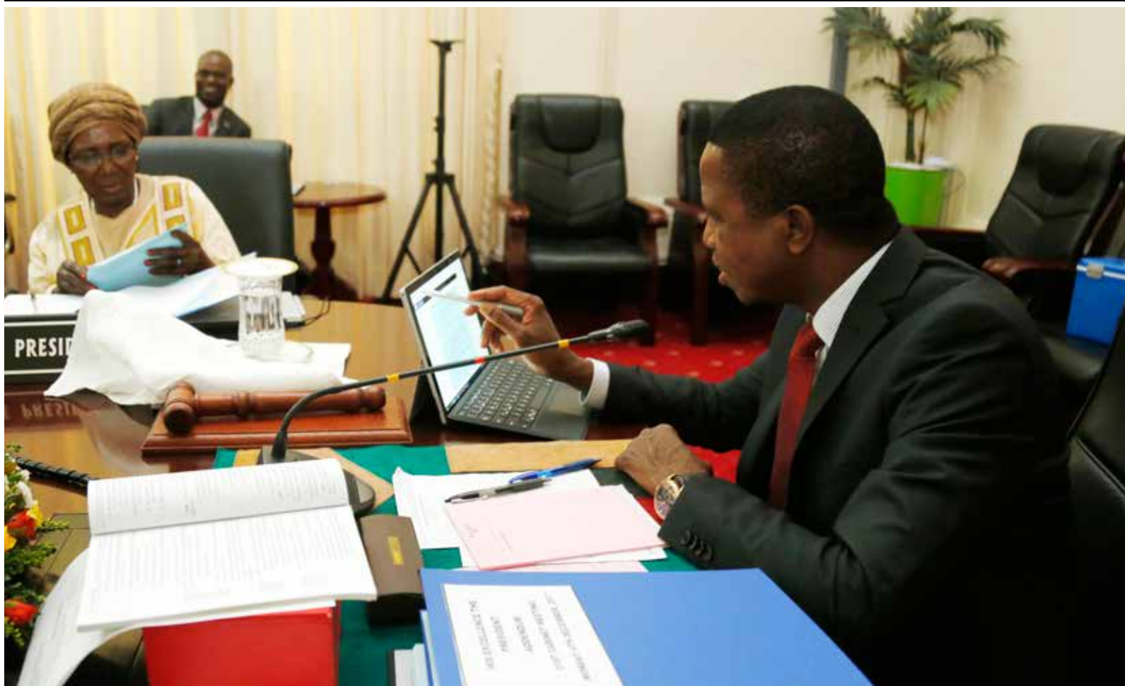
President Edgar Lungu uses his laptop during the 21st Cabinet Meeting at State House in Lusaka today

"The total contribution of agriculture to Zambia's Gross Domestic Product (GDP) averaged 9.8 per cent in the period 2006 to 2015. The government's partnership with UNDP in this regard is helping the country follow a climate-resilient development path, consistent with our poverty reduction and sustainable development objectives. My Ministry will endeavor to provide sector and location tailored weather and climate products and services and updates to aid in agriculture activities for a good harvest," said Mushimba.