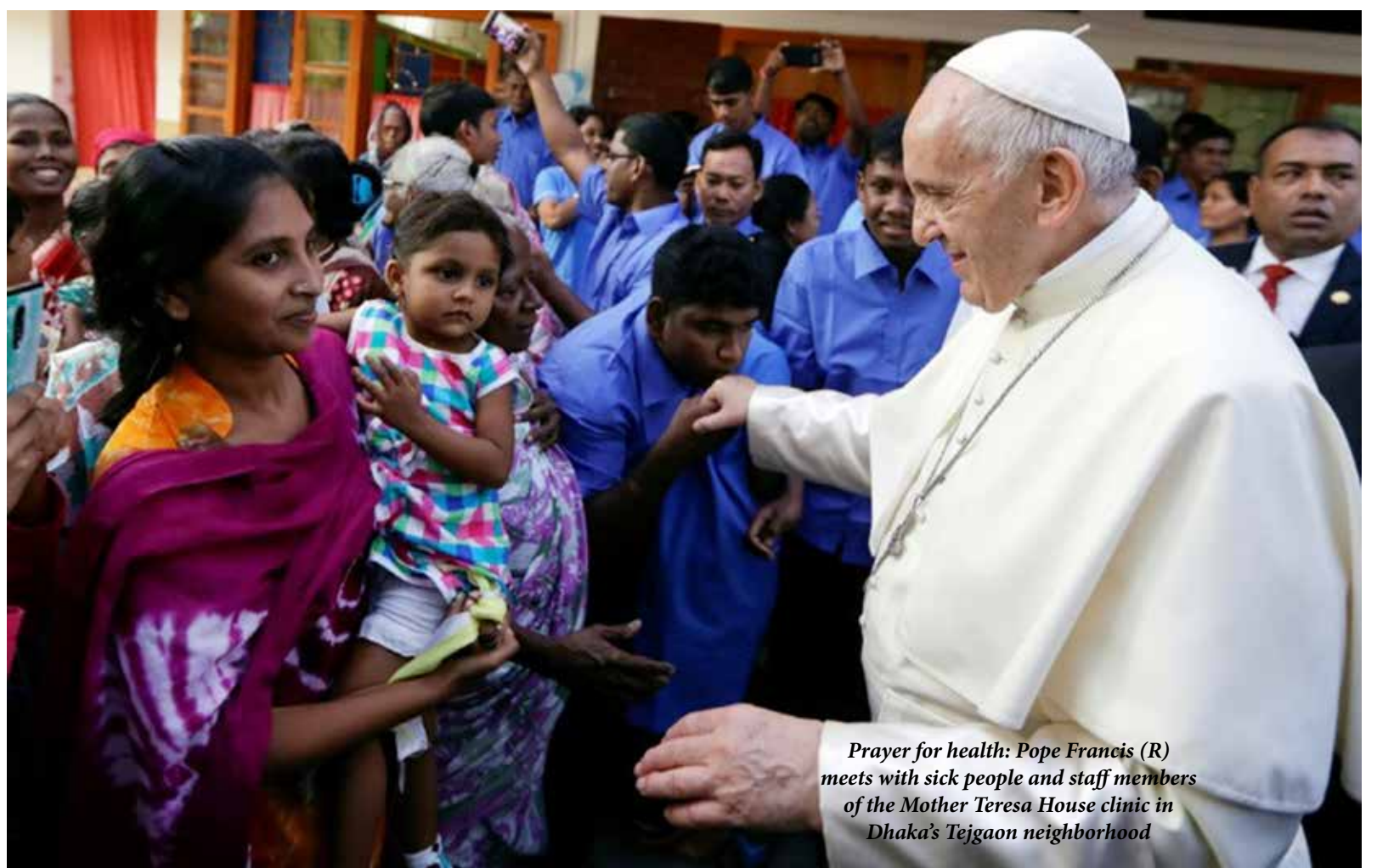
Prayer for health: Pope Francis (R) meets with sick people and staff members of the Mother Teresa House clinic in Dhaka's Tejgaon neighborhood

studio brawl with a cleric, after the cleric suggested women should not necessarily have to wear a headscarf. BBC