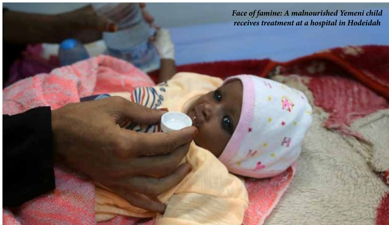
Face of famine: A malnourished Yemeni child receives treatment at a hospital in Hodeidah

This was the second instance in recent months where a private hospital in India has been called out for negligent care. Last month, a girl died of dengue fever in another hospital and the parents allege they were overcharged for her treatment. BBC