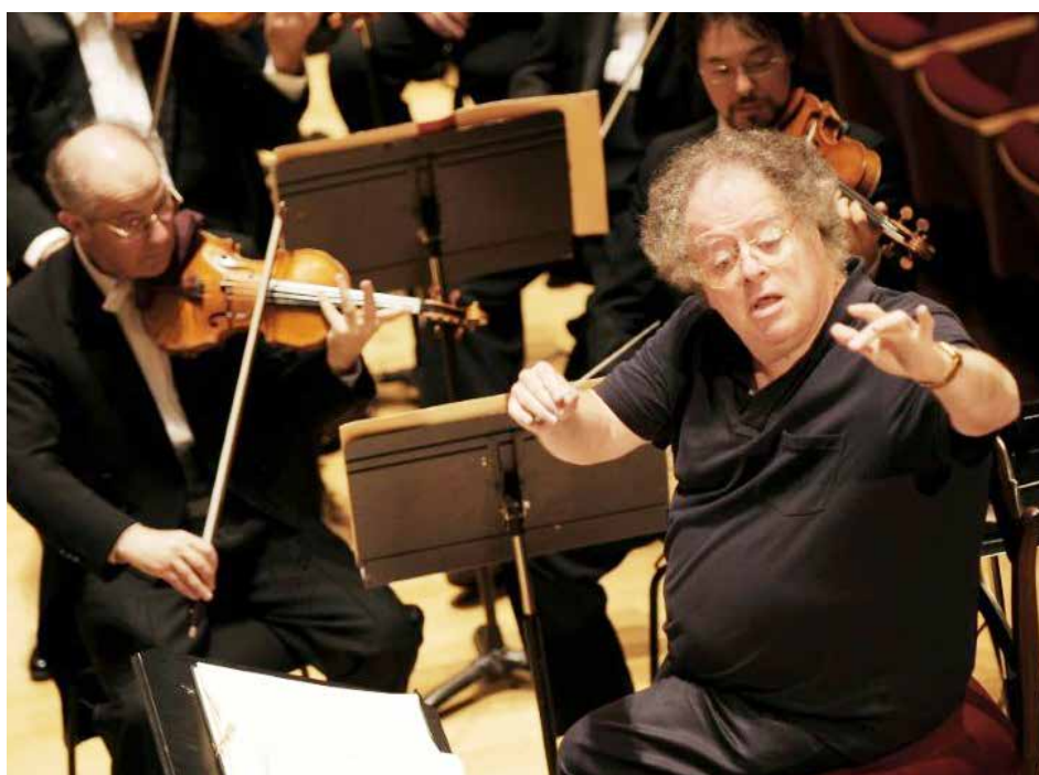
American conductor James Levine and the Boston Symphony Orchestra perform Hector Berlioz's "Damnation of Faust" in September 2007 during a rehearsal in Paris

He was music director at the Met for 40 years before retiring at the end of the 2015-16 season for health reasons -- he has Parkinson's disease -- but has stayed on as music director emeritus.