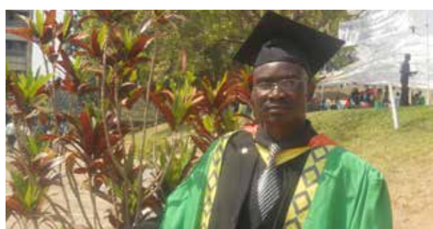
Students doing RESEARCH PROJECTS DIPLOMA/ DEGREE/MASTERS/PhD Contact (+260978918920/mwalenelson@yahoo.com) For EXCELLENT ACADEMIC SERVICES

At the same event, the agency received a contribution of K100 000 and six breathalysers worth about 60,000 Rands from the Zambia Breweries company for the purposes of drink driving testing.