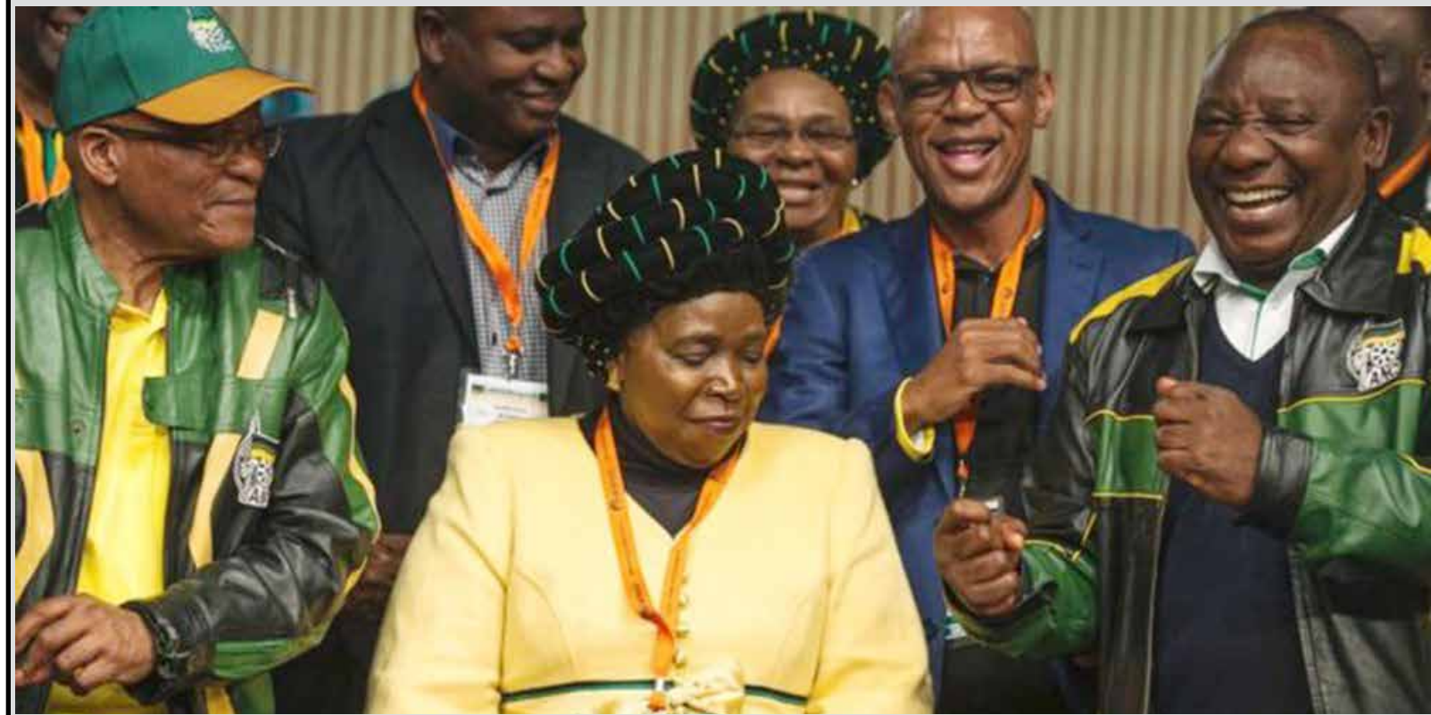
Jacob Zuma (L) will be replaced as ANC leader by either Nkosazana Dlamini-Zuma (C) or Cyril Ramaphosa (R) this month