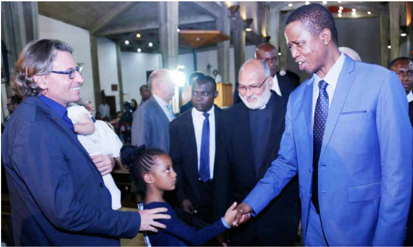
President Lungu greets a child during the Cheshire Homes Kabulonga Concert at the Anglican Cathedral of the Holy Cross in Lusaka on Friday December 1, 2017