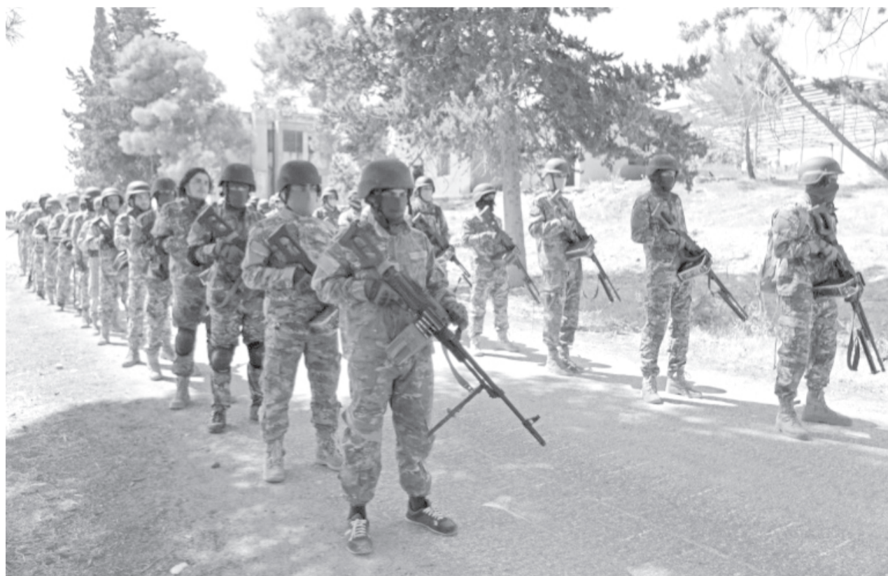
Syrian rebel fighters prepare for an upcoming government forces offensive, in the countryside of the rebel-held northern Idlib province

US President Donald Trump on Monday warned Syria against launching an attack on the country's last rebel stronghold with the help of Russia and Iran, saying the offensive could trigger a "human tragedy."