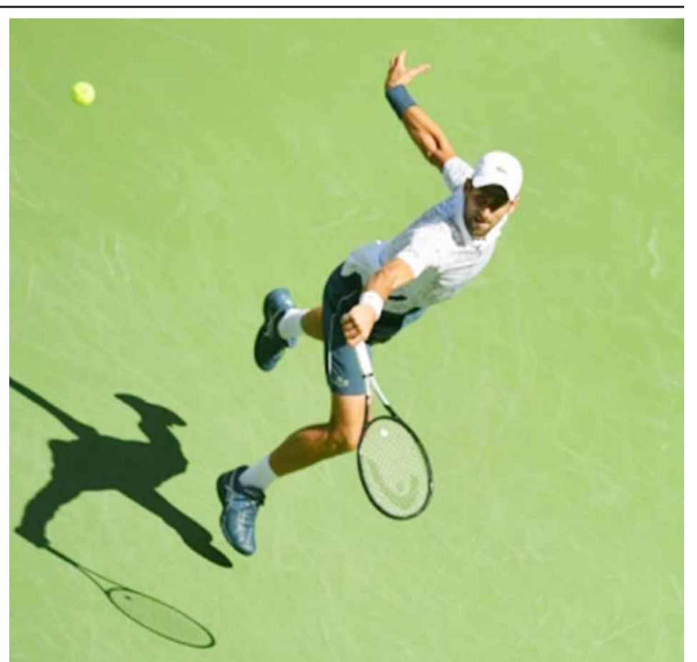
Novak Djokovic of Serbia hits a return to Joao Sousa of Portugal during their 2018 US Open men's round 4 match in New York.