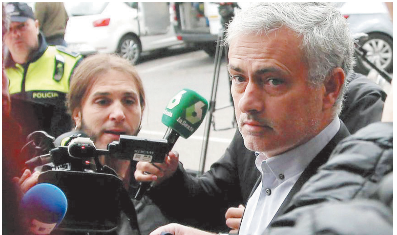
Manchester United manager Jose Mourinho arrives at court to testify on tax fraud charges in Pozuelo de Alarcon, near Madrid, Spain, November 3, 2017.

He finished with 77 unforced errors and 10 double faults.