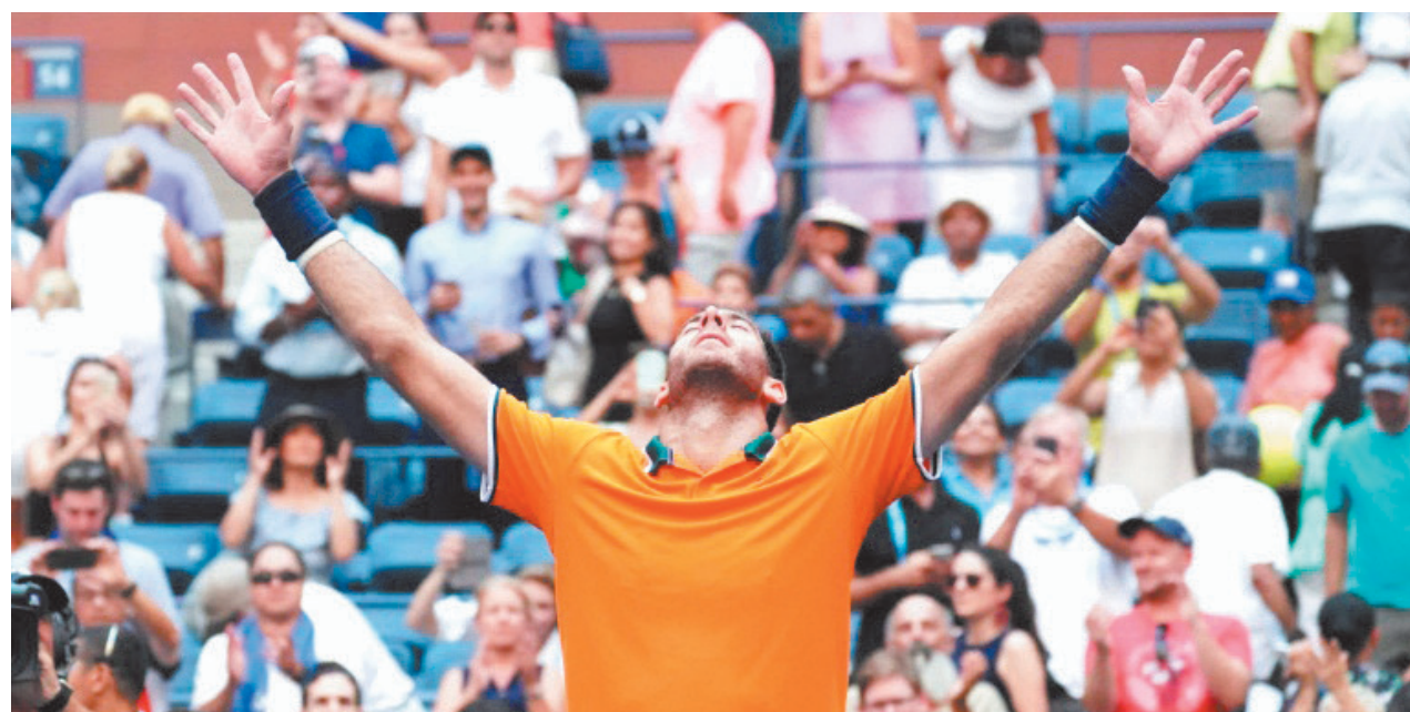
Things are looking up as Juan Martin del Potro beats John Isner.

Pogba always welcome at Barca - Luis Suarez