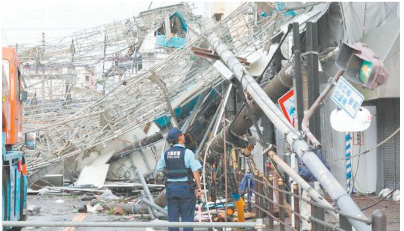
Evacuation advisories had been issued for over 1.2 million people, but it was not clear how many had heeded the warnings

Temperatures have hovered around 30 degrees Celsius (86 Fahrenheit).