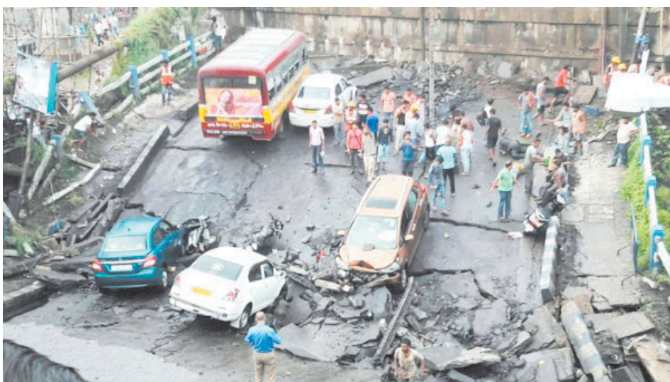
The nearly 50-year-old bridge that collapsed in Kolkata, India last Tuesday killing one person and injuring 24. AFP

homes as Jebi approached the Kansai area -- Japan's industrial heartland -- although it was unclear how many had heeded the warnings. Around 16,000 people spent the night in shelters, local media said. AFP