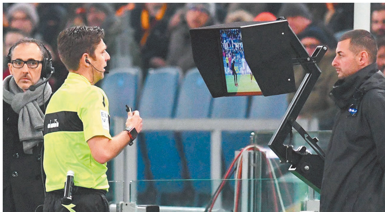
Premier League to trial VAR this season