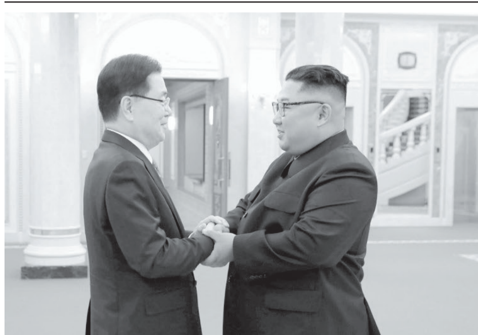
Kim Jong Un will host South Korean President Moon Jae-in for a summit in Pyongyang in September

President Kenyatta was in Beijing earlier this week to take part in the China-Africa cooperation summit where he said: "Kenya appreciates China's demonstrated commitment in supporting Kenya's development goals." BBC