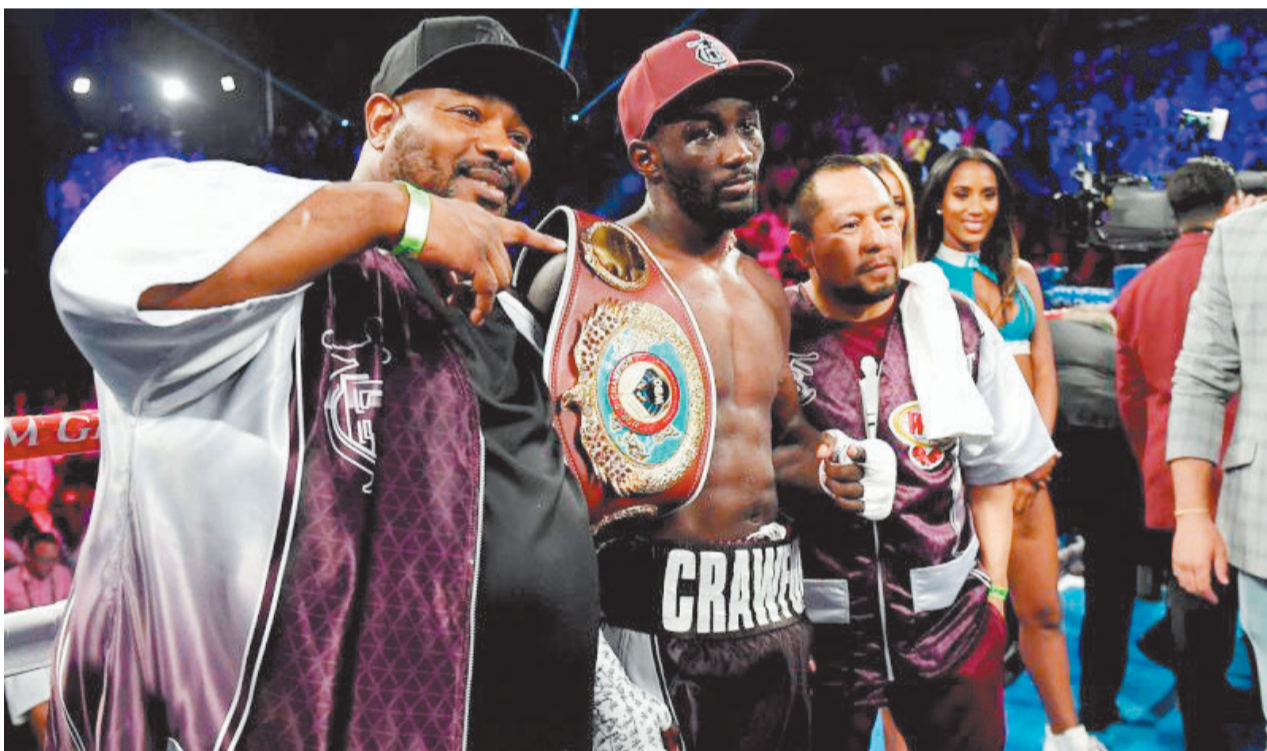
Terence Crawford, posing with his WBO welterweight belt after stopping Jeff Horn in June in Las Vegas, has signed a multi-year contract extension with Top Rank.