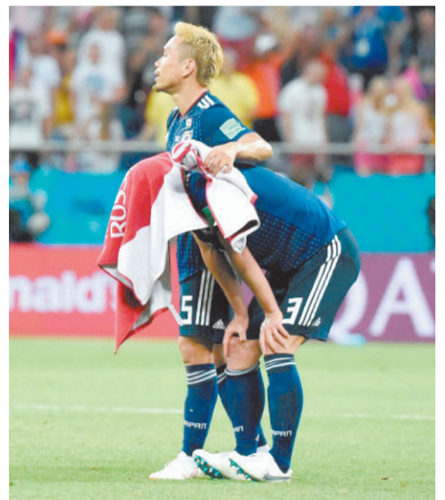
Japan were due to play their first match since a heart-breaking World Cup last 16 defeat to Belgium in a match they had led 2-0.