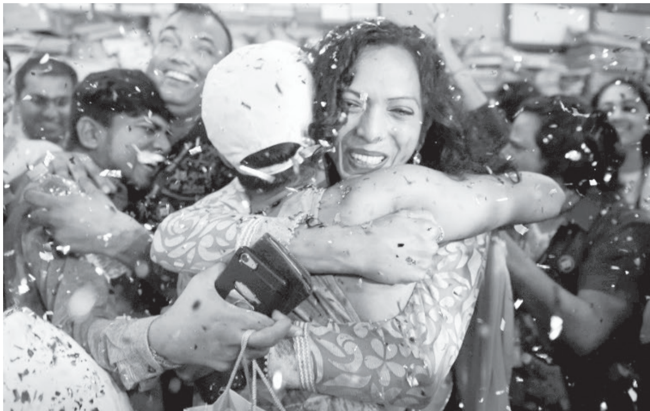
Gay activists have hailed the verdict as a major boost in the deeply conservative country

Activists had been fighting the ban since the 1990s,