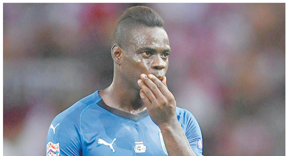
Balotelli dropped from Italy squad. goal.com Balotelli dropped for Italy's Nations League game in Portugal.