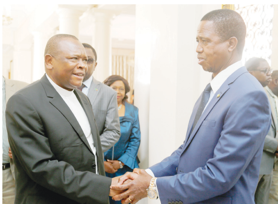
President Edgar Lungu(right) talks to Arch Bishop Fridolin Ambongo Besungu Head of Delegation of Catholic Bishops from Congo at State House yesterday

Authorised for display and publication by: The Head - Public Relations For/Director and Chief Executive Officer Road Transport and Safety Agency 7th Floor, Premium House LUSAKA