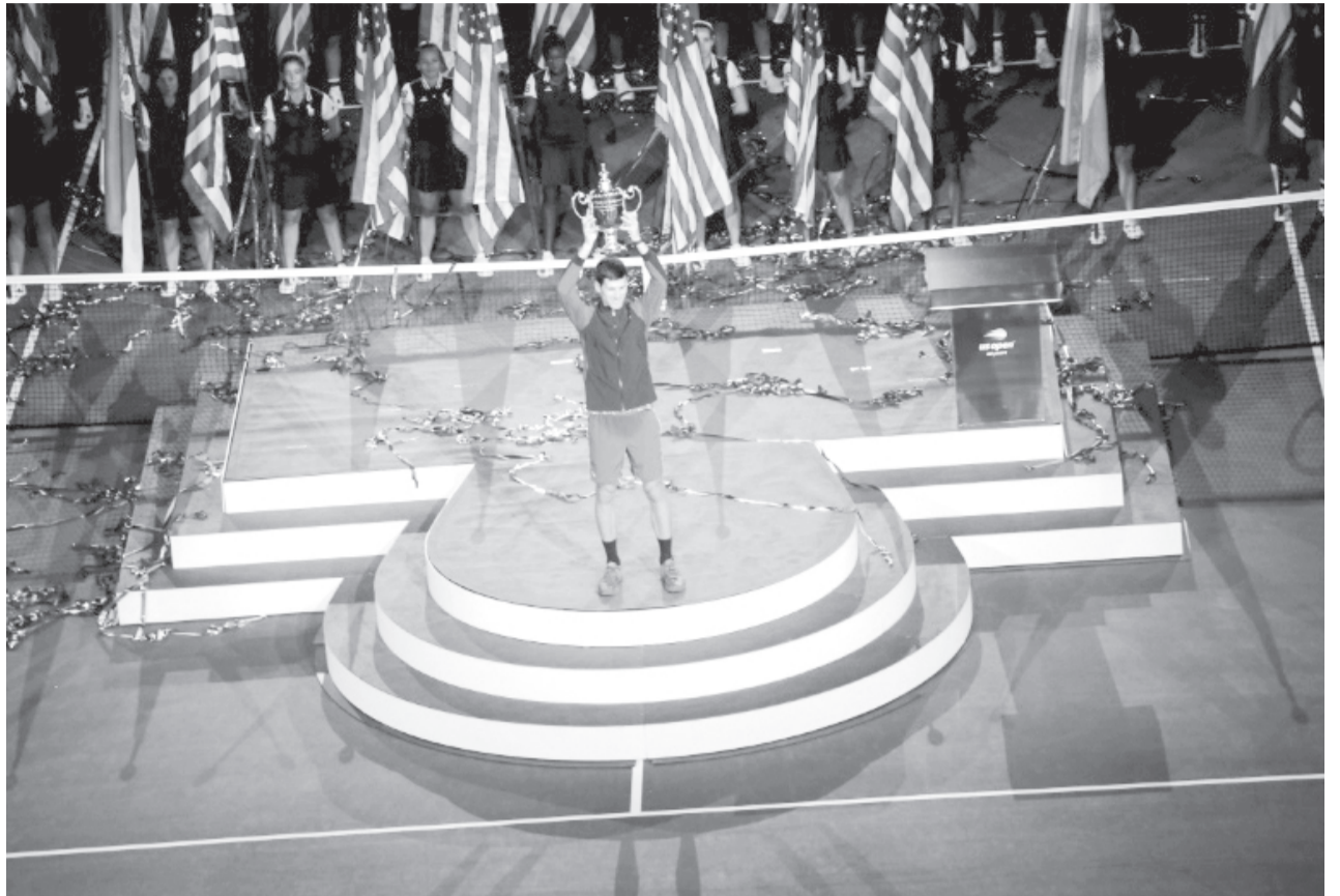
Novak Djokovic hoists the US Open trophy for a third time after beating Juan Martin del Potro in the final.

"I was so happy to be playing the final against this magnificent idol," added Del Potro of his close friend Djokovic.