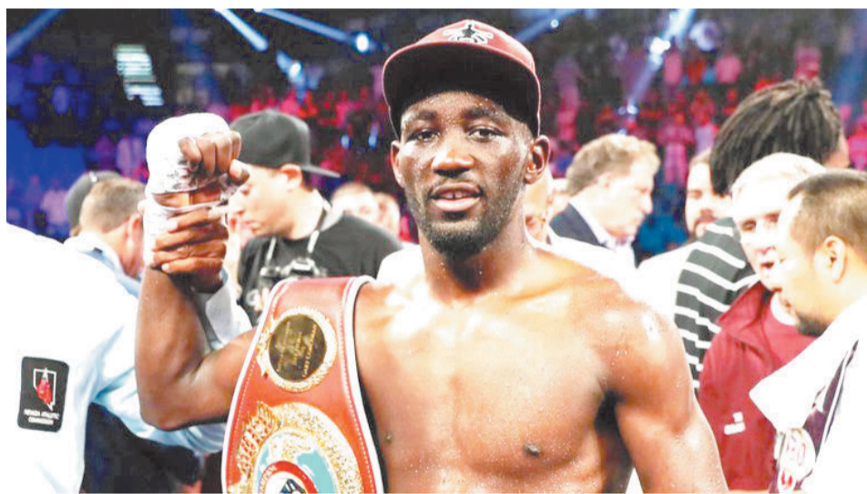
Three-weight world champion Crawford has an unblemished record of 33-0. Skysports