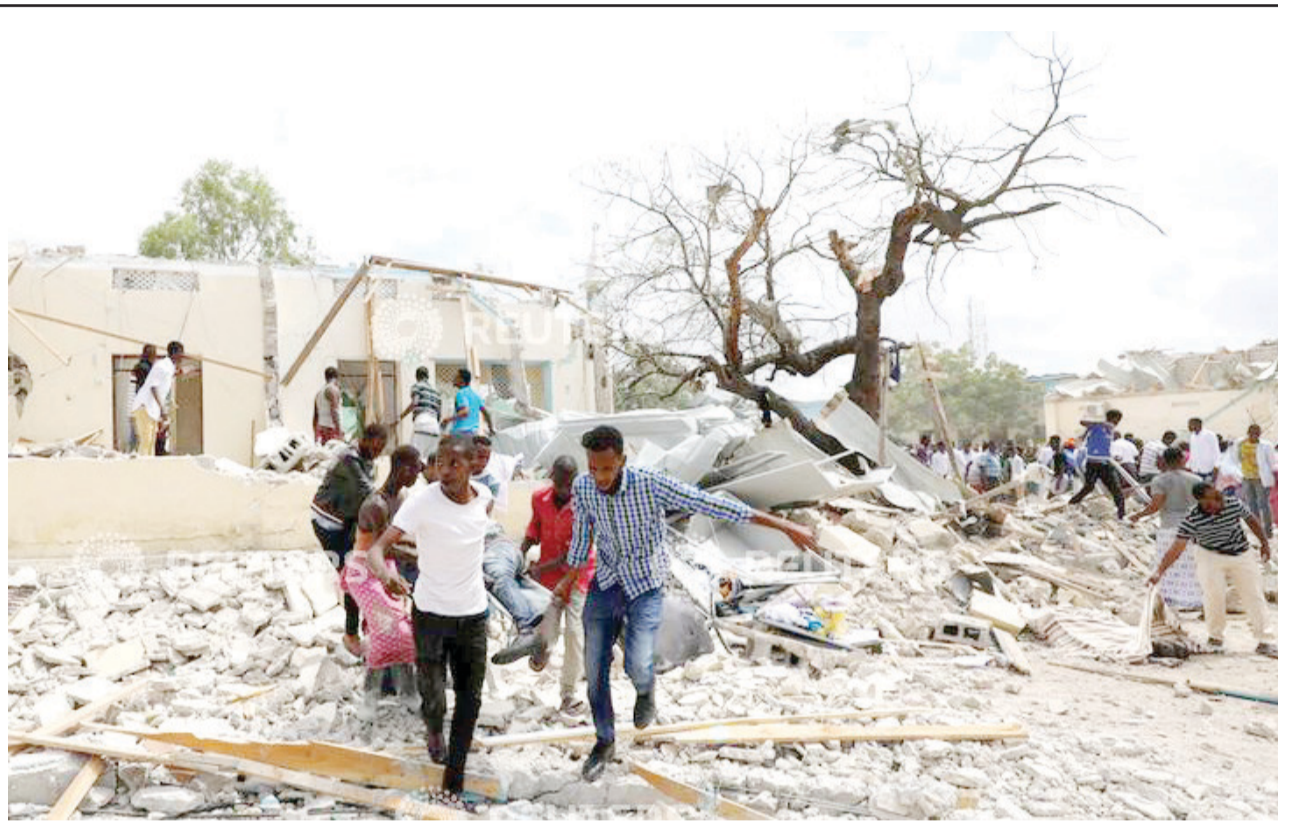
Rescuers carry a wounded man from the scene of an explosion after suicide car bomb rammed in a local government building in Hodan district, Mogadishu, Somalia.

The situation has worsened despite the United States lifting its decades-old trade embargo last October. ALJAZEERA