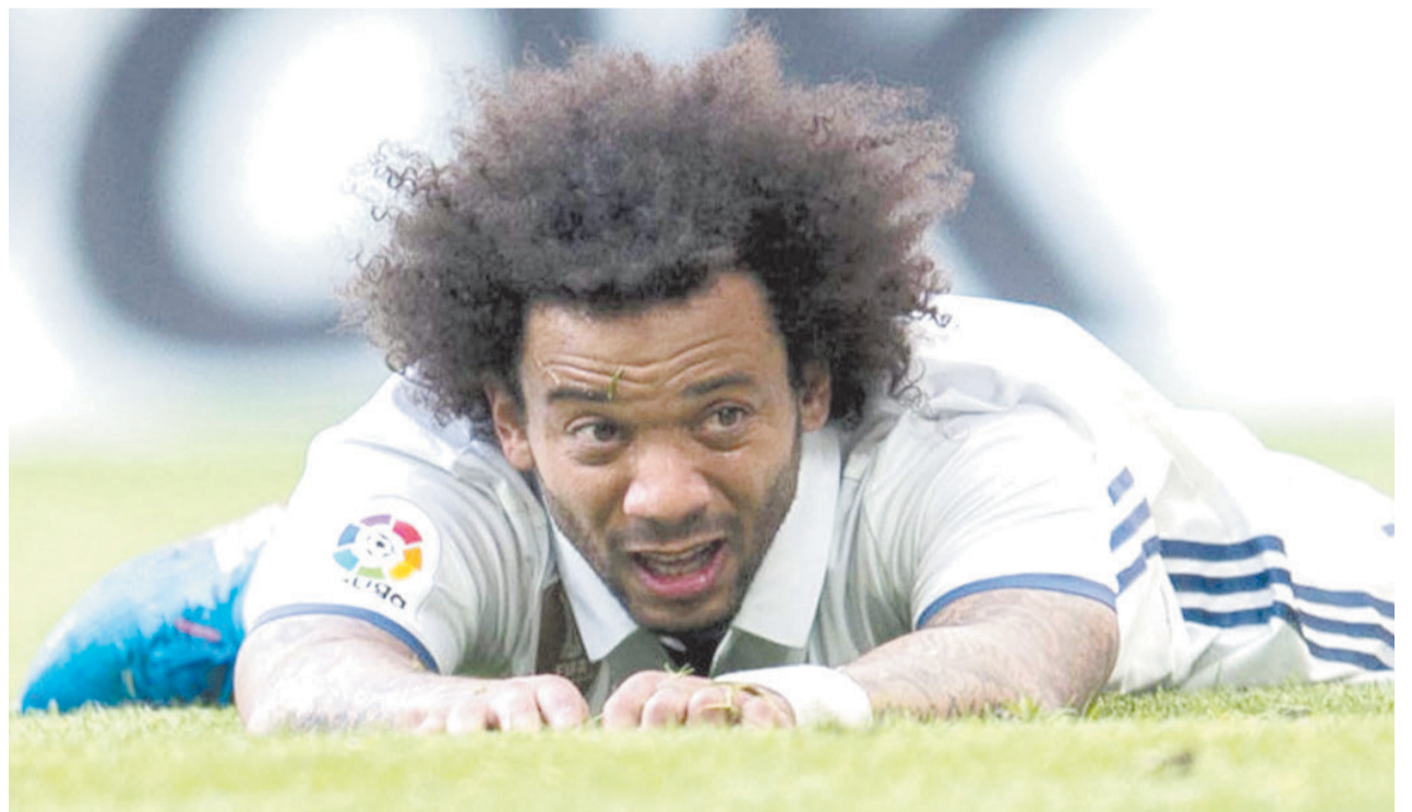
Marcelo slapped with four-month prison term and €750,000 fine in tax fraud case.