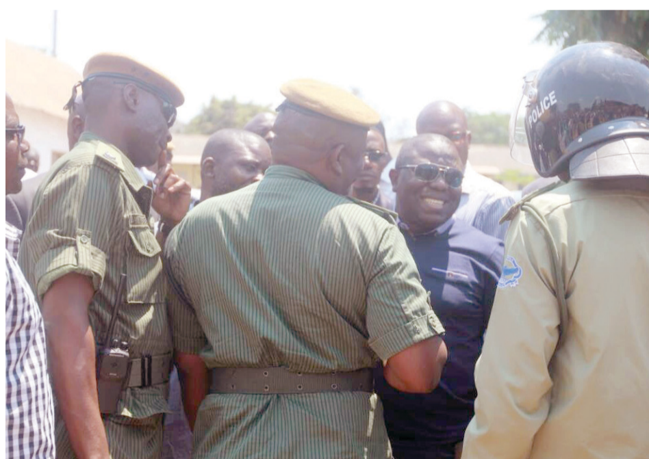
Ndola Police surround Democratic Party leader and 2021 presidential aspirant Harry Kalaba when he arrived for questioning at C/Belt Force headquarters yesterday