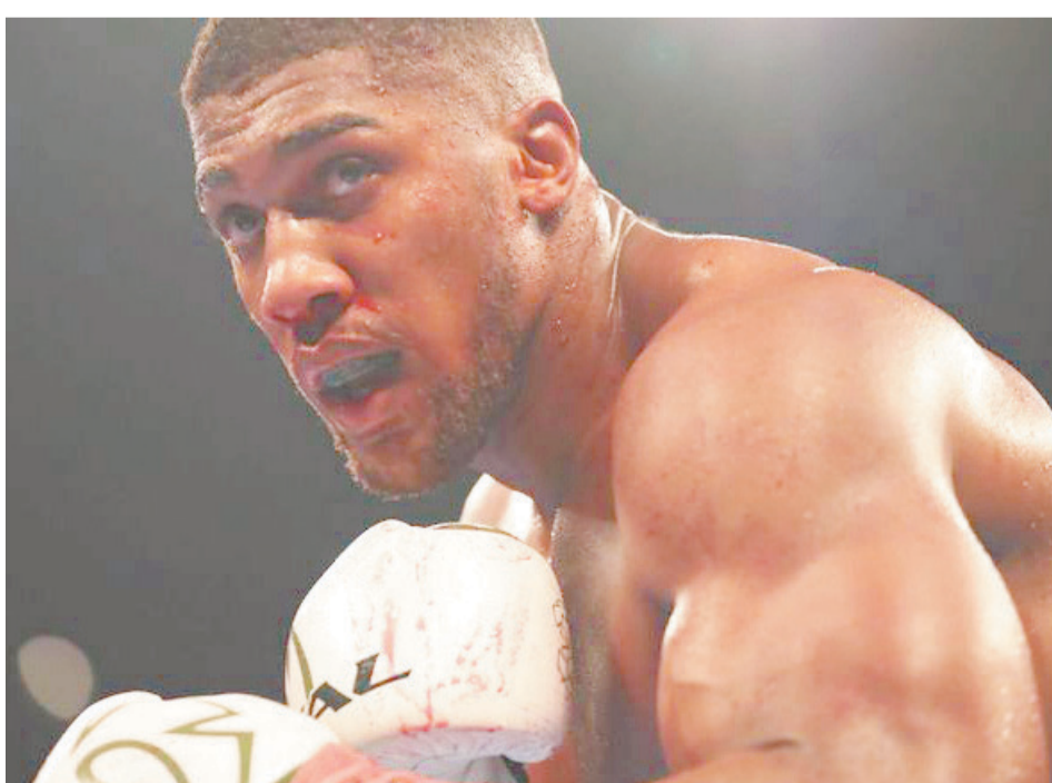
Joshua vs Povetkin: Anthony Joshua vows to bring back 'aggressive style' - Skysports