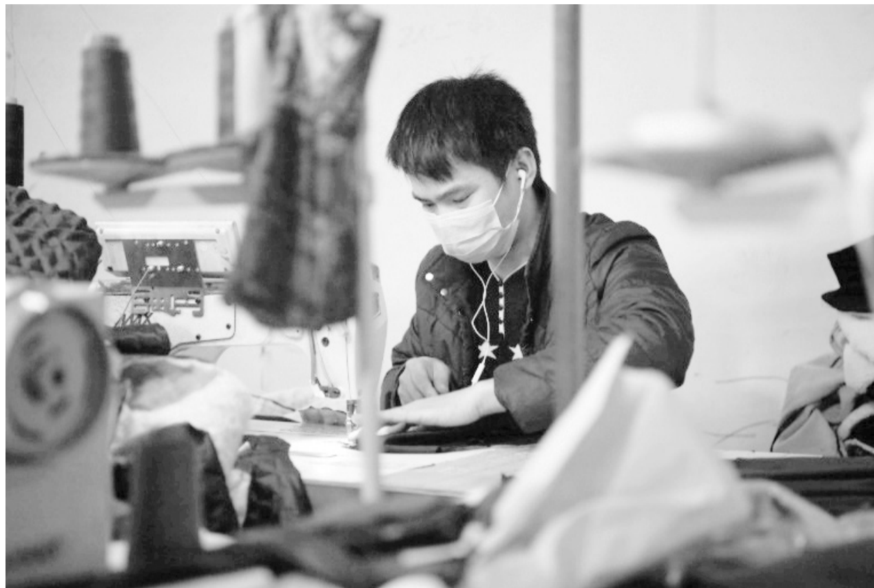
China's textiles factories are among those looking to relocate abroad to avoid US tariffs. AFP

The country's war games in Eastern Europe last year, Zapad-2017, saw 12,700 troops take part according to Moscow. Ukraine and the Baltic states said the true number was far bigger. AFP