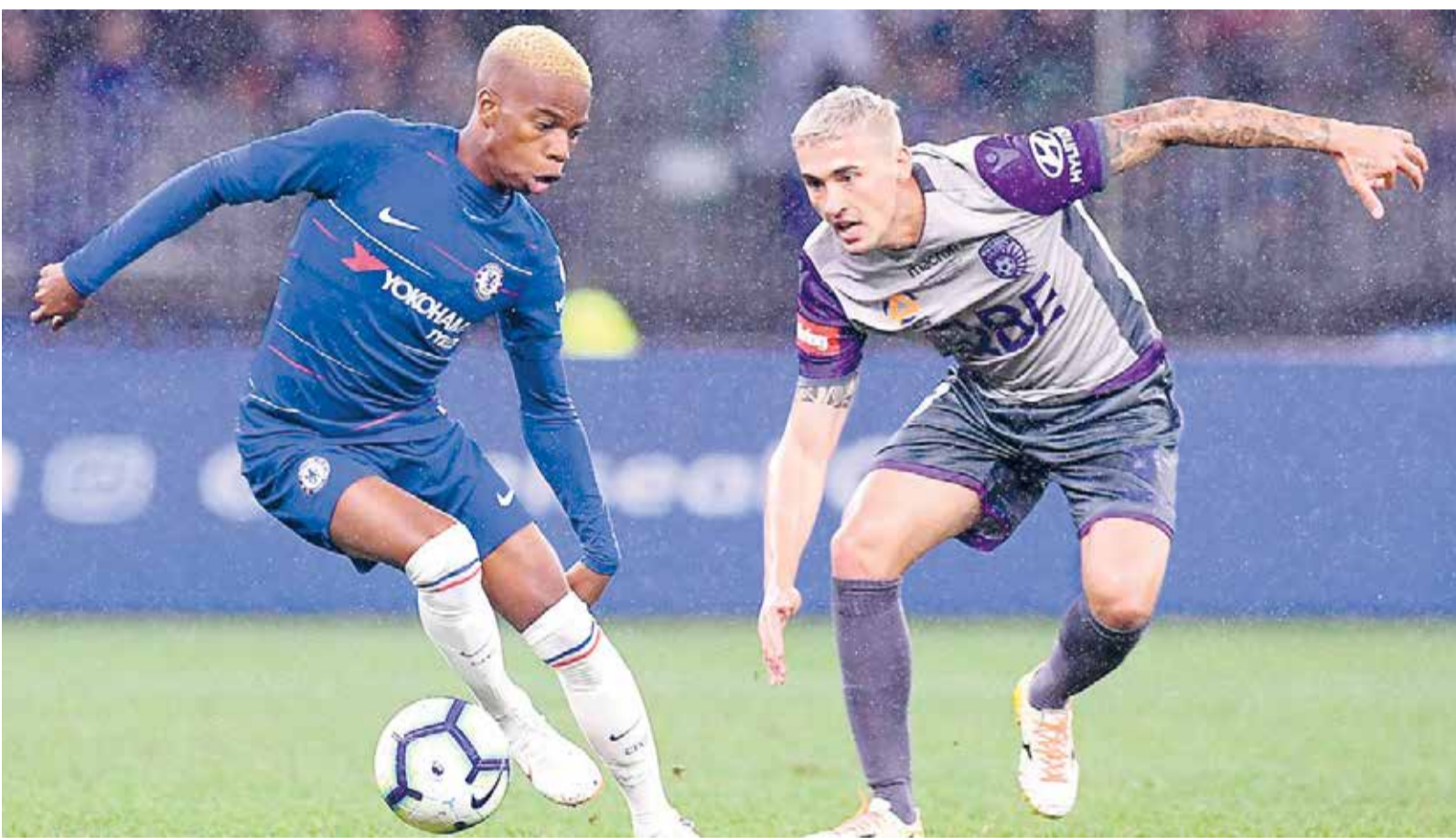
Chelsea's Charly Musonda to miss over a month due to injury. The winger who is yet to make his competitive debut for his loan club Vitesse got injured while playing a behind closed doors friendly match against Royal Antwerp.