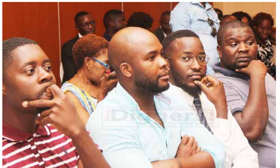
Members of the general public listen to proceedings of the discussion on Separation of powers organised by News Diggers! In partnership with the Open Society Initiative for Southern Africa (OSISA) at Southern Sun Hotel on Tuesday evening