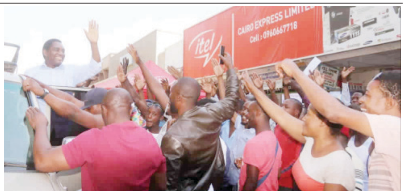
UPND president Hakainde Hichilema interacts with traders in the Lusaka Central Business District yesterday