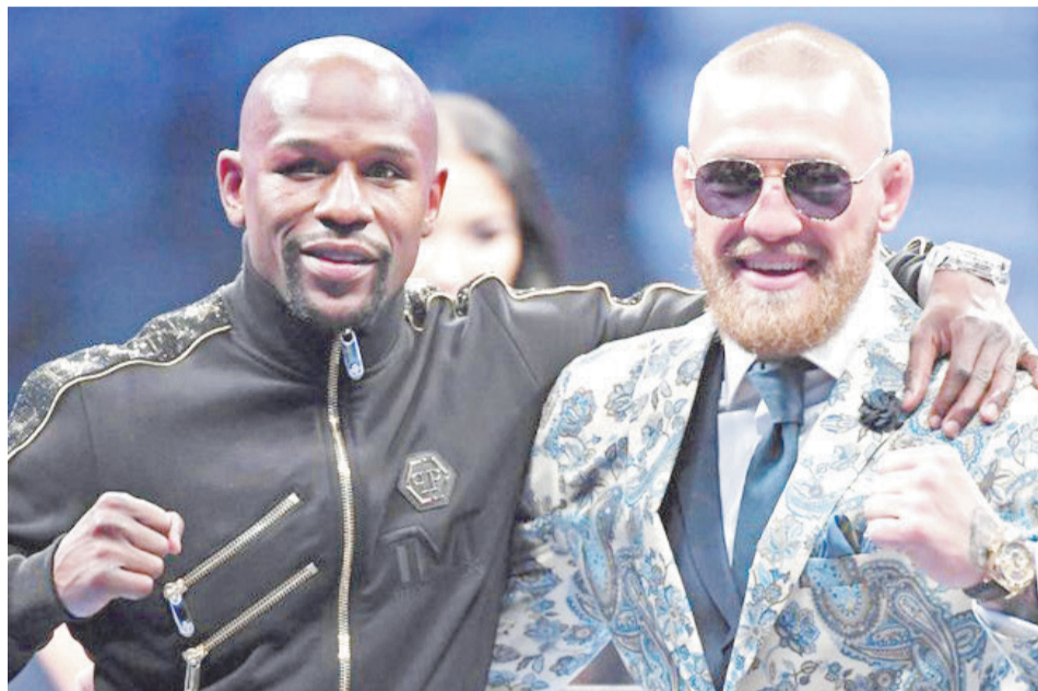
Conor McGregor has challenged Floyd Mayweather to another fight but has ruled out a modified rules bout, saying "it's either a straight MMA or straight boxing". Skysports

Ronaldo denies 'fake news' rape claim as police reopen investigation Story page 12