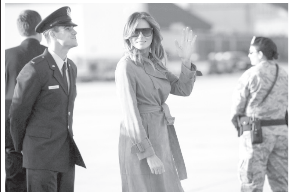
Melania Trump flew from Washington to Ghana to start an African tour.

In an interview with Al Jazeera, he discusses unseating Biya at the October 7 polls and reuniting a nation at war with itself. AL JAZEERA