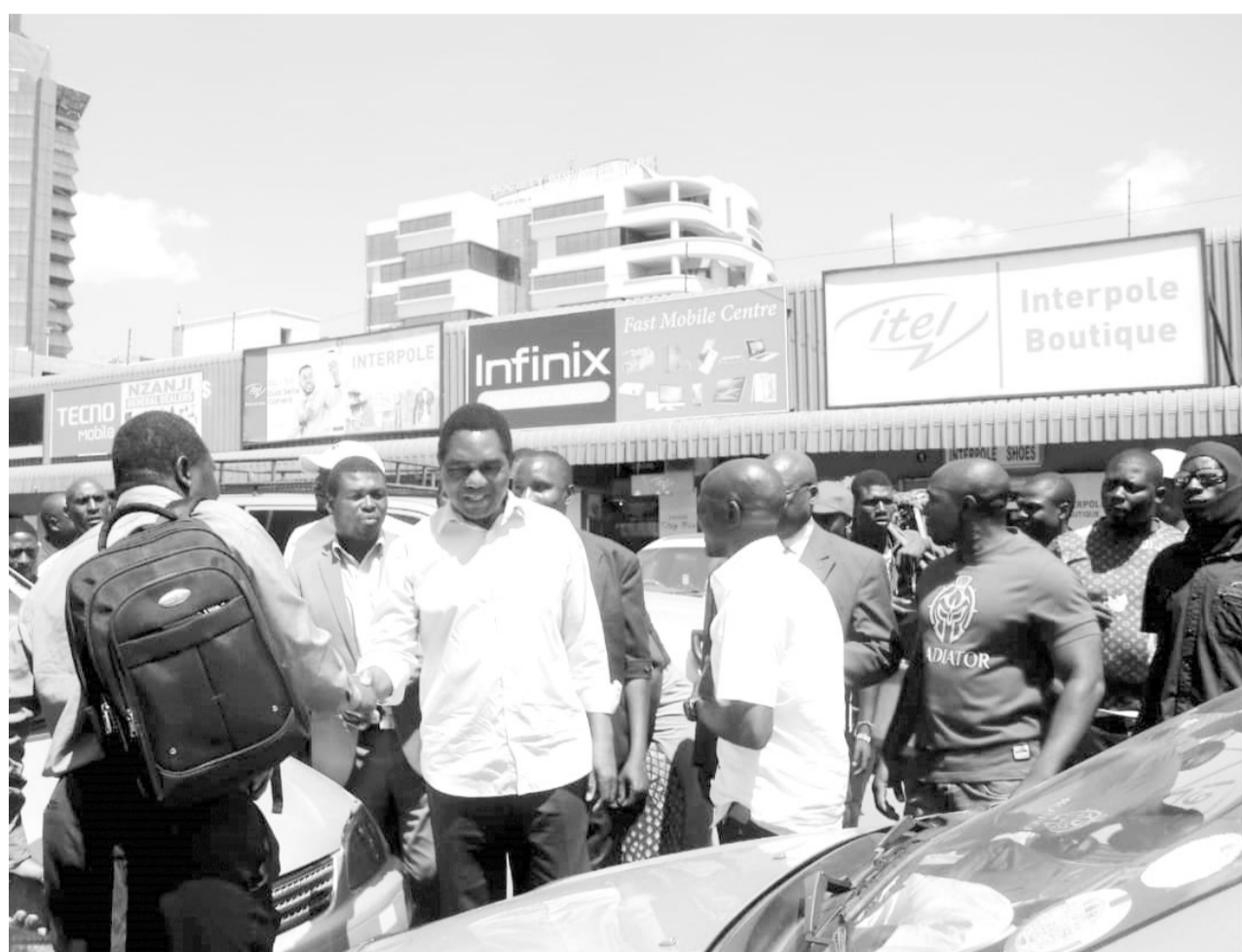
UPND leader Hakainde Hichilema interacts with traders in the Lusaka Central Business District