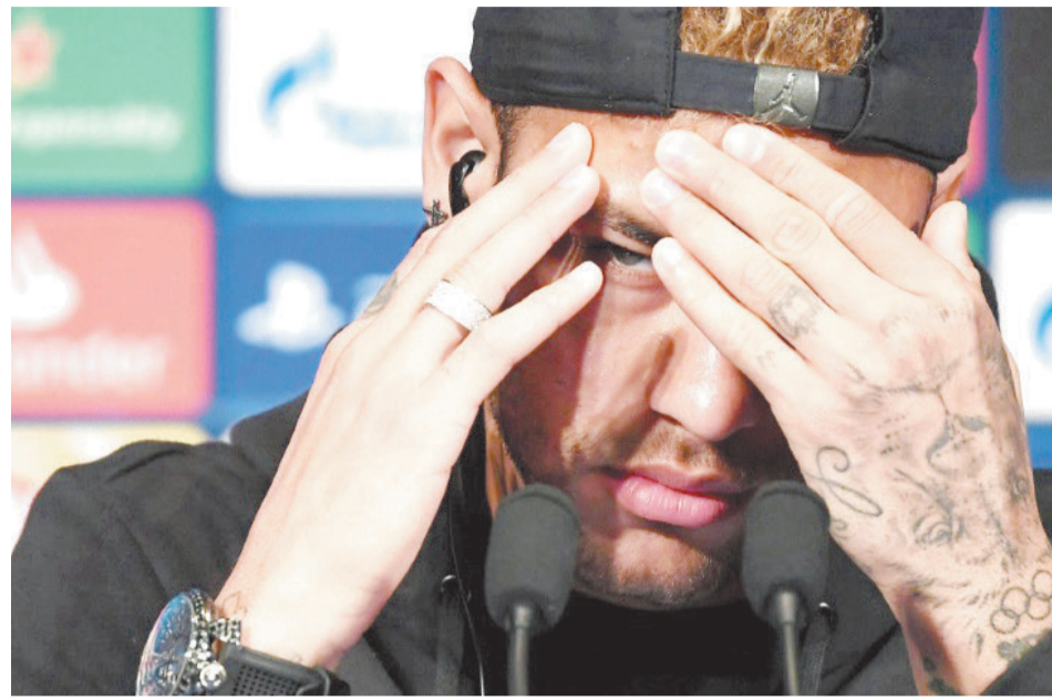
Neymar said on Tuesday that last season's injury made him 'very sad' and elimination in the World Cup was a 'great frustration'.