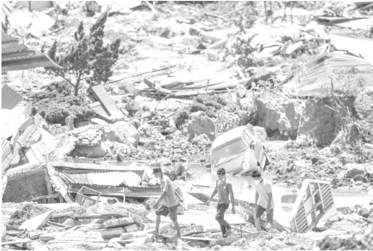
Evidence of the sheer power of the disaster that was unleashed on northern Sulawesi, Indonesia is everywhere.