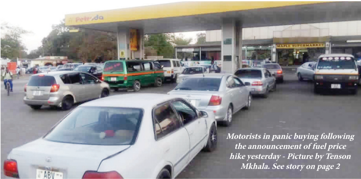
Motorists in panic buying following the announcement of fuel price hike yesterday - Picture by Tenson Mkhala. See story on page 2