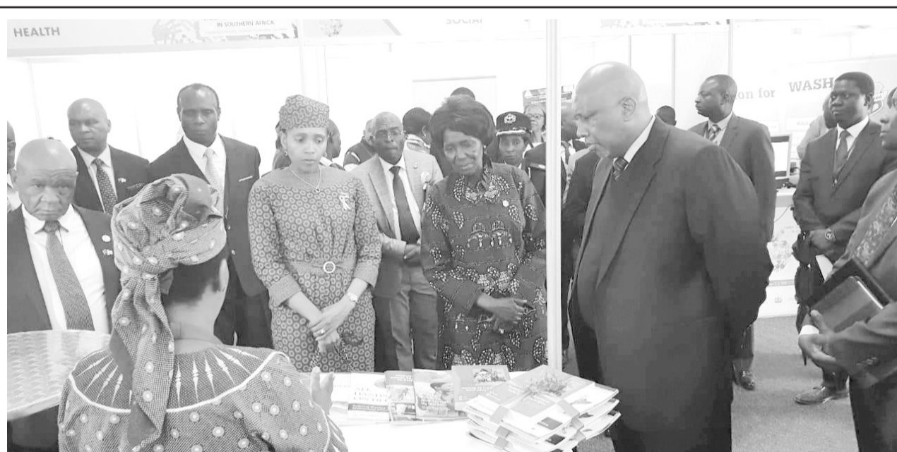
Vice President Inonge Wina with His Majesty King Letsie III and Queen Masenate Mohato, and Prime Minister Dr Tom Thabane, tour the exhibition stands at the Thaba Bosiu, Lesotho

is important. Without that, the SMEs will not reap the good that is provided here. I think this will change the profiling of SMEs for the future," said Yaluma.