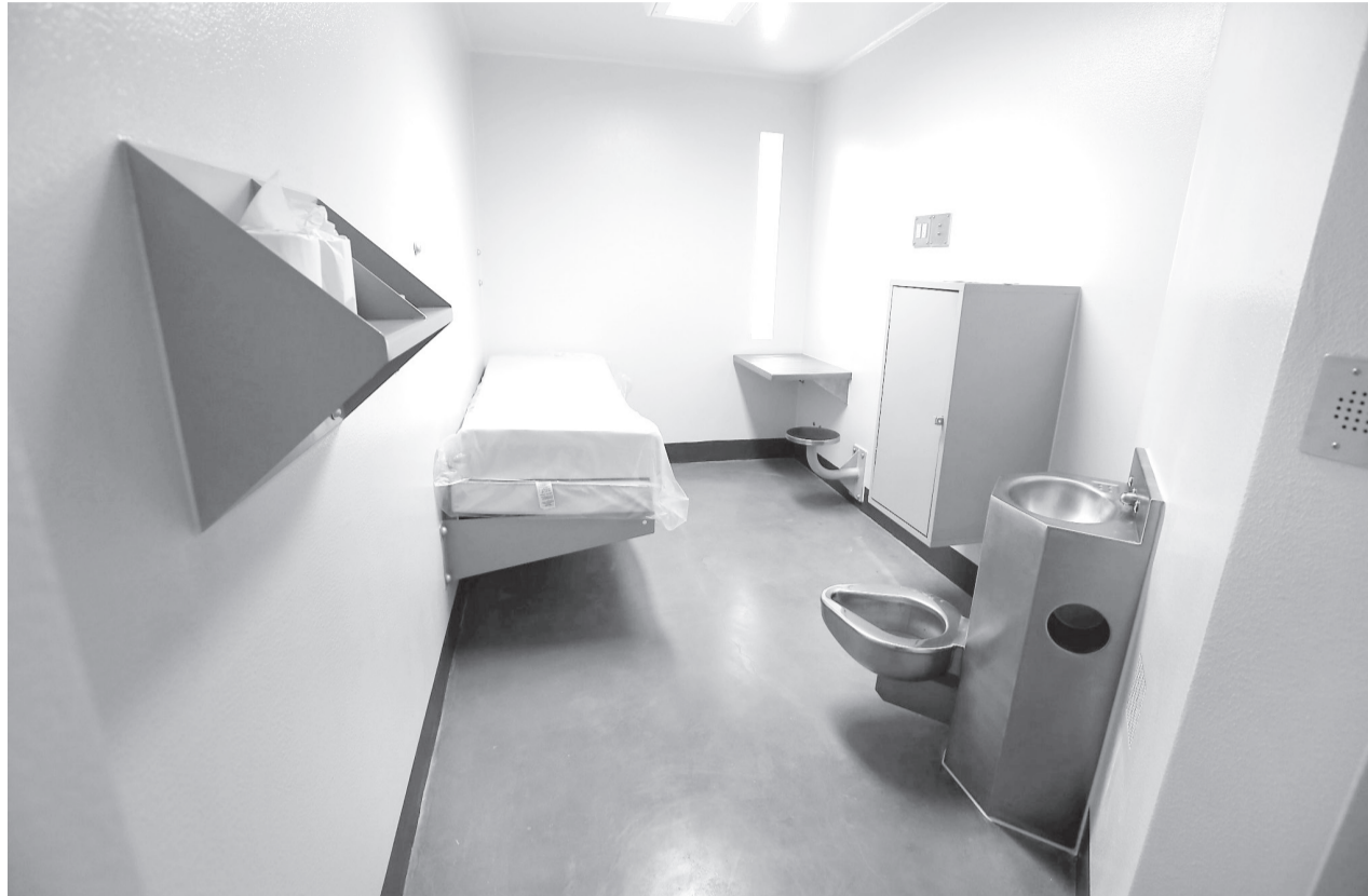
A single cell near the infirmary at the State Correctional Institution at Phoenix in Collegeville, Pa. Bill Cosby has just completed a week at the prison following his three-to-10-year prison sentence for sexual assault.