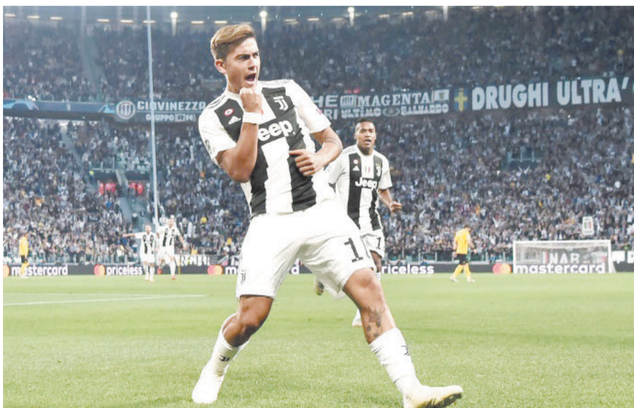
Dybala celebrates after scoring a hat-trick as Juventus shrugged off Cristiano Ronaldo's absence with a 3-0 Champions League win over Young Boys on Tuesday to go top of Group H ahead of Manchester United.

The offence carries a maximum penalty of up to five years in jail.