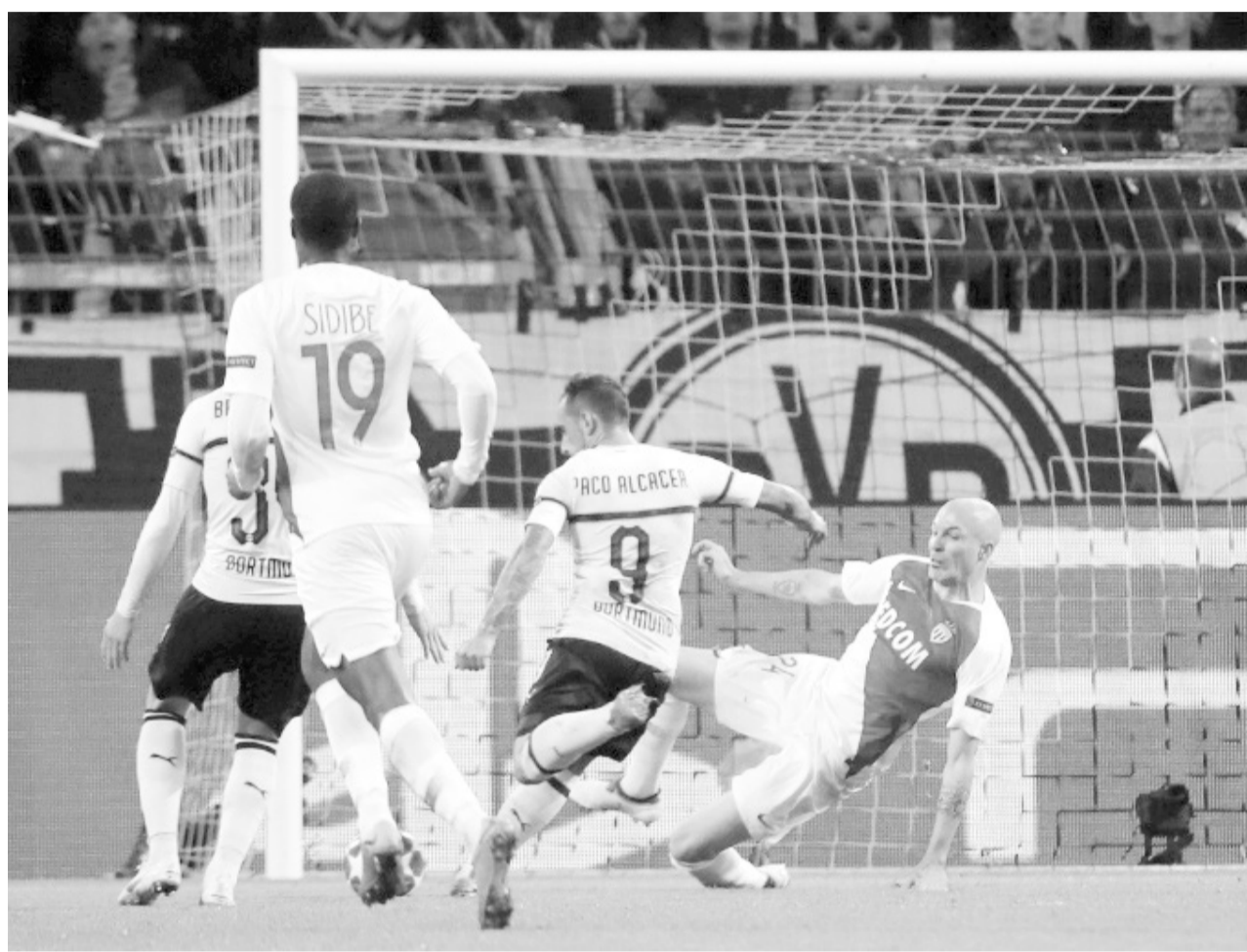
Paco Alcacer scored his fourth goal for Dortmund on just his third appearance for the side.