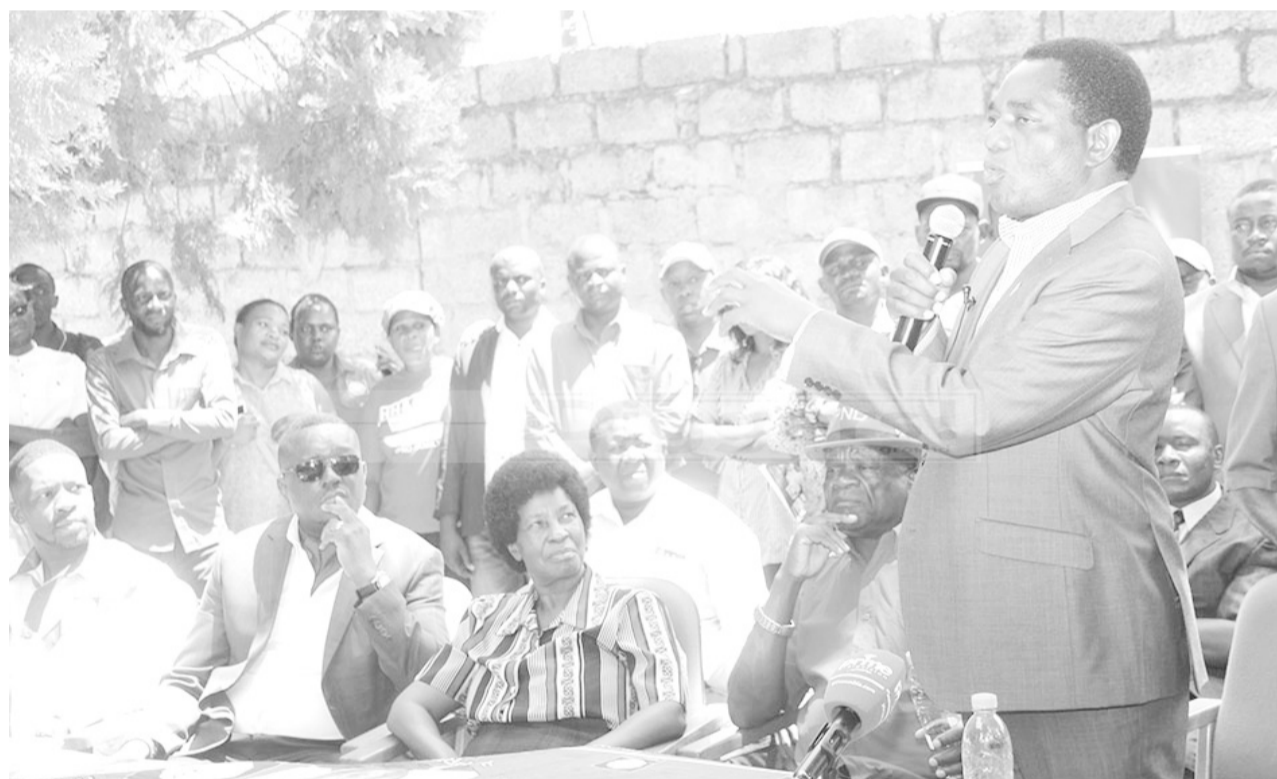
United Party for National Development (UPND) leader Hakainde Hichilema addressing journalists during a press briefing at the party secretariat in Lusaka yesterday

promises that we have made to ourselves under Africa Agenda 2063 will not be realised. You can see that the rise of China is not restricted only to the economic arena; they are also in the fullness of time going to afflict us with their political bacteria and that bacteria may very well inform how we conduct our politics. My view is; engage with China at the level of the economy, but define your interest. Engage with China, politically, but let us define for ourselves what democracy means to us. Engage with China in the arena of security, but not in a manner that undermines our sovereignty so that in real terms, the problem is largely with us," Prof Lumumba advised. "Our political leaders are not thinking of the next generation, but are ever-thinking about the next election! The Chinese are thinking for the next generation; they are asking themselves, 'in a 100 years' time, how will we relate with the world and with Africa?' Because if you look at the world quite keenly, there is a sense in which there is a new 'scramble for Africa.' There is a new scramble for African resources and China is at the forefront of it. China is prepared, they are moving with the delicacy of a sleepwalker and we are sleeping ourselves, and they will devour us! We can only survive if we are smart and the sooner we recognise it, the safer we are; it is only that way that we will stop our young men and women from dying."