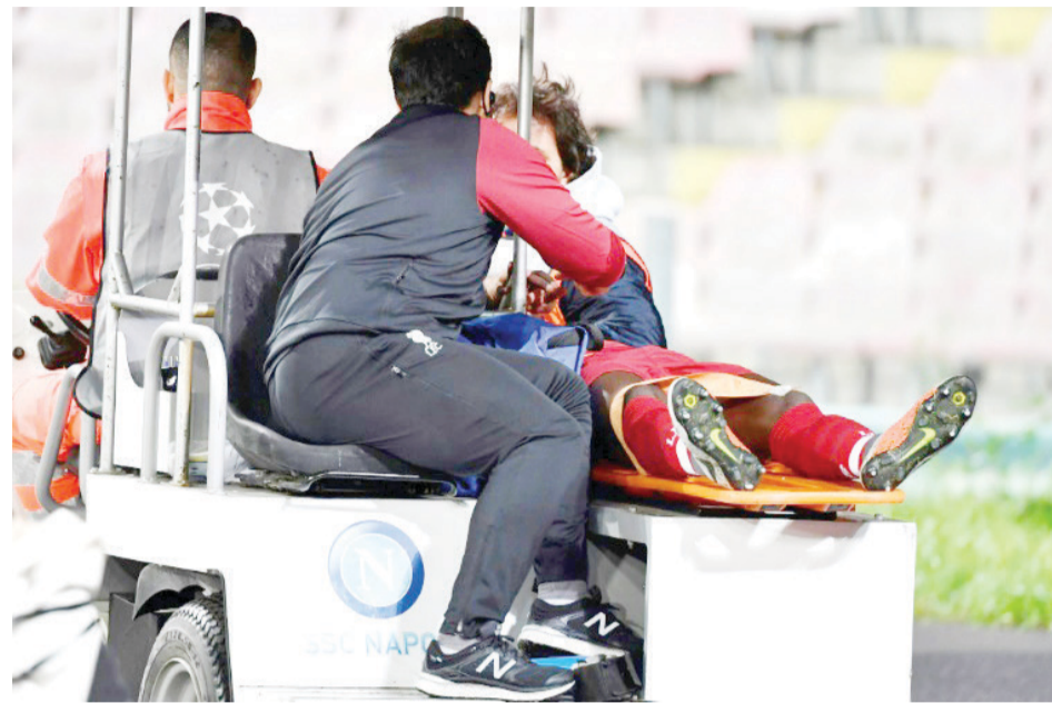
Liverpool's midfielder Keita was taken to the hospital after complaining of back pain leading to his being taken off early in their Champions League clash with Napoli on Wednesday.