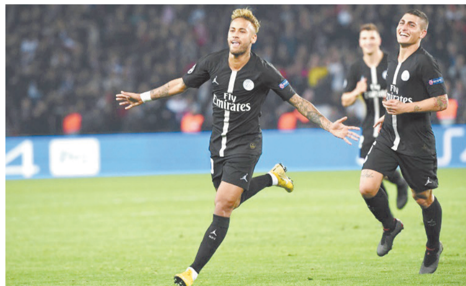
Neymar celebrates after scoring the free-kick that completed his hat-trick to lead Paris Saint-Germain to a 6-1 rout of Red Star Belgrade in the Champions League on Wednesday.