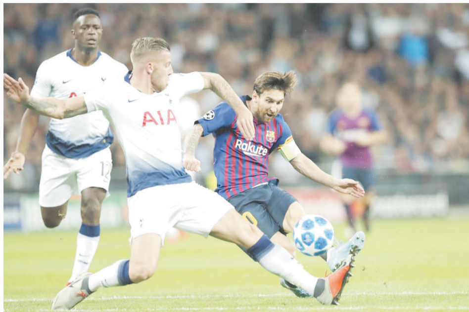
Lionel Messi gives the Spurs defence yet another scare on a victorious night for his Barcelona side at Wembley with a 4-2 win at Wembley on Wednesday.