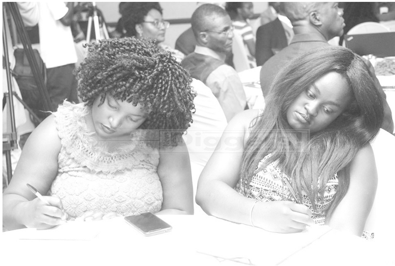
Journalists take notes at a public discussion forum on the state of the economy and public investment in children held at Southern Sun Hotel in Lusaka on Friday