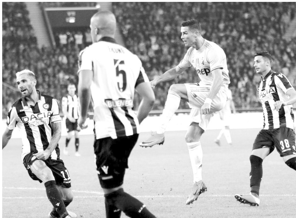
Cristiano Ronaldo shrugged damaging rape claims to score for Juventus as the Italian champions beat Udinese 2-0 to stretch their lead at the top of Serie A on Saturday.