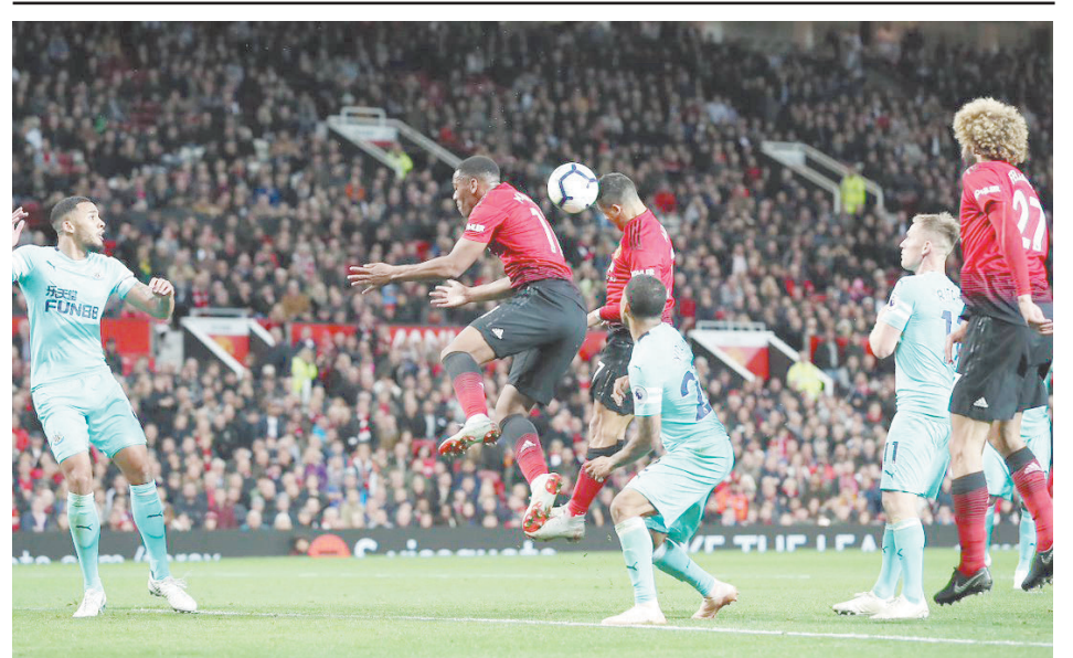
Alexis Sanchez heads in the winning goal for Manchester United to Erase Two-Goal Deficit To Beat Newcastle in dramatic 3-2 win over Newcastle United.