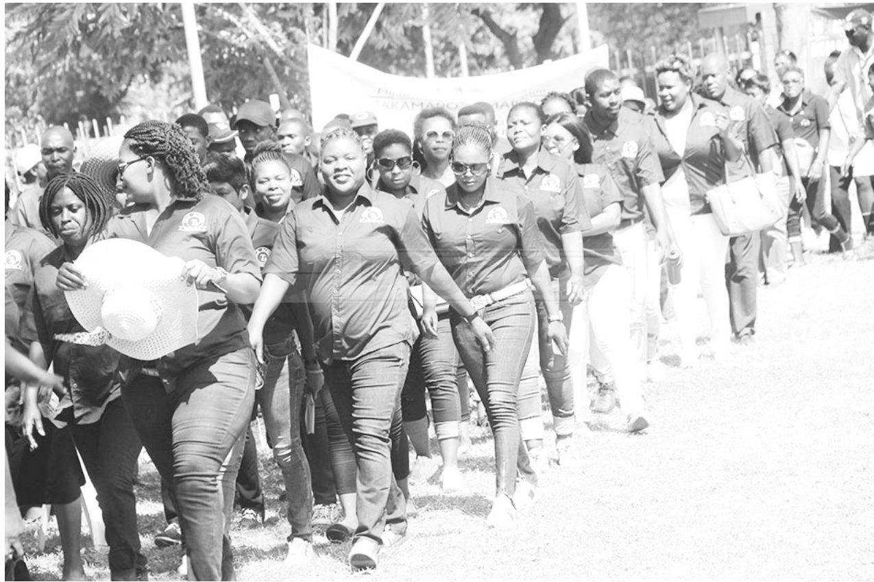
Teachers march as they commemorated this year’s International Teacher Day under the theme: ‘The right to education is the right to a qualified teacher’ held at Lusaka’s Civic Centre Nakatindi ground on Friday