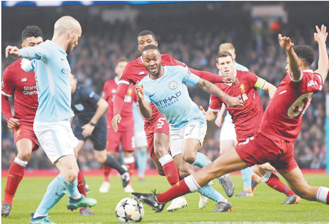
Premier League champions Manchester City reclaimed top spot in the table thanks to a goalless draw against title rivals Liverpool on Sunday.