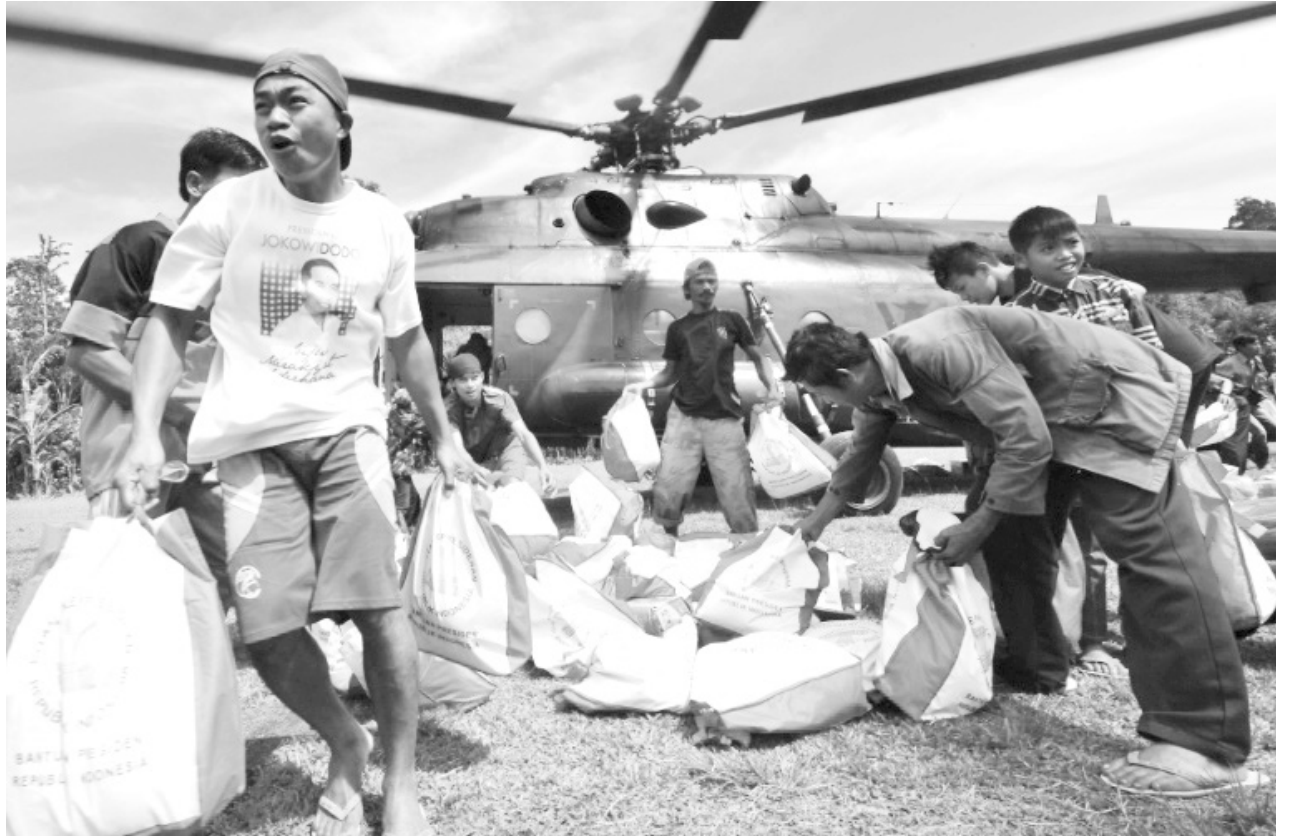
Indonesian army choppers are running missions to deliver supplies to remote parts of the region. AFP

villages, despite more than a week lapsing since the quake. AFP