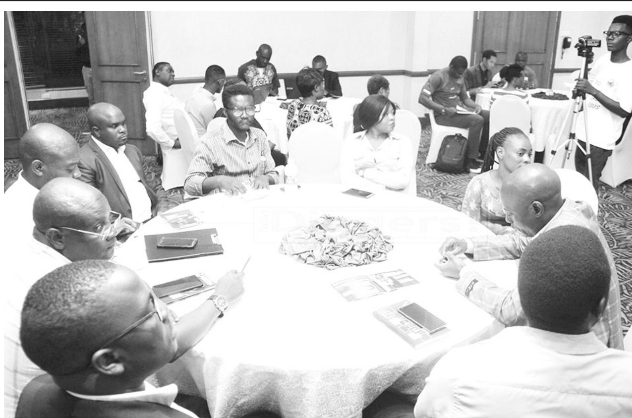
Members of the public at a discussion forum on the state of the economy and public investment in children at Southern Sun Hotel in Lusaka on Friday