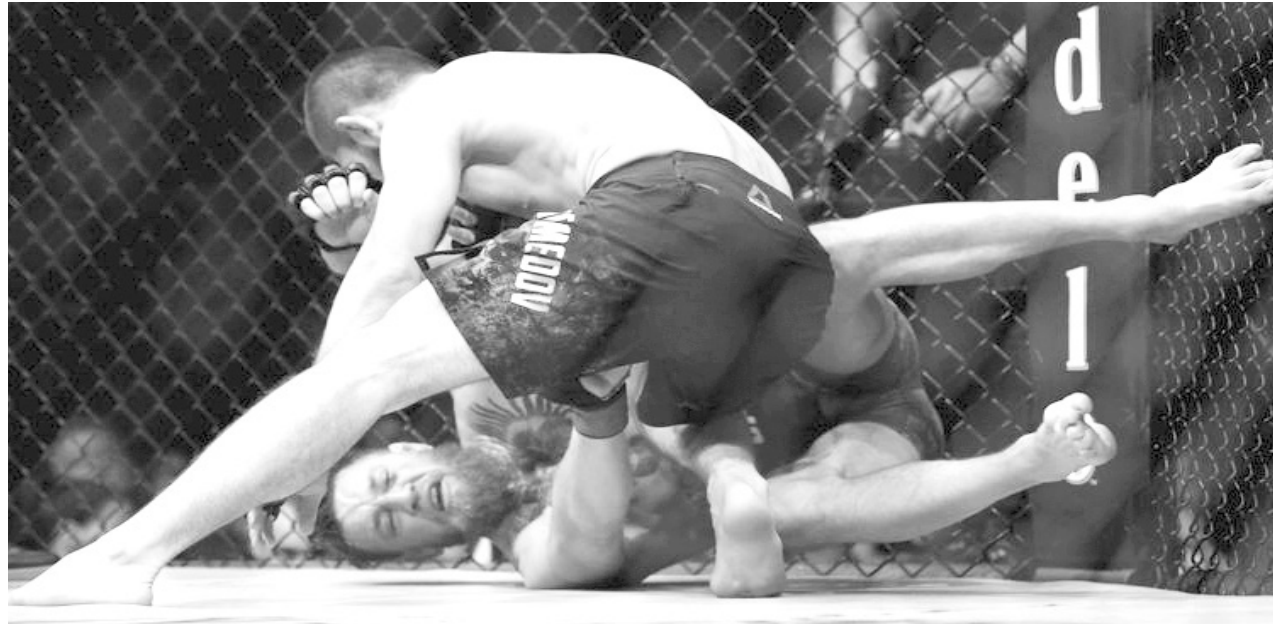
Khabib Nurmagomedov gets Conor McGregor in a choke hold to end the fight