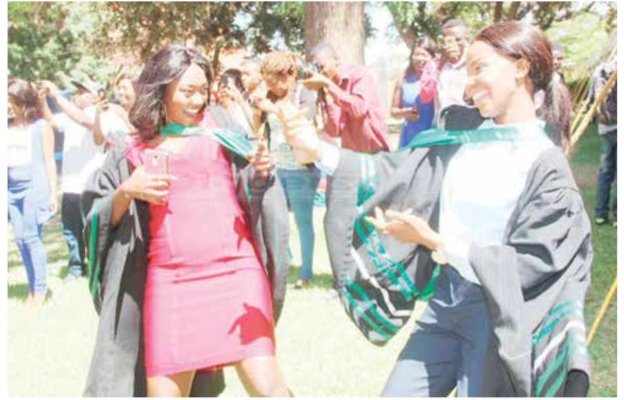
Graduates of Zambia Institute of Mass Communication celebrate the 5th graduation ceremony at ZAMCOM grounds on Friday