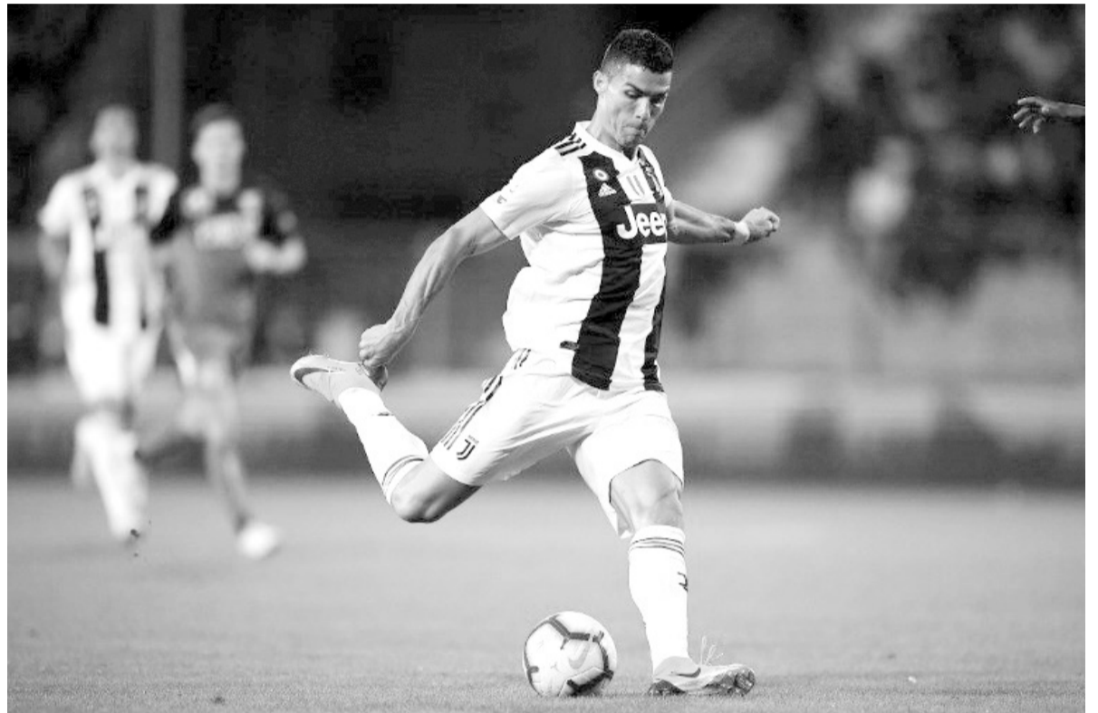
Cristiano Ronaldo shoots and scores a second goal during the Italian Serie A football match between Empoli and Juventus as Italian champions Juventus surged seven points clear in Serie A following a battling 2-1 victory at Empoli on October 27, 2018 at the Carlo Castellani Stadium in Empoli.

Another witness said it appeared "the tail propeller wasn't working, putting it into a spin". BBC