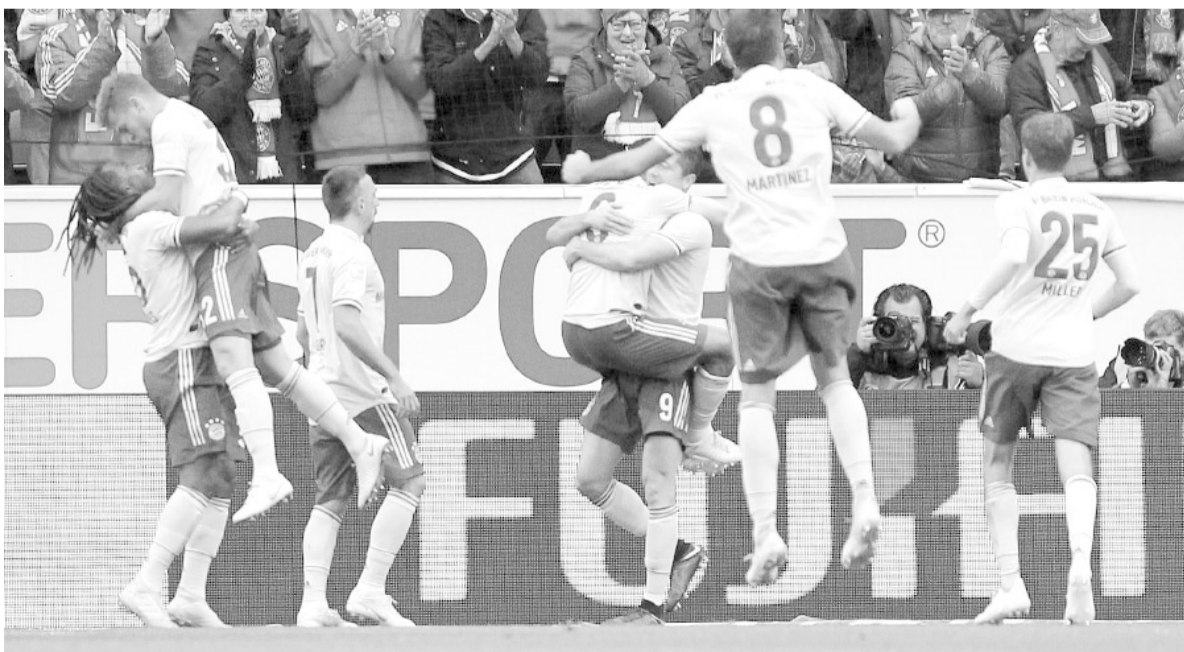
Bayern Munich's Spanish midfielder Thiago Alcantara (C) celebrates scoring the 2-1 with his teammates during the German first division Bundesliga football match FSV Mainz 05 vs FC Bayern Munich in Mainz, western Germany, on October 27, 2018.