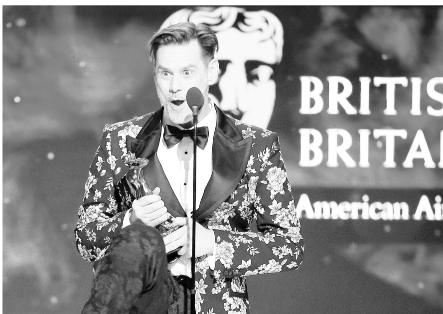
Jim Carrey accepts the Charlie Chaplin Britannia Award for Excellence in Comedy presented by Jaguar Land Rover onstage at the 2018 British Academy Britannia Awards presented by Jaguar Land Rover and American Airlines at The Beverly Hilton Hotel on October 26, 2018 in Beverly Hills, California.

for Joshua and JJ's joint cover, with a picture of the magazine on the boxer's Instagram page garnering more than 250,000 likes in four hours. YAHOO