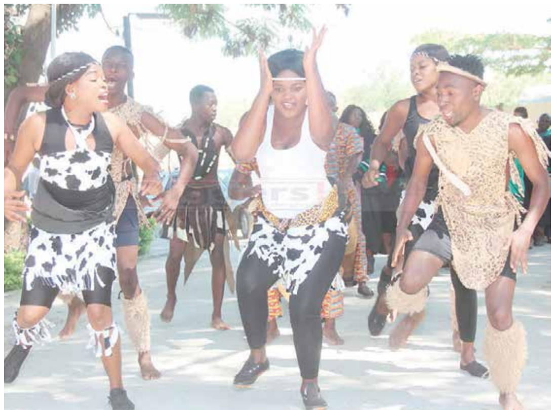
Nomakanjani dance troupe perform during the ZAMCOM 5th graduation ceremony