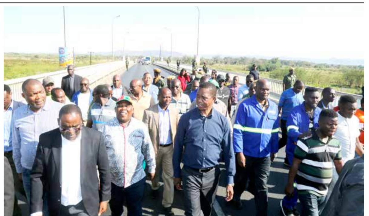
President Edgar Chagwa Lungu (centre) walks on the Kafue Bridge after checking on the Kafue Weed in Kafue on Saturday, October 27, 2018

KPMG, the globally-renowned audit, tax and advisory services firm, earlier this month warned that government's insistence to introduce the controversial Sales Tax next April will create uncertainty in the Zambian economy, which would be "very injurious" to business.