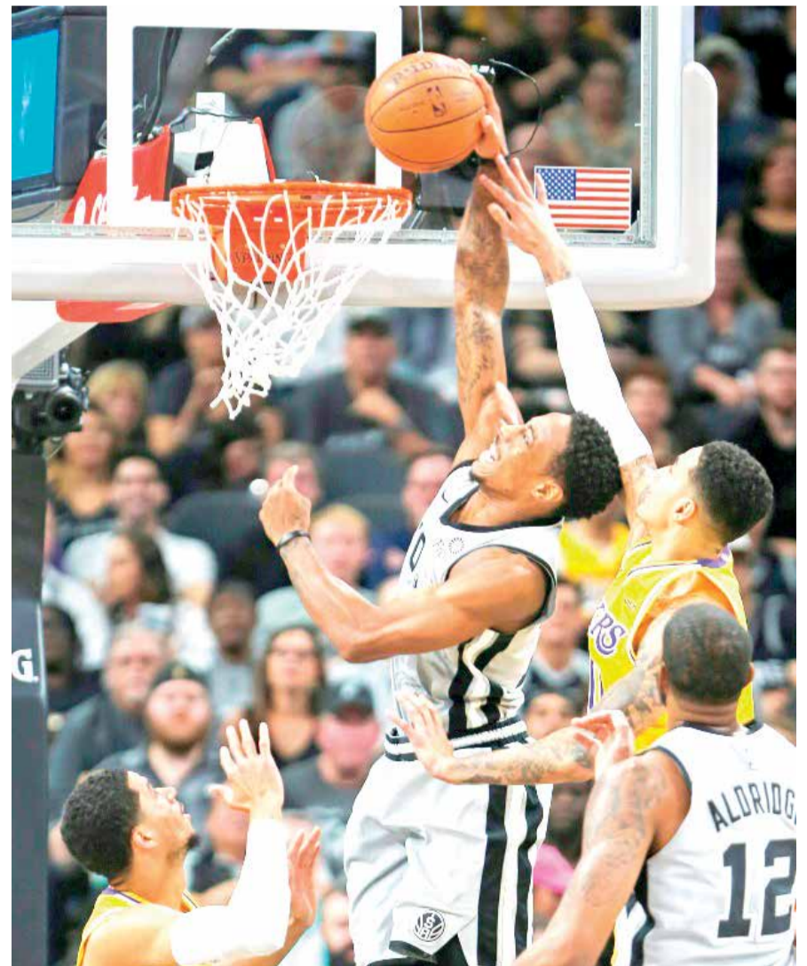
DeMar DeRozan of the San Antonio Spurs dunks in front of Los Angeles Lakers Kyle Kuzma.