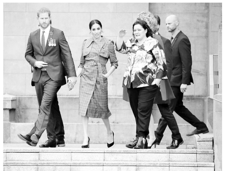
Britain's Prince Harry and Meghan, Duchess of Sussex, visit Pukeahu National War Memorial Park in Wellington, New Zealand, October 28, 2018.