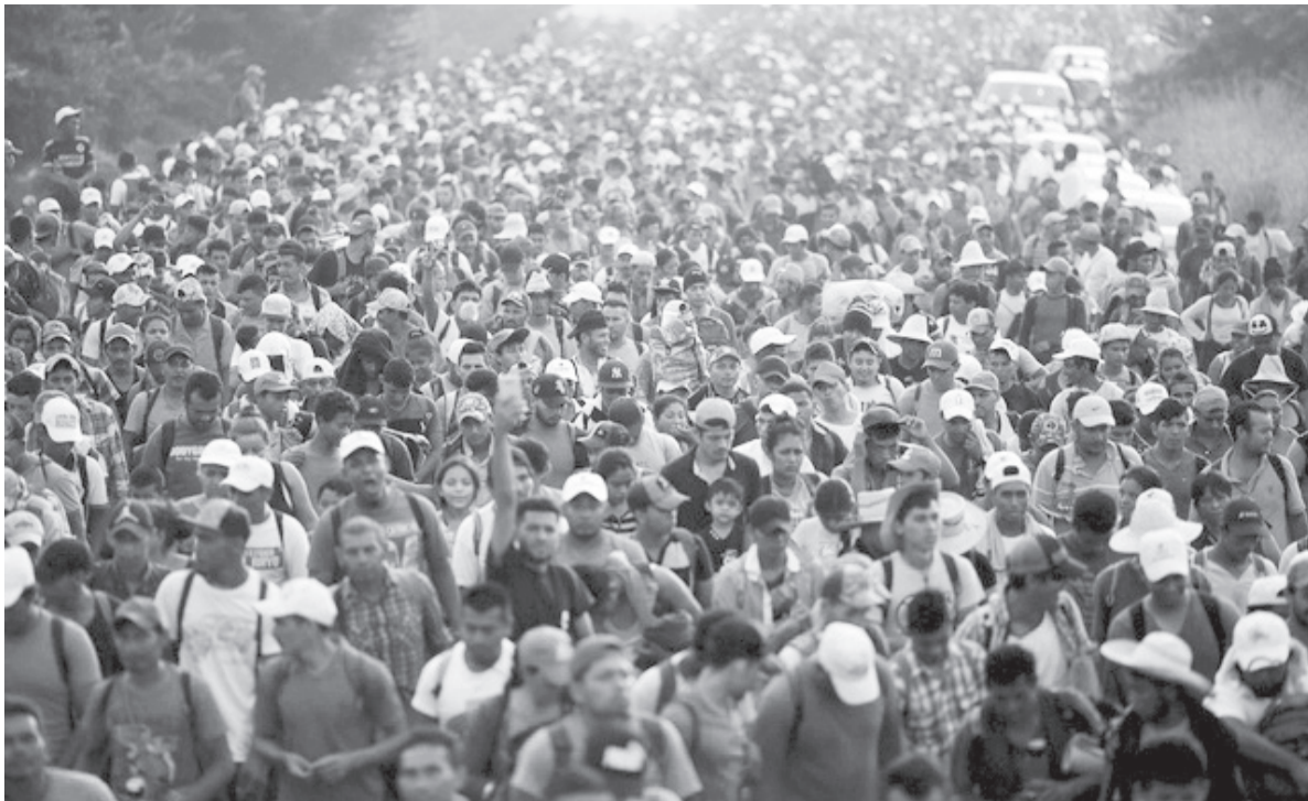
A caravan of thousands of migrants from Central America, en route to the United States, makes its way to San Pedro Tapanatepec from Arriaga, Mexico October 27, 2018.