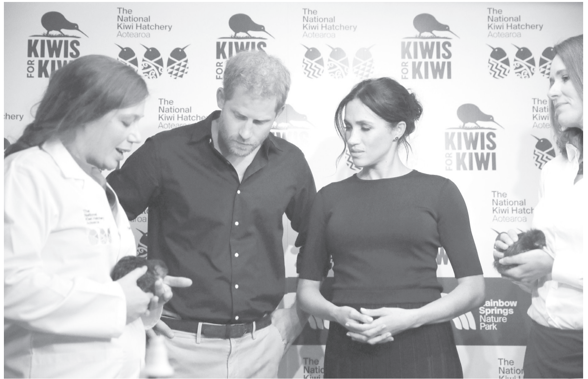
Britain's Prince Harry and Meghan, the Duchess of Sussex talk to staff as they look at kiwi chicks during a visit to the National Kiwi Hatchery at Rainbow Springs in Rotorua, New Zealand, Wednesday, Oct. 31, 2018.

Felipe was also 13 when he read his first speech publicly in 1981.