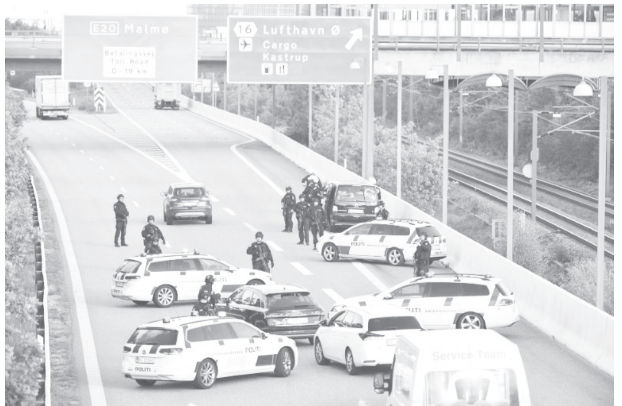
Denmark has recalled its ambassador to Iran following an alleged assassination plot foiled in late September that forced the shut down of bridges and ferries to Sweden.

A UN-run radio station has tweeted a picture of the arrival of Somalia's leader.