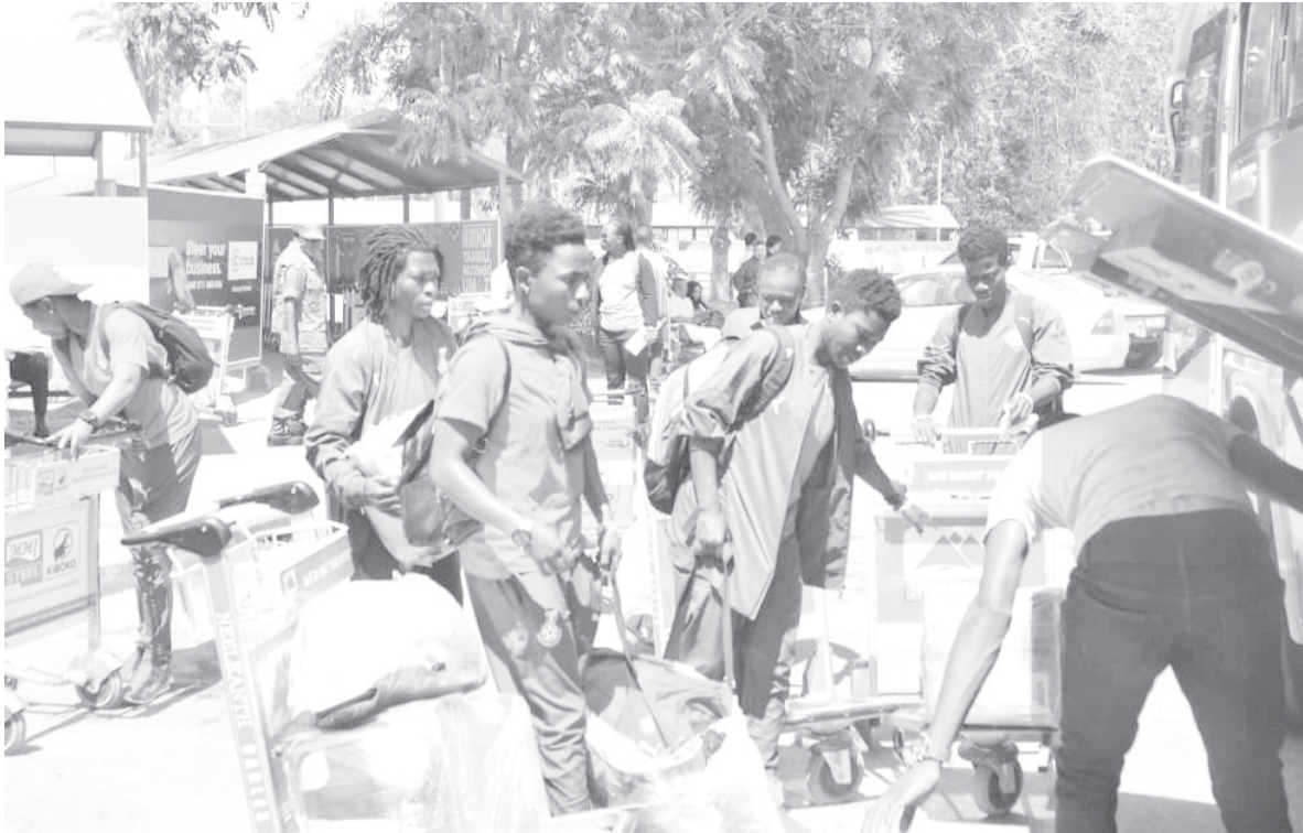
Ghana Women's soccer team arrive at KK International airport ahead of Saturday's friendly game against Shepolopolo