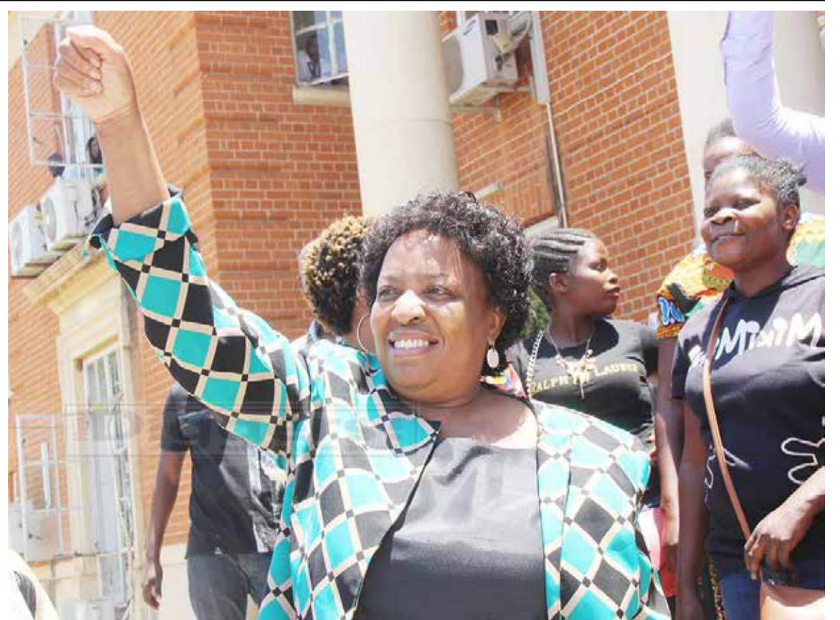
Labour Minister Joyce Simukoko flashes a PF symbol at Lusaka High Court shortly after showing solidarity to Lusaka Central Member of Parliament and Finance Minister Margaret Mwanakatwe who returning her seat which was nullified by the High Court on October 31, 2018

forward is that we need to conclude the cost of service study tomorrow. Then on the basis of that, we can efficiently cost the price of power. Based on that, we can formulate tariffs that are transparent even when they have to be adjusted, it would be clear and based on those tariffs, we can be able to formulate what manner reforms we do in the electricity industry. And that way, there will be no quarrels, no debates, no unnecessary arguments about tariffs costs because then, everybody will know how the cost of power is being derived. But right now, it's an elephant in the room which we don't know."