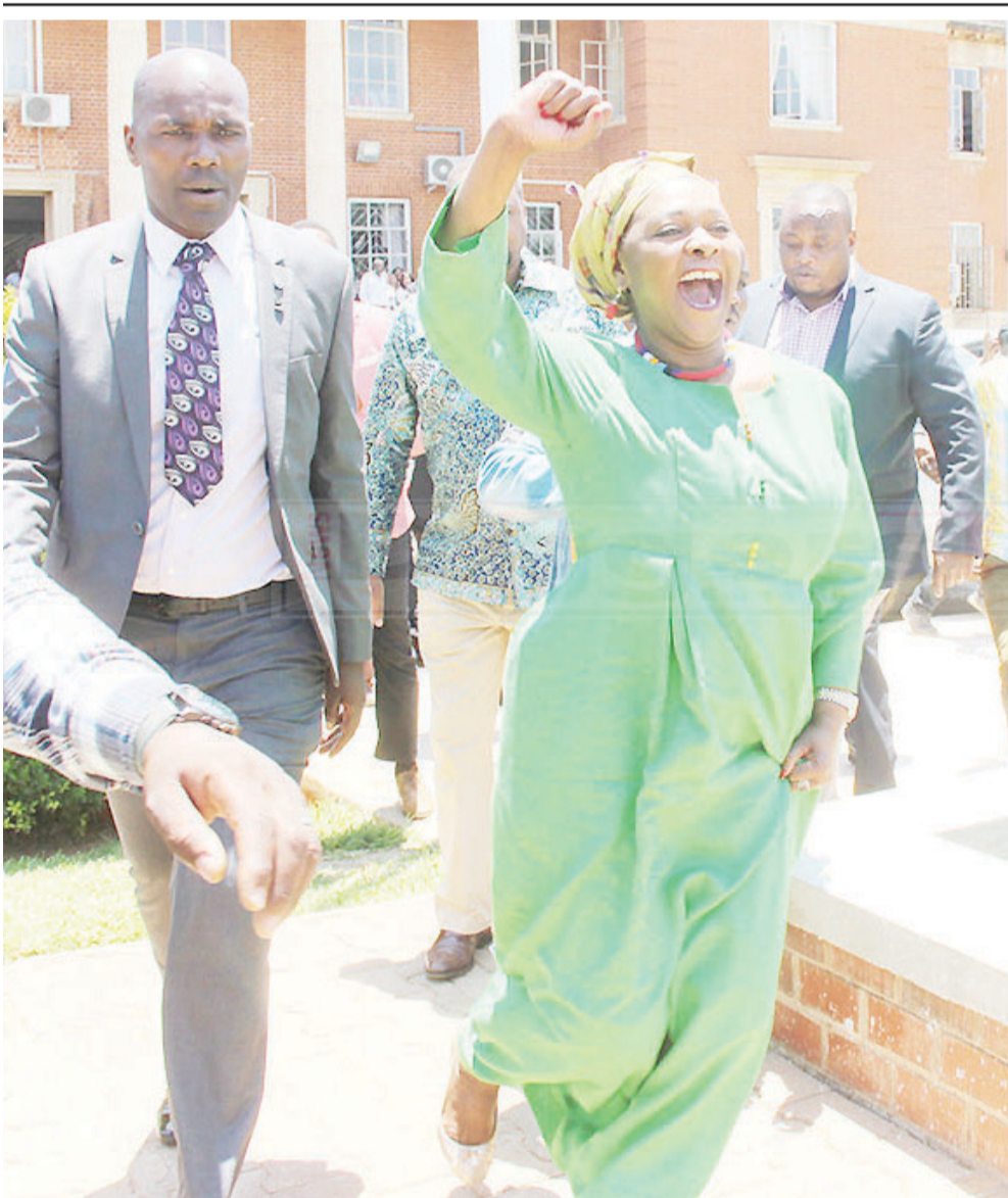
Finance Minister Mwanakatwe bursts into celebration after the ConCourt overturned the High Court's decision and declared her duly elected Lusaka Central MP - Picture by Tenson Mkhala. See story 4

...both want to lead Luapula United, replace Lungu - GBM