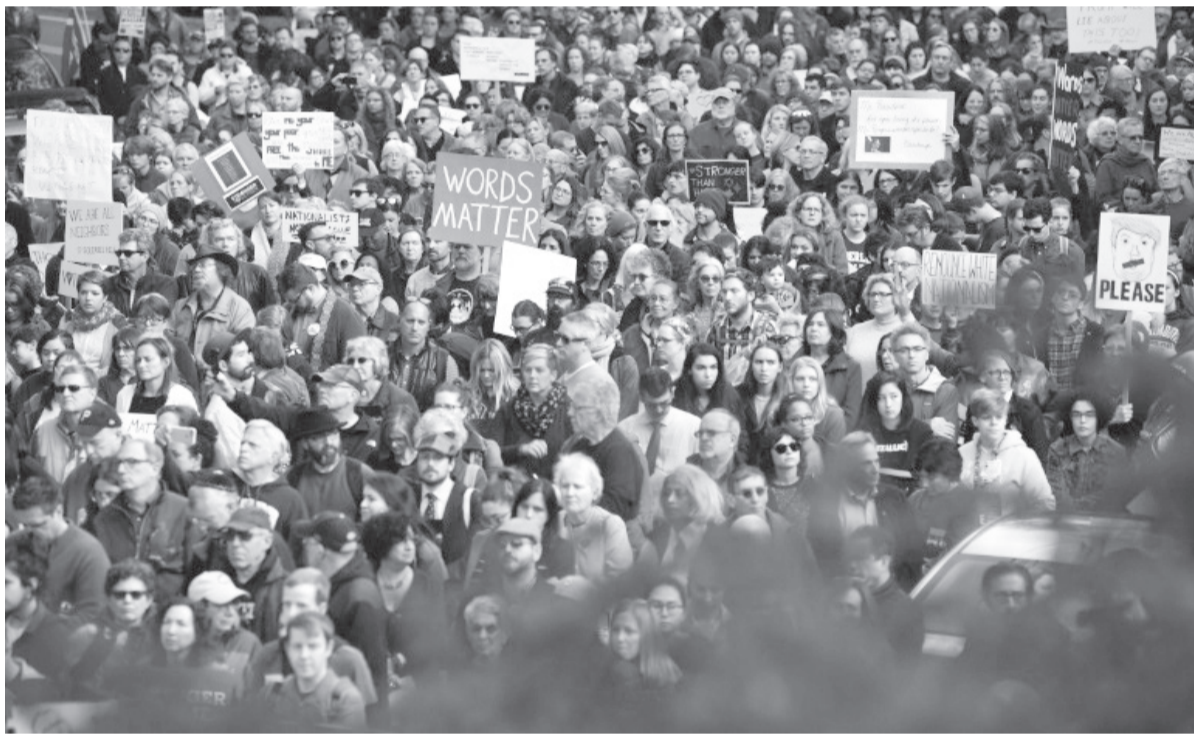
Protesters denounced US President Donald Trump's visit to the Tree of Life synagogue in Pittsburgh, where 11 people were shot dead during Shabbat services

"Any company that is serious about cannabis should start moving its supply chain to Thailand." AFP