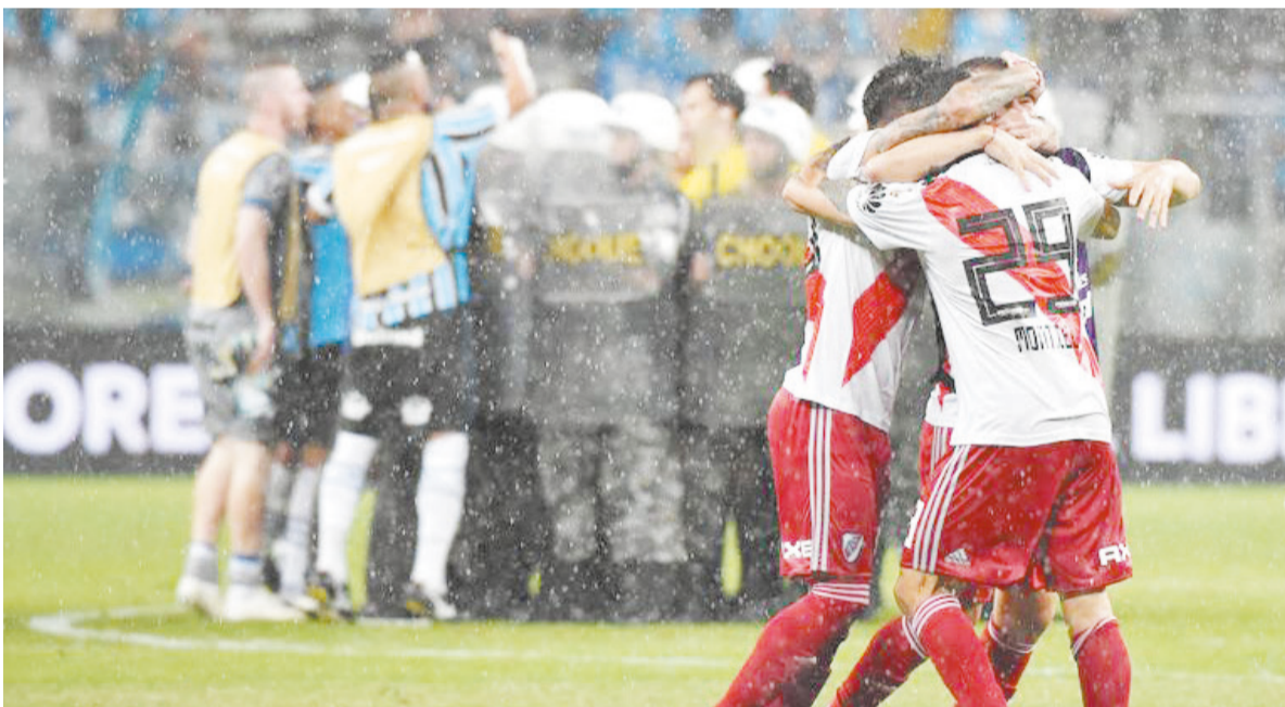
River Plate celebrate reaching the Copa Libertadores final as riot police shield the referee from Gremio's.