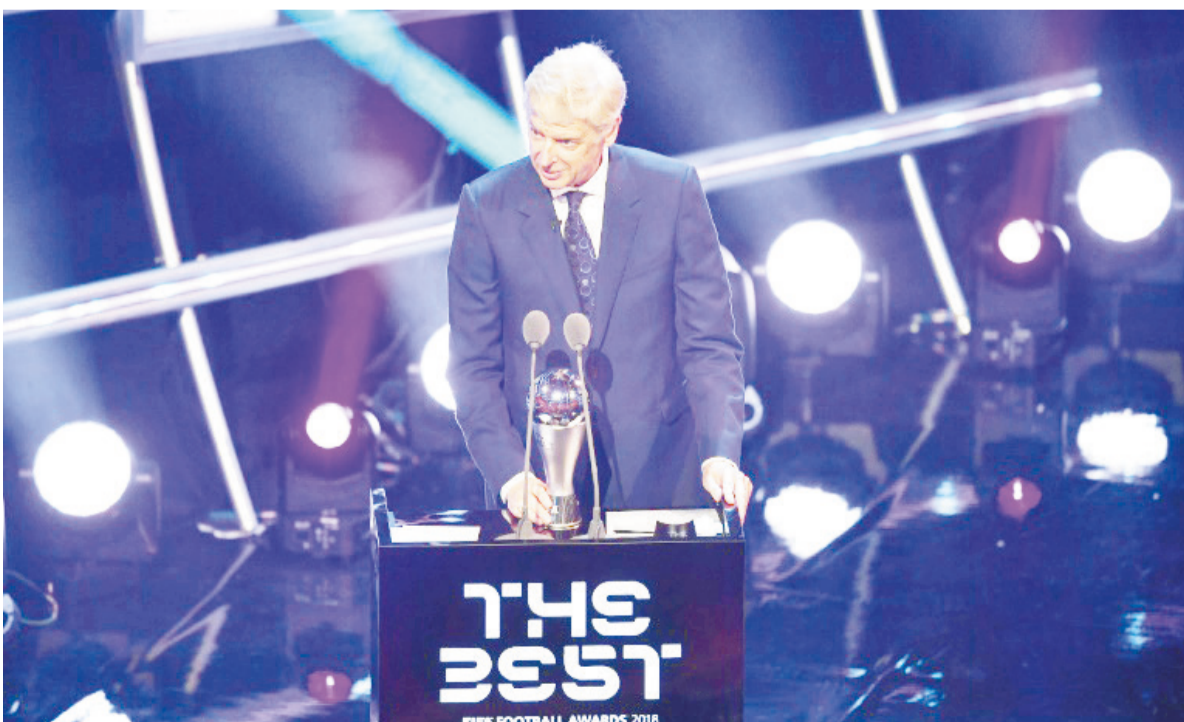
Former Arsenal boss Arsene Wenger, seen here presenting the trophy for the 2018 Best FIFA Men's Coach award, wants to return to football management.

Winning title will be harder than last year, says Silva