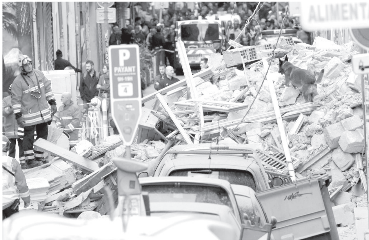
Firefighters take the help of a sniffer dog to locate possible trapped people in the debris