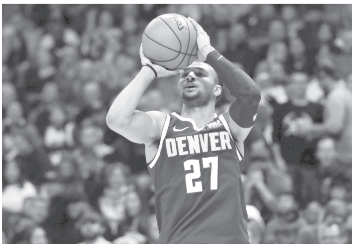
Jamal Murray puts up 48 points as the Denver Nuggets defeat the Boston Celtics to keep pace with Golden State in the NBA's Western Conference.

"It's always a pleasure to meet him again, to see that he is motivated despite his age, I have great respect for the professional and great affection for my friend," Ancelotti said earlier.