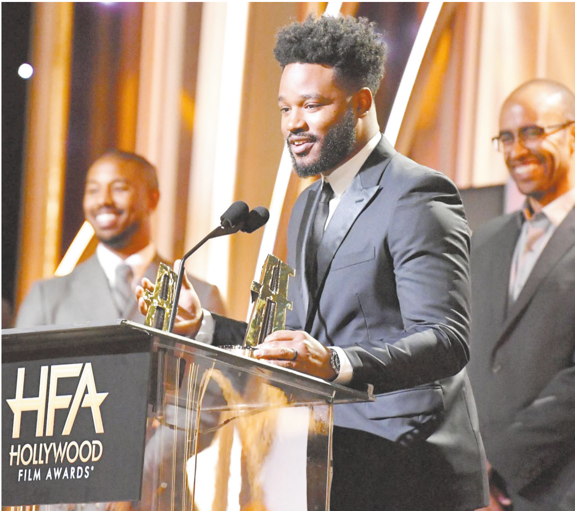
Ryan Coogler accepts the Hollywood Film Award for 'Black Panther' onstage during the 22nd Annual Hollywood Film Awards at The Beverly Hilton Hotel on November 4, 2018 in Beverly Hills, California.