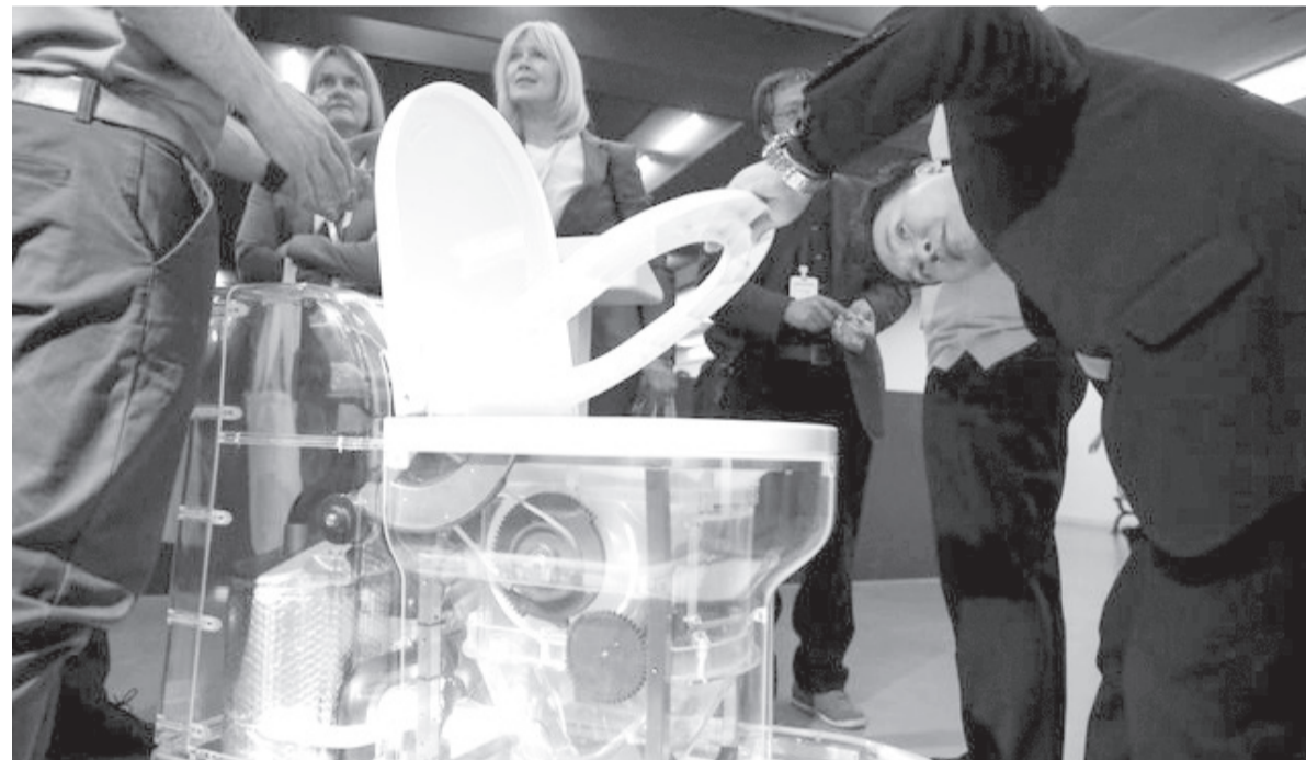
A man looks at a toilet design by Cranfield University at the Reinvented Toilet Expo showcasing sewerless sanitation technology in Beijing, China November 6, 2018.

"In the way that a personal computer is sort of self contained, not a gigantic thing, we can do this chemical processing at the household level," he said. REUTERS