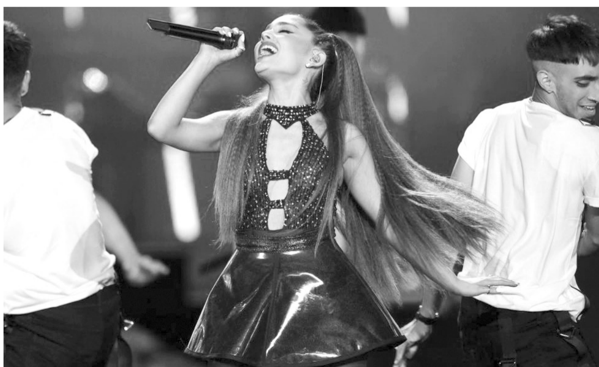
Billboard named the 25-year-old award-winning singer its 2018 Woman of the Year. Grande will receive the award at Billboard's 13th annual Women in Music event on Dec. 6 in New York.

"[Tom and Rita] are helping to solve some of today's greatest riddles, like 'Where is the commonality and conversation, where's that gone? How do we connect when we don't understand each other?'" Spielberg said. "[Tom] has elevated friendliness to a kind of superpower, with all his performances, he's built a dossier, a defense brief for the human spirit." MSN