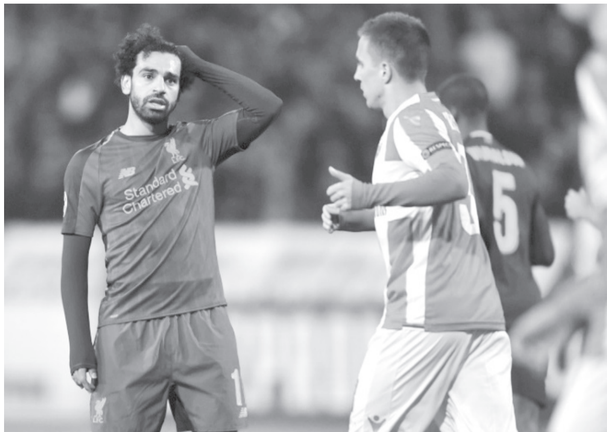
Head-scratcher: Mohamed Salah (left) failed to fire as Liverpool suffered a shock 2-0 defeat to Red Star Belgrade.

"Everyone should get right behind it and give him a great send-off." Rooney is not expected to captain England or wear the No 10 shirt against the US. Instead, the former Manchester United frontman is just expected to make a brief cameo as a substitute at the home of football.