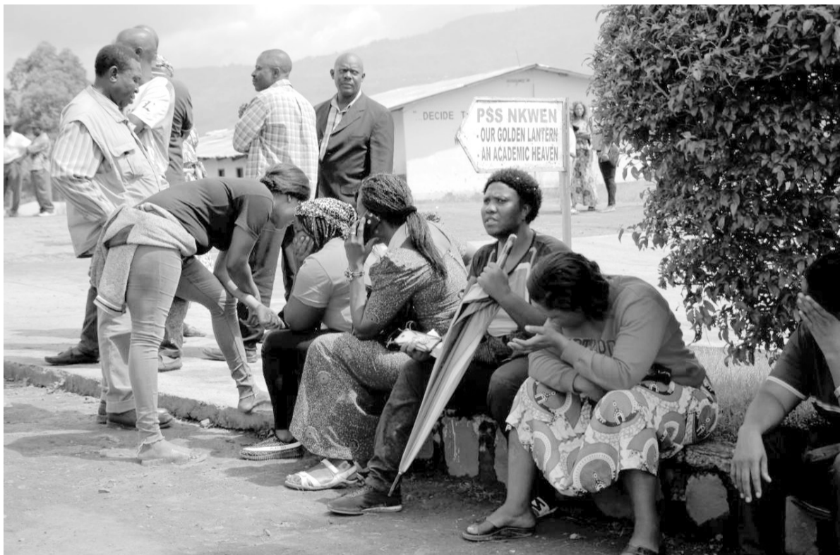
Parents await for news of their children at a school where 79 pupils were kidnapped in Bamenda, Cameroon November 6, 2018.

On the world stage, Ankara is feeling emboldened and seeks to score diplomatic points as Saudi Arabia, a rival regional heavyweight, grapples with global outrage over the murder at the Saudi consulate in Istanbul of journalist Jamal Khashoggi.