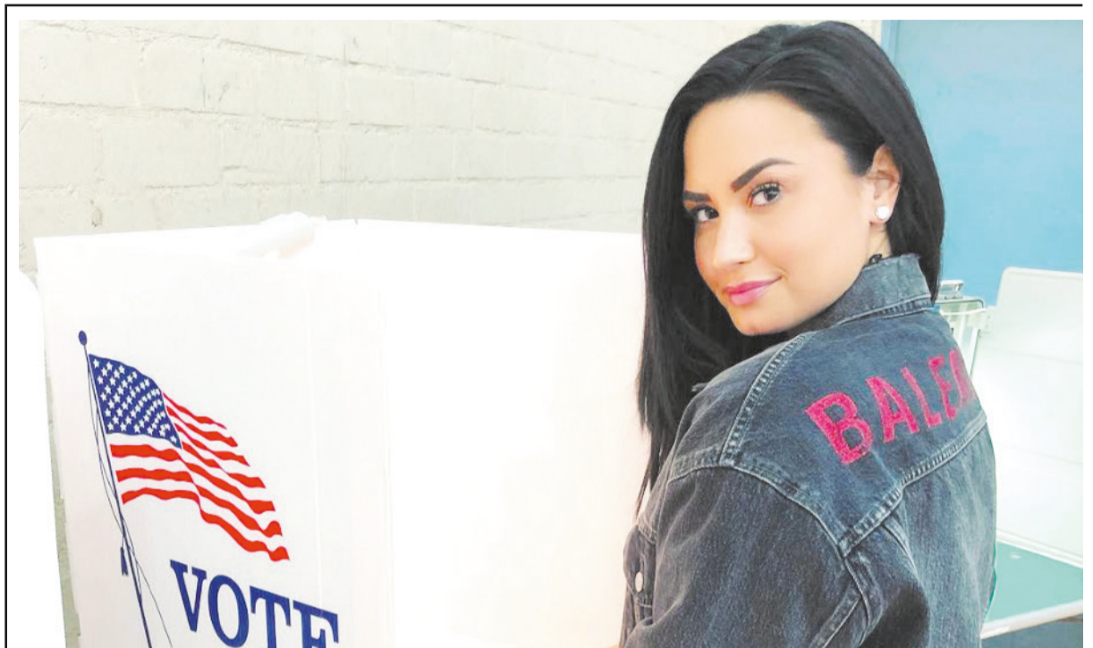
Demi Lovato is back on Instagram. In her first social media photo since leaving rehab, she urged people to vote in the midterm elections — and shared her own snapshot from the polls.

early voting compared with four years ago. YAHOO