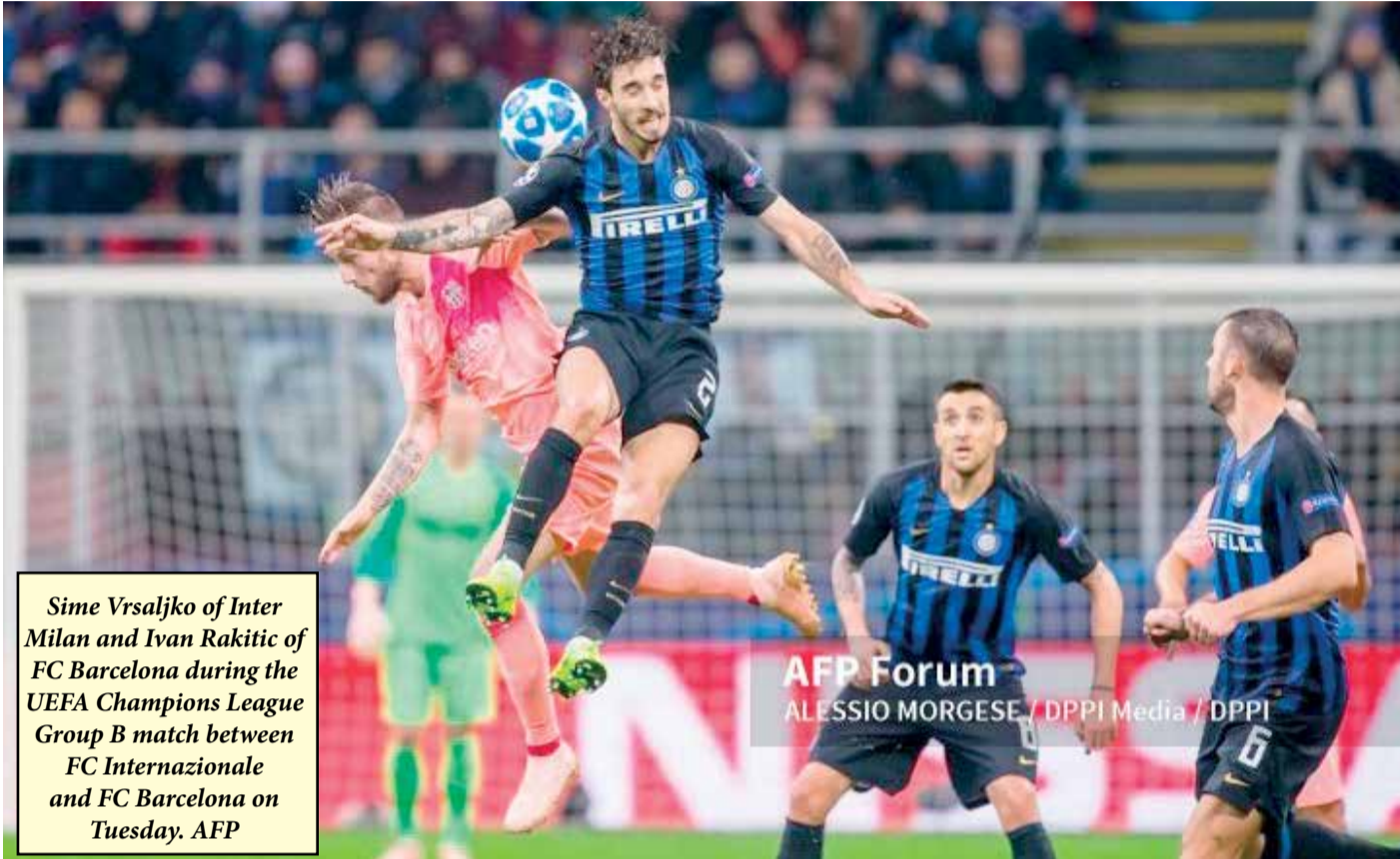
Sime Vrsaljko of Inter Milan and Ivan Rakitic of FC Barcelona during the UEFA Champions League Group B match between FC Internazionale and FC Barcelona on Tuesday.