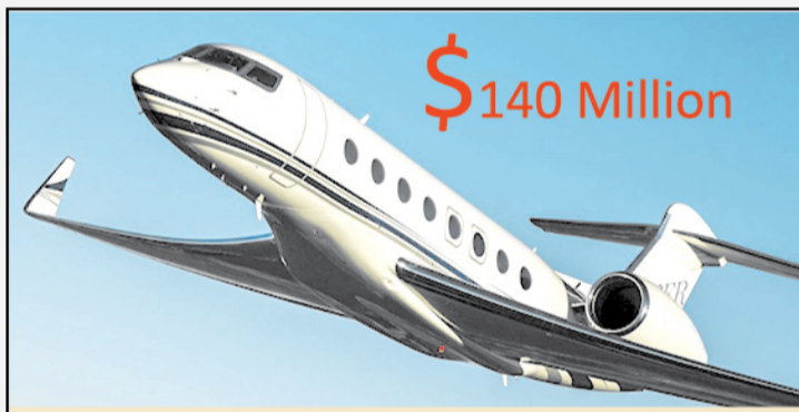
Why does Zambia need a Presidential Jet costing K1.4 Billion during austerity measures