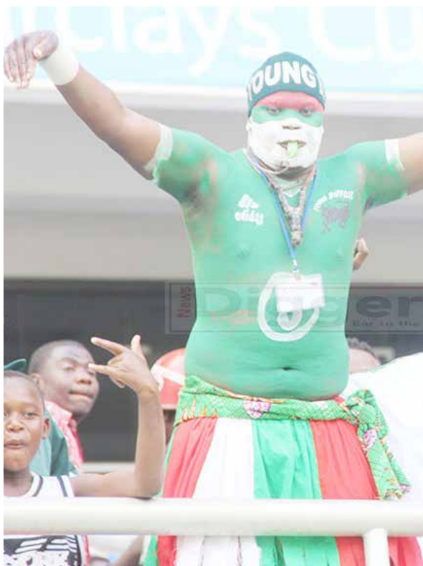
A Young Buffaloes fan during the Barclays Cup final against Nkana.