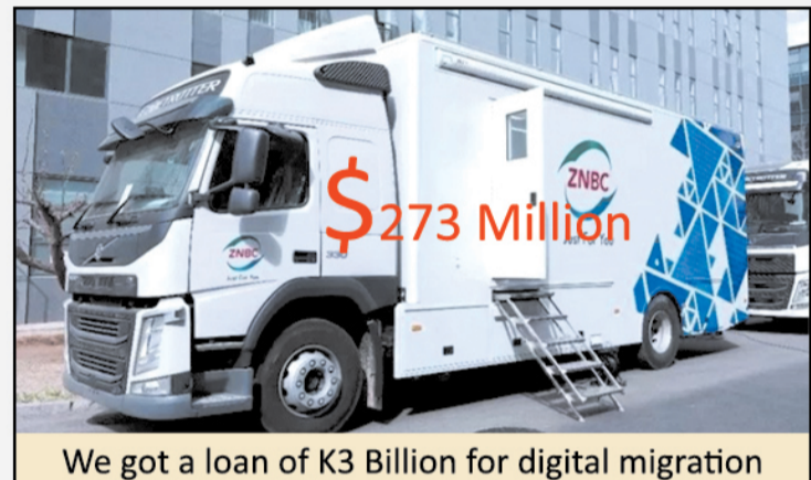
We got a loan of K3 Billion for digital migration when competing bidders were only asking for about K440 Million. Why?