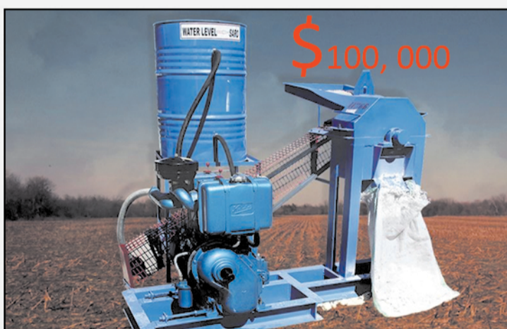
Why did we spend money on solar mills meant to lower mealie meal prices when the prices are just going up?

"where does the rest of the money go? How would that money improve schools, hospitals, bursaries create jobs ? Alliance for community action ▶▶