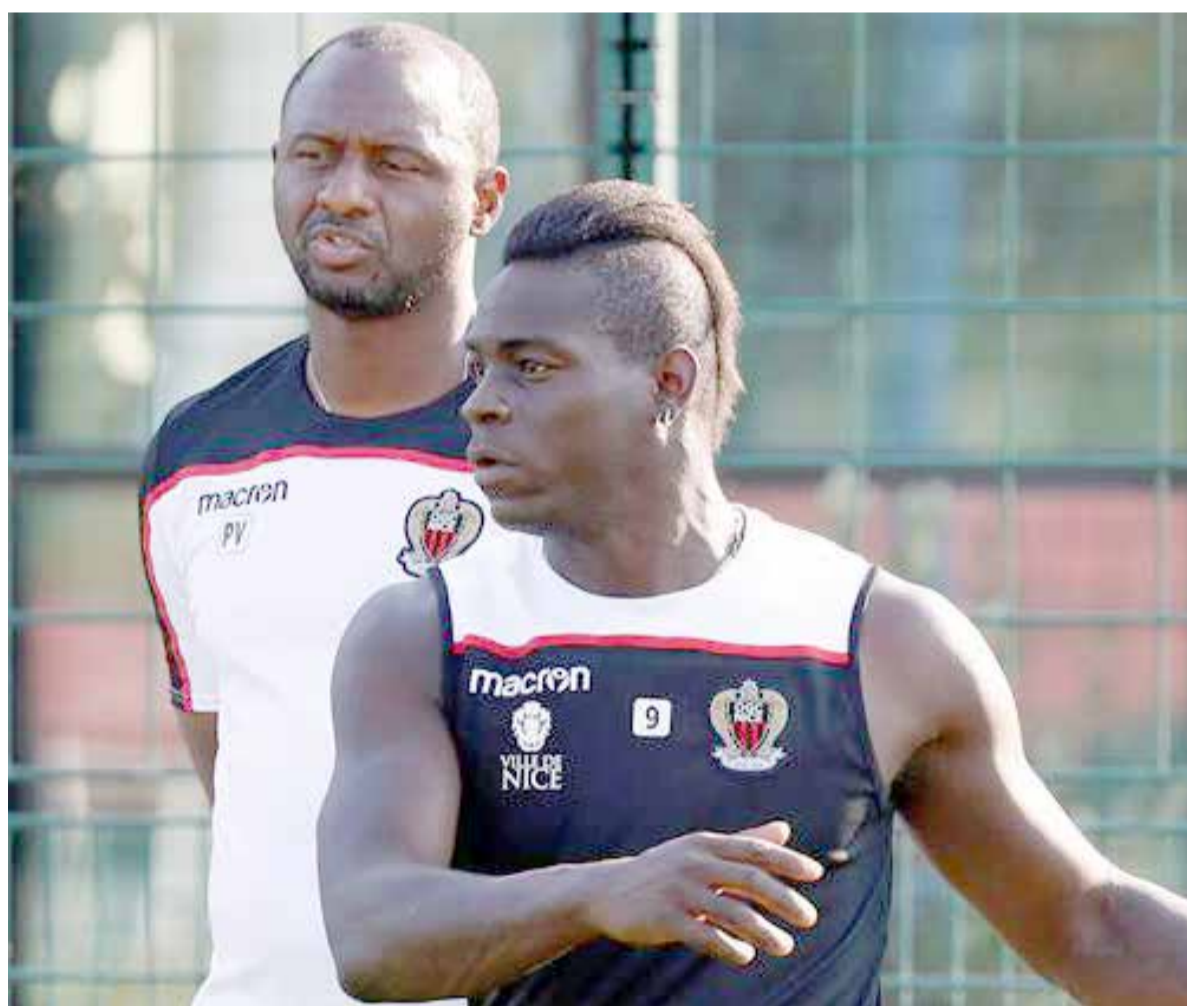
Nice coach Patrick Vieira (l) and striker Mario Balotelli during training

"It's been a tough and complicated match for Nice, we've suffered a lot, it's been less than an average match," he told reporters. "We take the three points, but we come