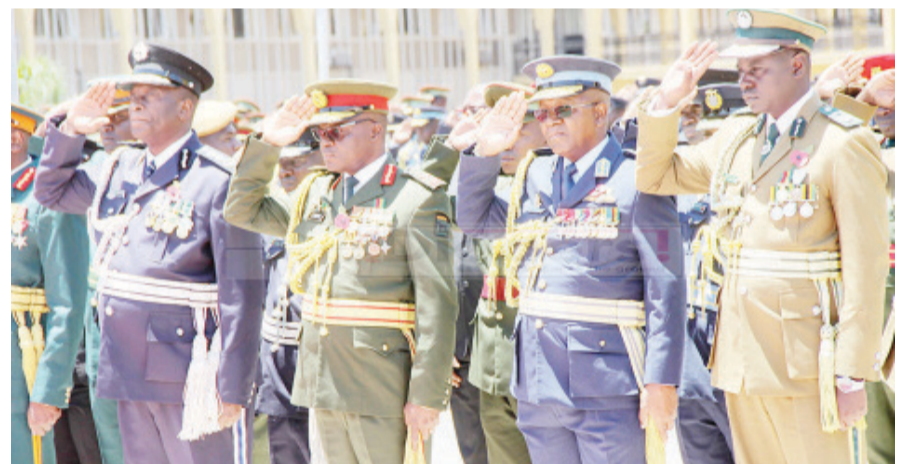
President Lungu (bottom) joins war veterans (right) in laying wreaths at the Cenotaph on Remembrance Day as Service Chiefs salute