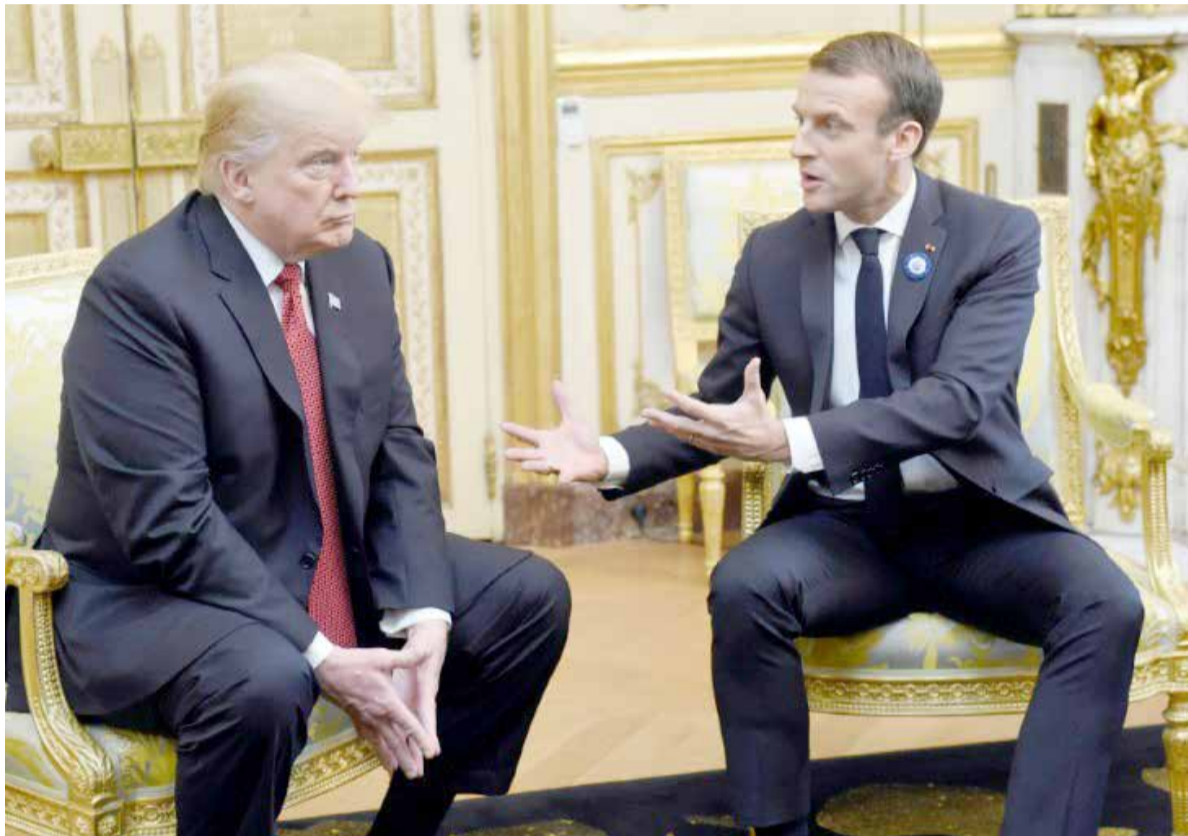
The body language of the US and French presidents was markedly less warm than during Trump's last visit to Paris in July 2017, underscoring a general cooling in relations which were further strained by a late-night tweet by Trump attacking Macron. AFP

Last week, the World Health Organization's director general, Tedros Adhanom Ghebreyesus, said the lack of security was posing the greatest challenge in countering the current epidemic. BBC