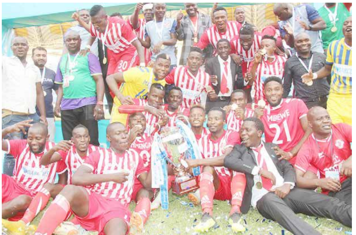
Nkana players and staff celebrate winning the 2018 Barclays Cup tournament after beating Young Buffaloes team 3-0 at Heroes Stadium in Lusaka on Saturday