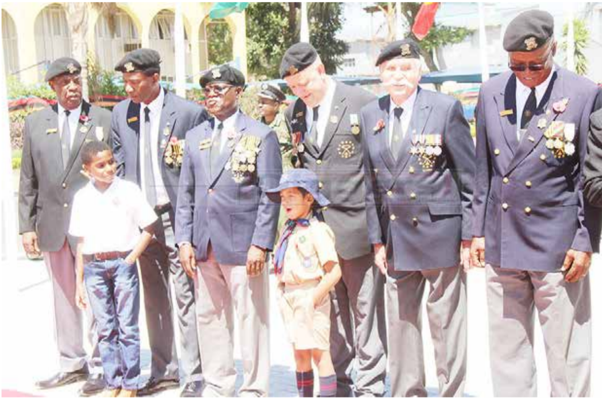
Former defense and security generals at the Cenotaph in Lusaka during the remembrance of the men and women who died in the First and Second World Wars on November 11, 2018

One of the 12 tenets included 'openness and transparency' where ACCA-Zambia recommended that tax payers should understand what they are paying; why they are paying it and what the benefits of paying will be as a means of boosting compliance.