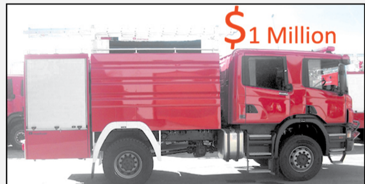
Fire Tenders which we could get at K3.3 Million each gobbled K11 Million. Why?