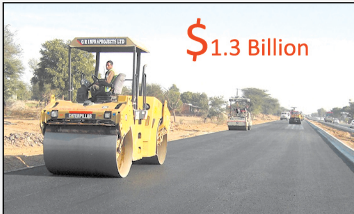
Lusaka Ndola Road which experts say should cost about K4.4 Billion is costing us around K13.2 Billion