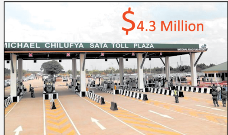
Spending K47.3 Million on building a toll plaza, against the actual value of about K5.5 Million. Why?