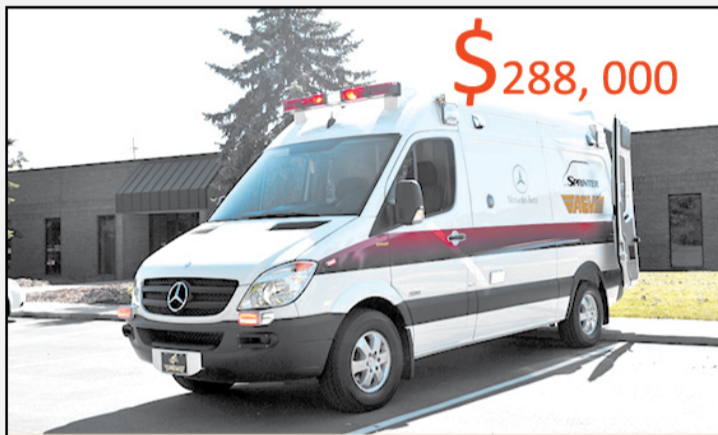
Why spend K2.5 Million on ambulances which manufacturers say they are worth K1.1 Million?