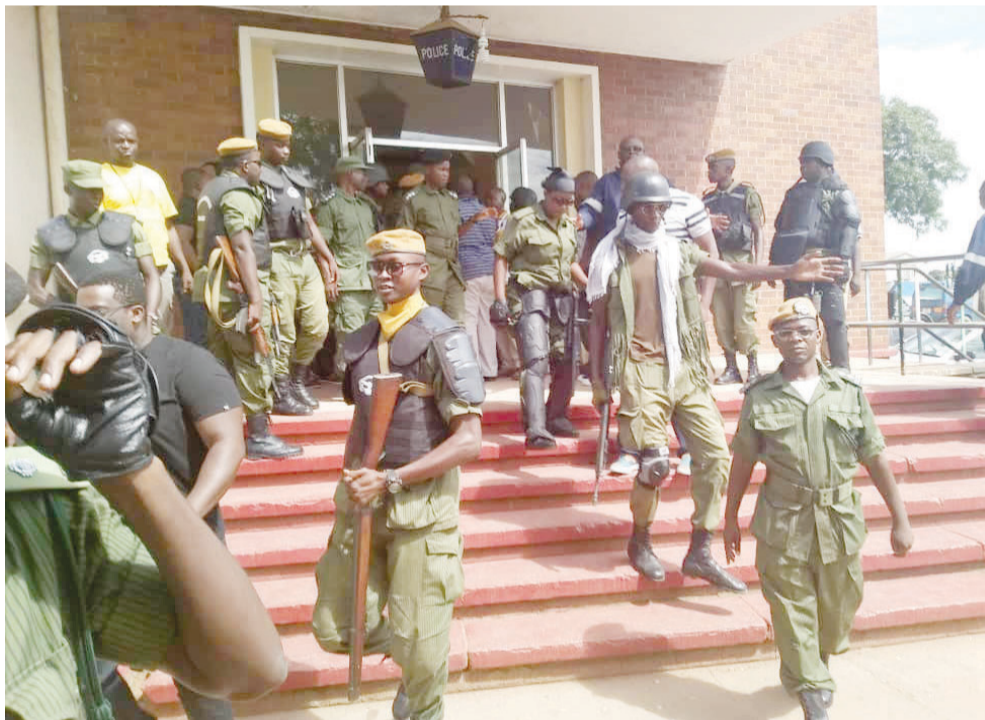
Officers keep vigil at Luanshya Police as they await NDC leader Chishimba Kambwili (right) to arrive for interrogations yesterday.