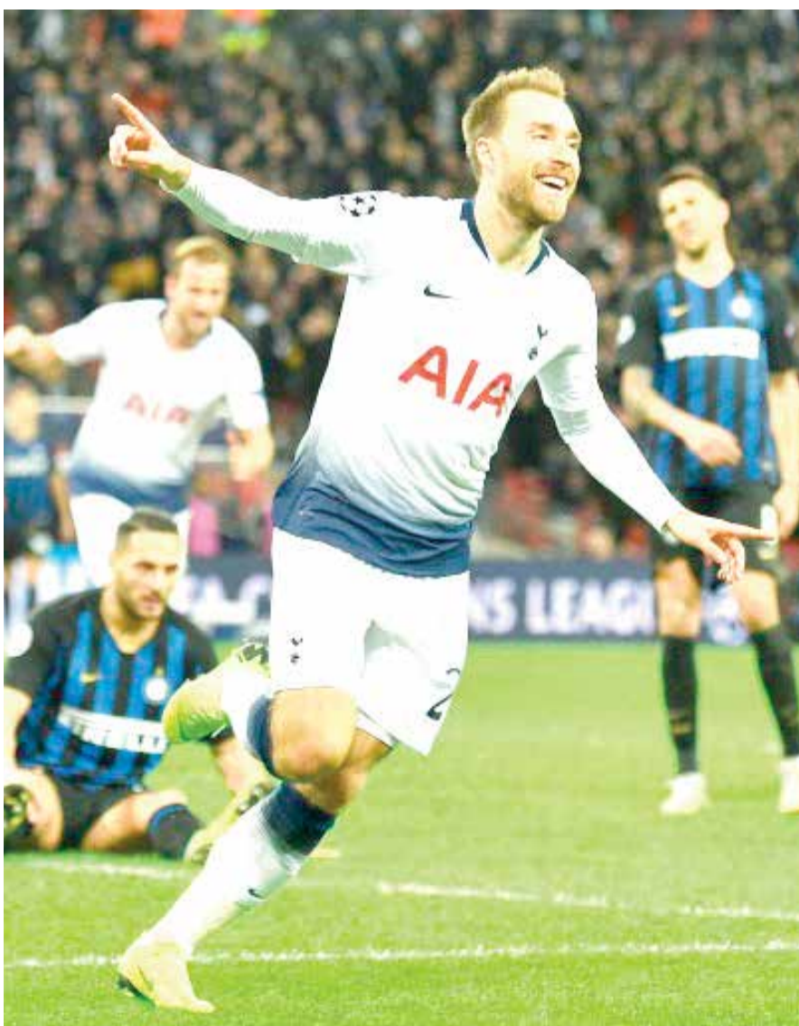
Christian Eriksen celebrates Tottenham's vital winner against Inter Milan

Carlsen was gracious after his thumping win put an exclamation point on a defensively-minded series that saw the original series of 12 matches played since November 9 end in a dozen draws. AFP