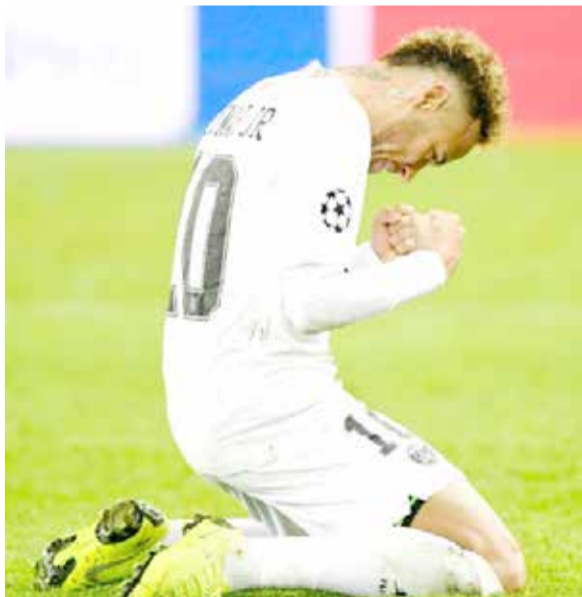
Neymar scored the decisive goal for PSG in his side's 2-1 win over Liverpool