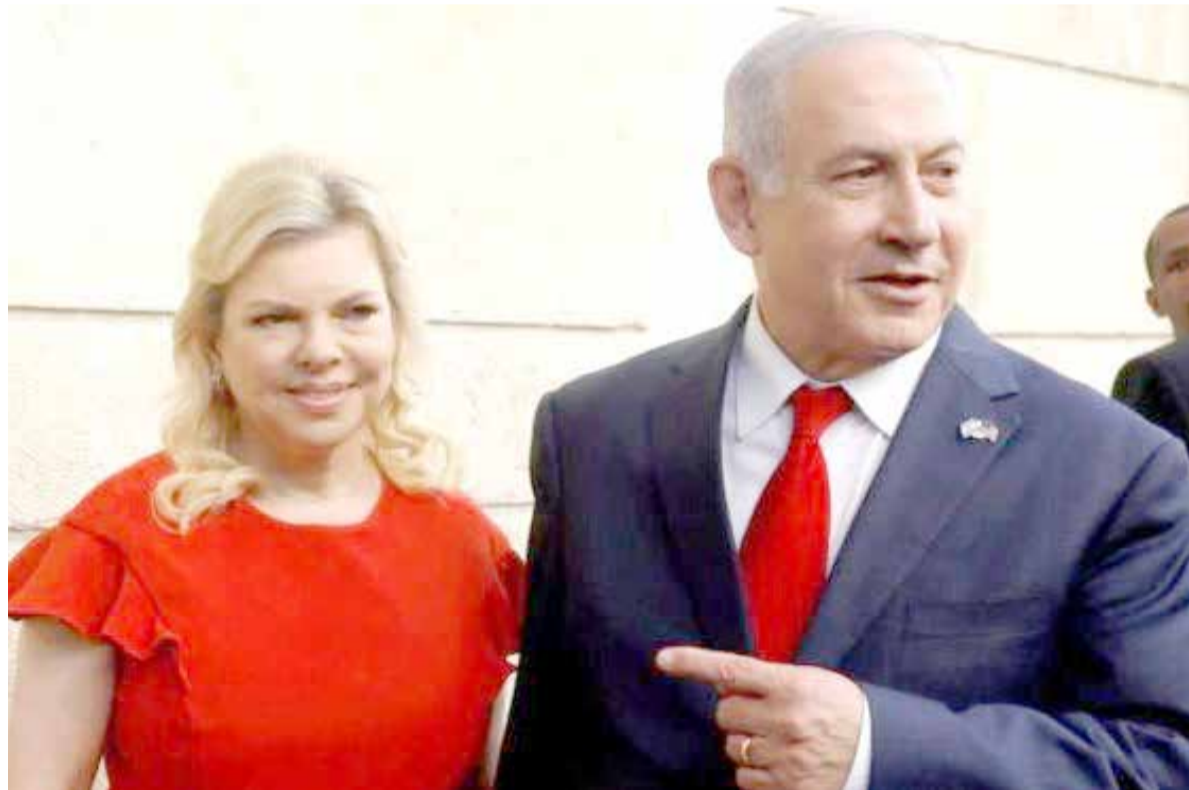
Benjamin Netanyahu (right) and his wife Sara are suspected of awarding regulatory favours to a telecom firm

Israeli police have recommended indicting Prime Minister Benjamin Netanyahu and his wife Sara for alleged fraud and bribery. They are suspected of awarding regulatory favours to the Bezeq telecom firm in return for positive media coverage of the couple.