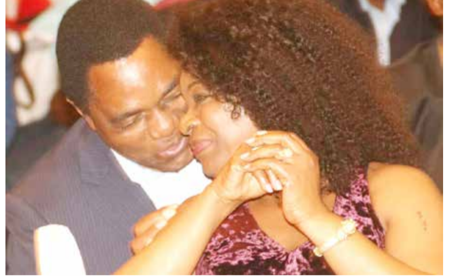
UPND president Hakainde Hichilema with wife Mutinta Hichilema

"After 20 years, UPND is Still Without a Manifesto; how then can they move "Zambia Forward" Political Parties are essentially organisations that seek political power so that their philosophy and policy become public policy. It is therefore unbelievably strange that after 20 years the UPND still have no