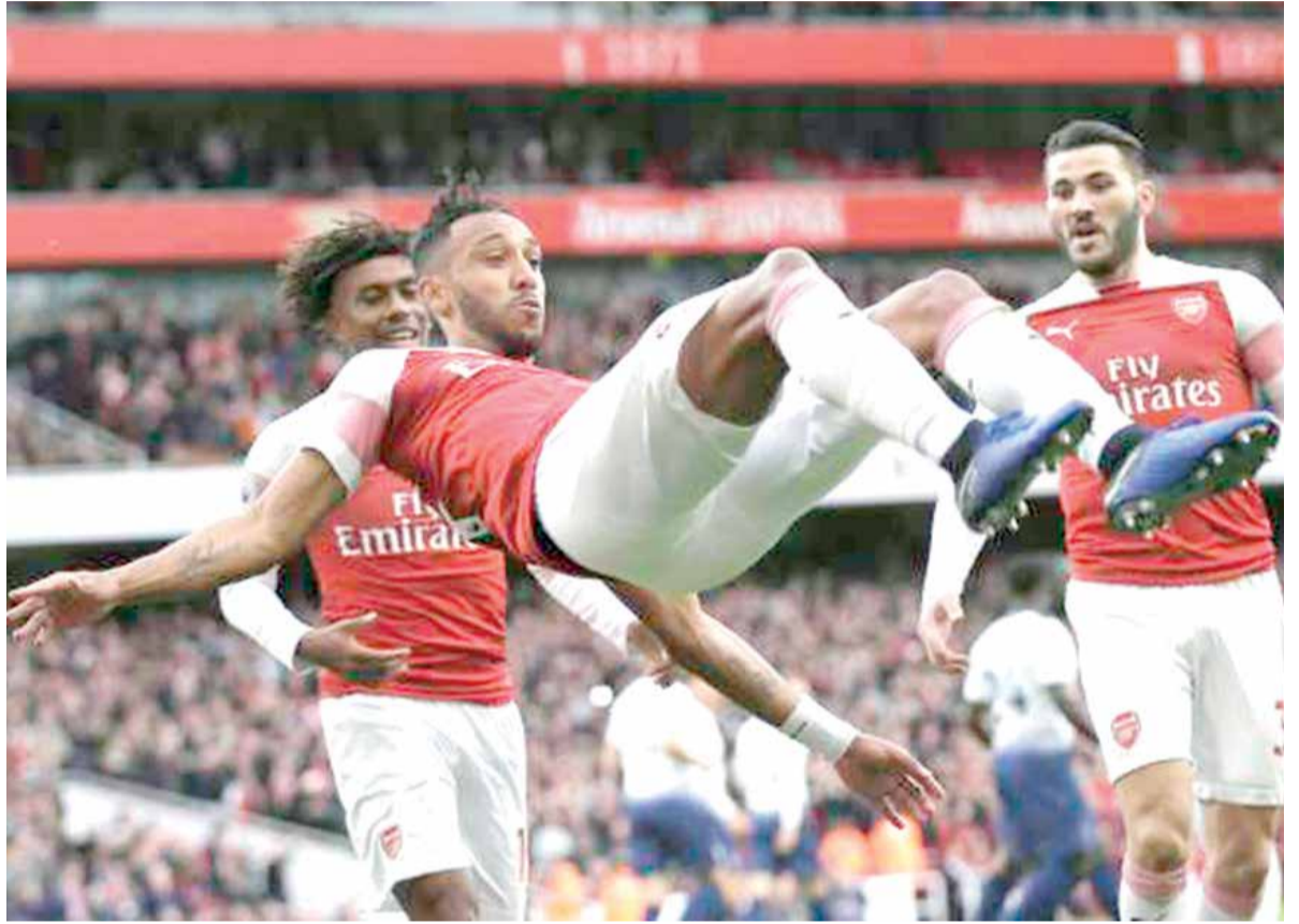
Arsenal overpower Spurs in north London derby. Story page 14

Robben moved to the Allianz Arena in August 2009 after finding himself out of favour at Real Madrid following the arrivals of Cristiano Ronaldo and Kaka. The Netherlands international has gone on to enjoy a near decade of trophy-laden dominance with Bayern, winning seven Bundesliga titles and four DFB-Pokals. Robben's crowning glory in a Bayern shirt came when he scored an 89th-minute winner to down domestic rivals Borussia Dortmund 2-1 in the 2012-13 Champions League final, a year after they lost a penalty shoot-out against Chelsea on home turf in the 2012 showpiece. Goal.com