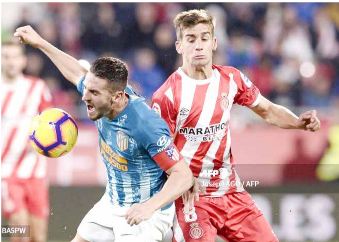
Atletico Madrid's Spanish midfielder Koke challenges Girona's Spanish midfielder Pere Pons (R) during the Spanish league football match between Girona and Club Atletico de Madrid at the Montilivi stadium in Girona Yesterday.

The Zambia national team dropped five places on the FIFA/Coca-Cola world rankings to rank 82nd in the world thereby recording its worst ranking for the year 2018. Statistics released by FIFA on Wednesday indicated that Zambia is 17th Africa and 82nd in the world. Meanwhile, Mozambique who beat Zambia in both AfCON qualifier encounters benefitted from their win and notably ascended on FIFA ranking and moved five places up the table.