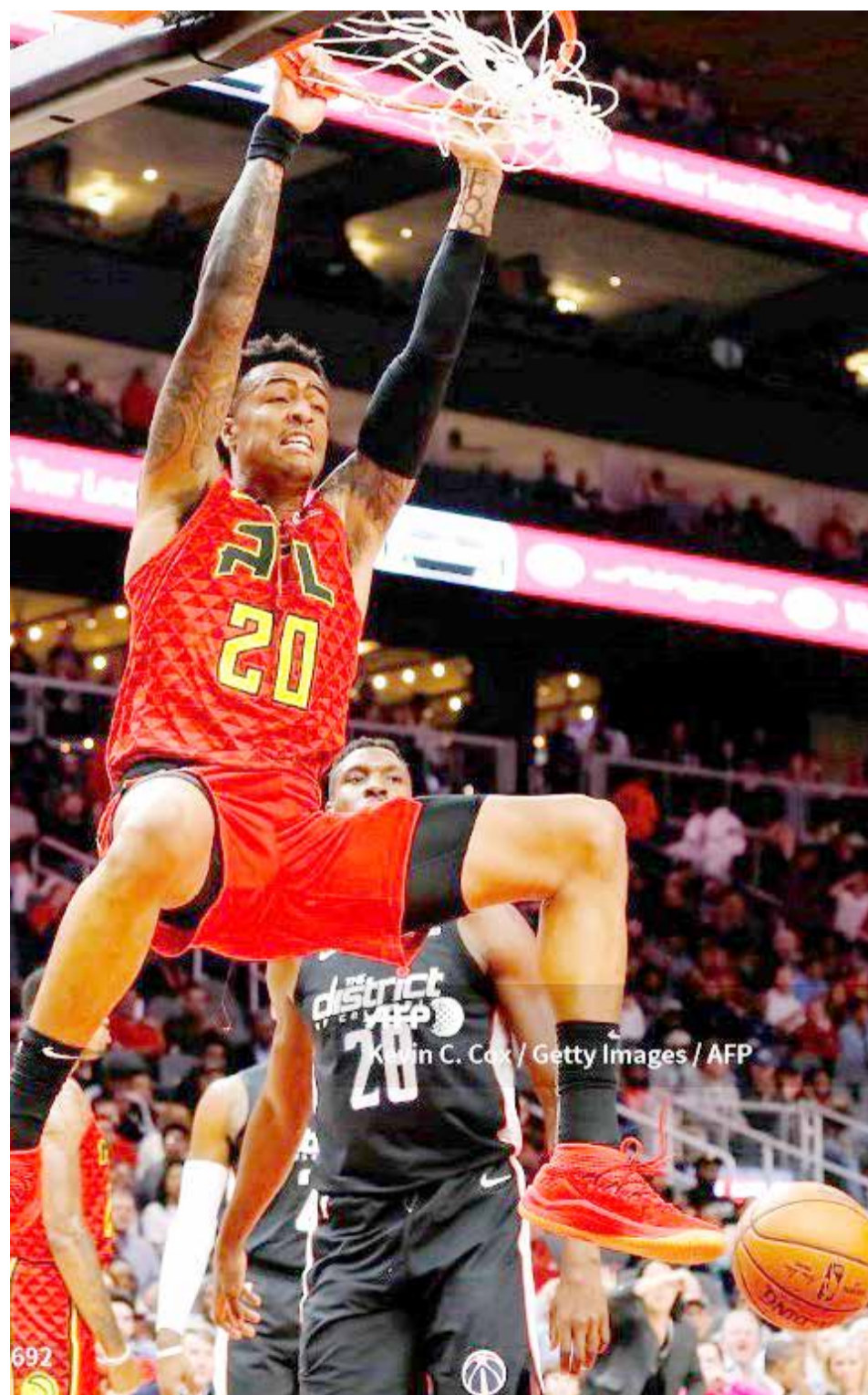
John Collins #20 of the Atlanta Hawks dunks against Ian Mahinmi #28 of the Washington Wizards at State Farm Arena on Wednesday in Atlanta, Georgia