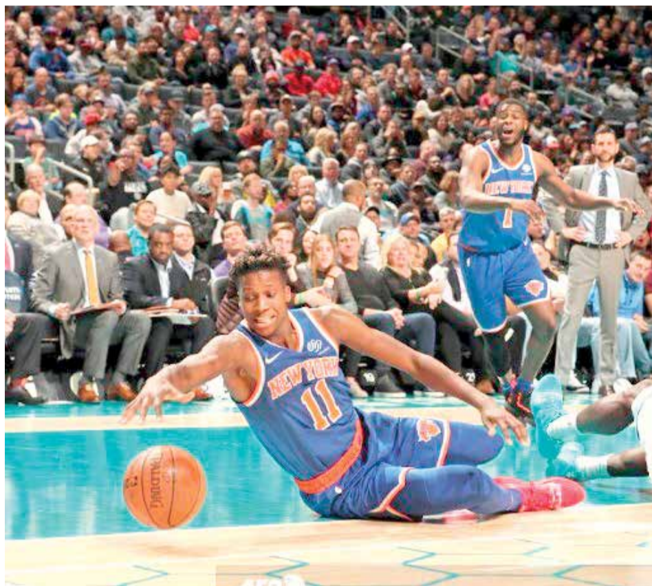
Frank Ntilikina #11 of the New York Knicks tries to save a ball from going out of bounds during the game against the Charlotte Hornets on December 14, 2018 at Spectrum Center in Charlotte, North Carolina.