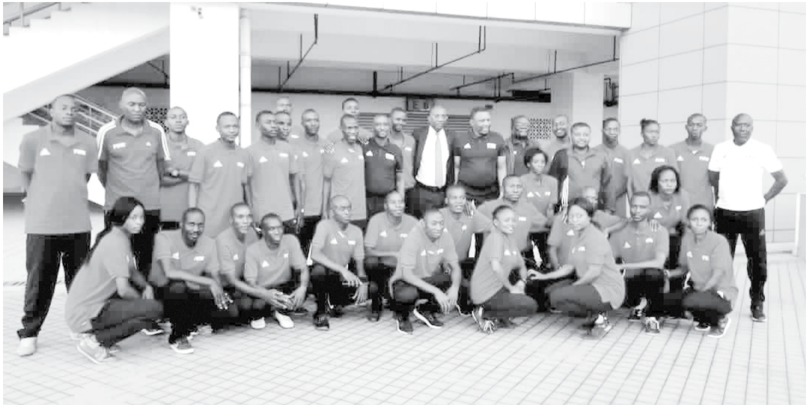
Trainee referees pose for a photo at the National Heroes Stadium where the five day training programme is taking place

"If you do not invest in the pillars of refereeing as well as coaching and the players, then there will be no football. I think this [is] why you tend to see that