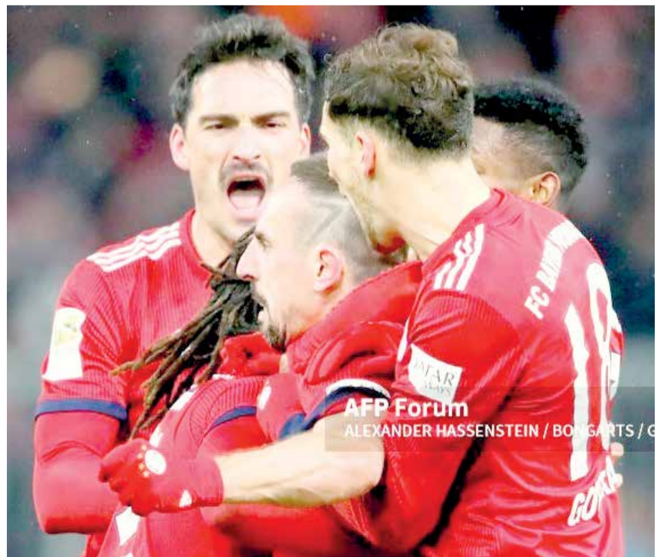
Franck Ribery of Bayern Muenchen celebrates scoring the opening goal with his team mates during the Bundesliga match between FC Bayern Muenchen and RB Leipzig at Allianz Arena on Wednesday