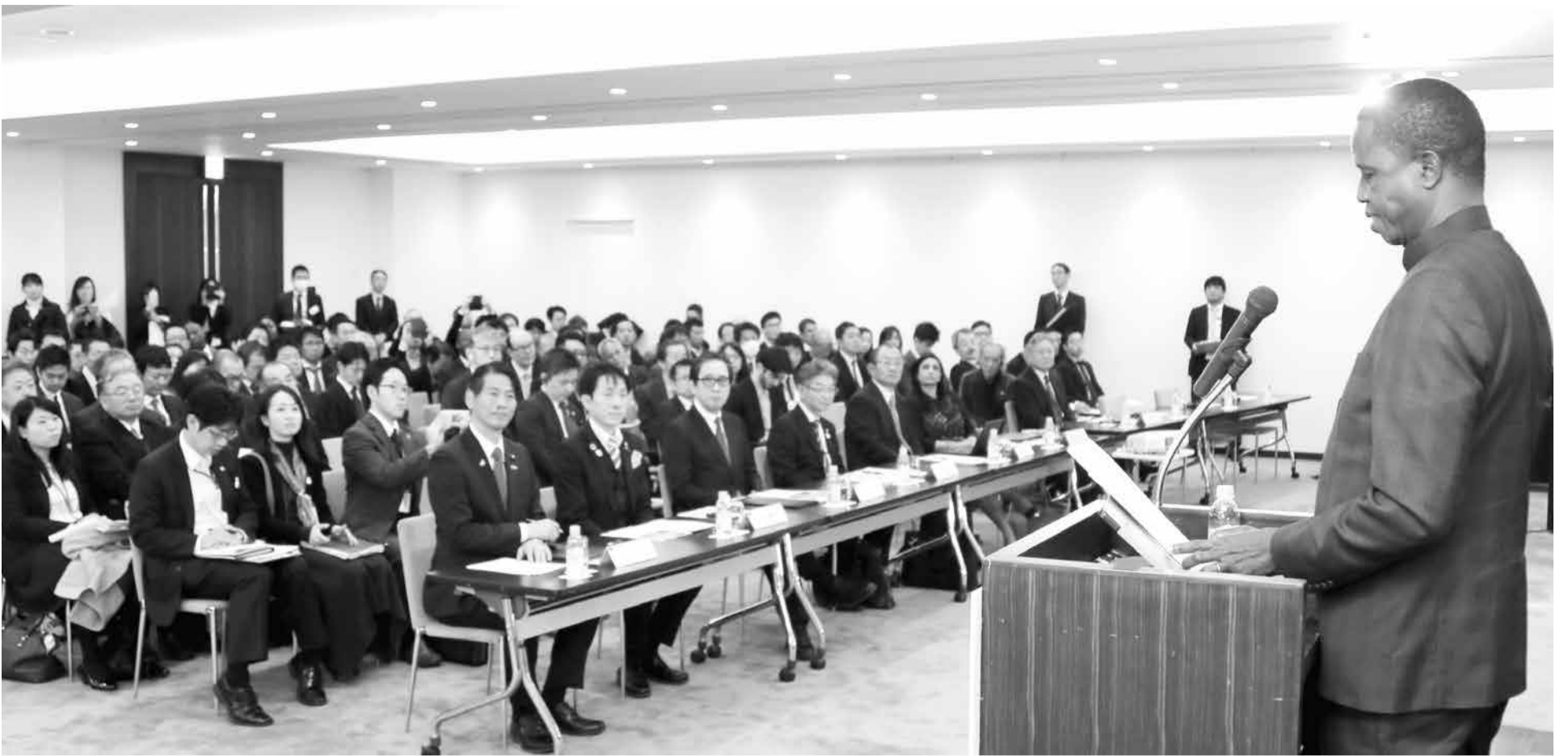
President Edgar Chagwa Lungu (right) addresses businessmen during the Zambia Japan Business Forum in Tokyo, Japan on Thursday