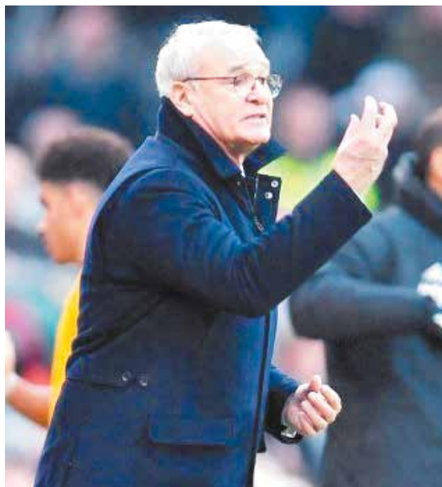
Claudio Ranieri, Manager of Fulham gives his team instructions during the Premier League match between Fulham FC and Wolverhampton Wanderers