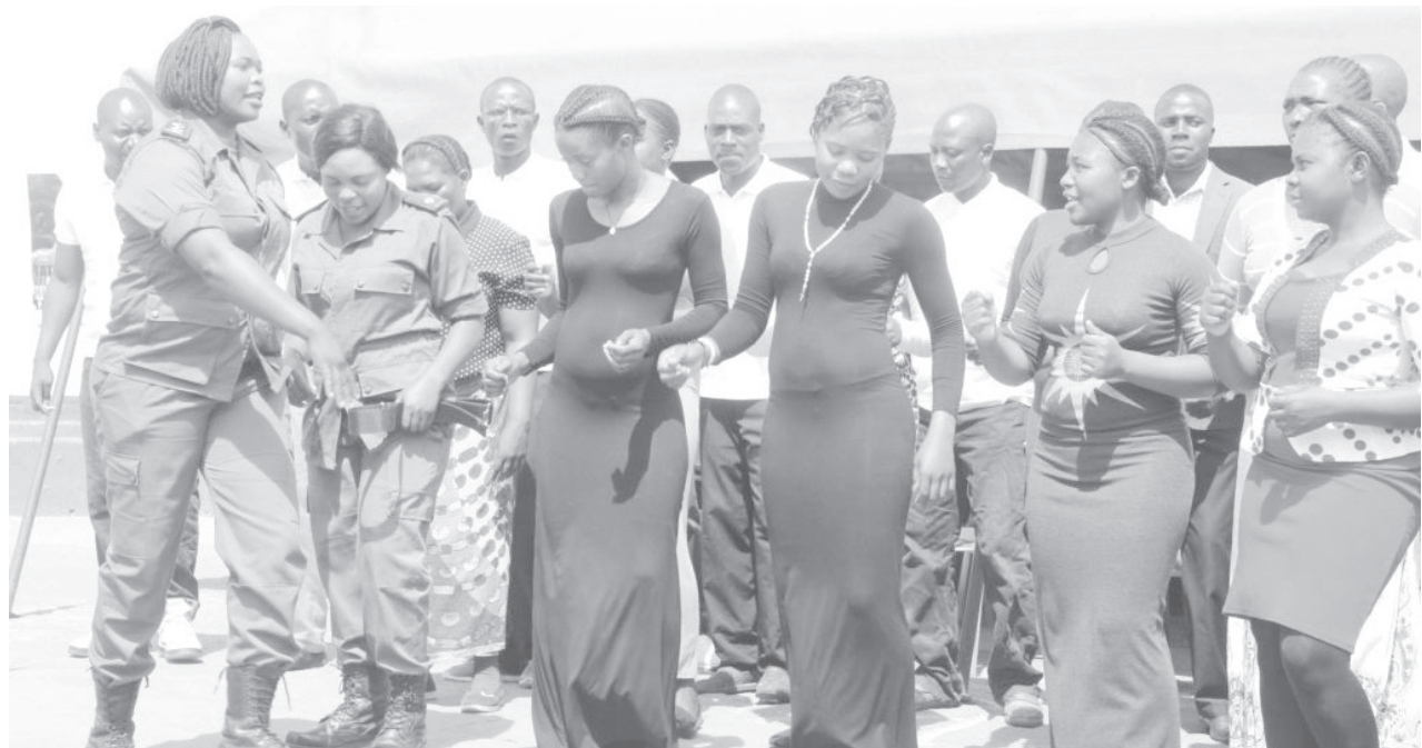
Lusaka central Correctional Facility inmates and prison wardens sing during the Service Chiefs special Christmas visit on December 25, 2018