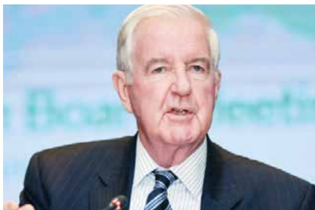
WADA president Craig Reedie

Russian athletes to return to competition across all sports after a report which uncovered a state-sponsored doping programme in Russia. WADA's confirmation of the missed deadline came as US Anti-Doping Agency chief Travis Tygart described Russia's return to the sports fold "a total joke and an embarrassment". However, in his New Year message, International Olympic Committee president Thomas Bach insisted Russia had been sufficiently punished. "With its suspension from the Olympic Winter Games PyeongChang 2018, the Russian Olympic Committee has served its sanction," wrote Bach. WADA personnel travelled to Russia in December but were unable to extract all of the promised data.