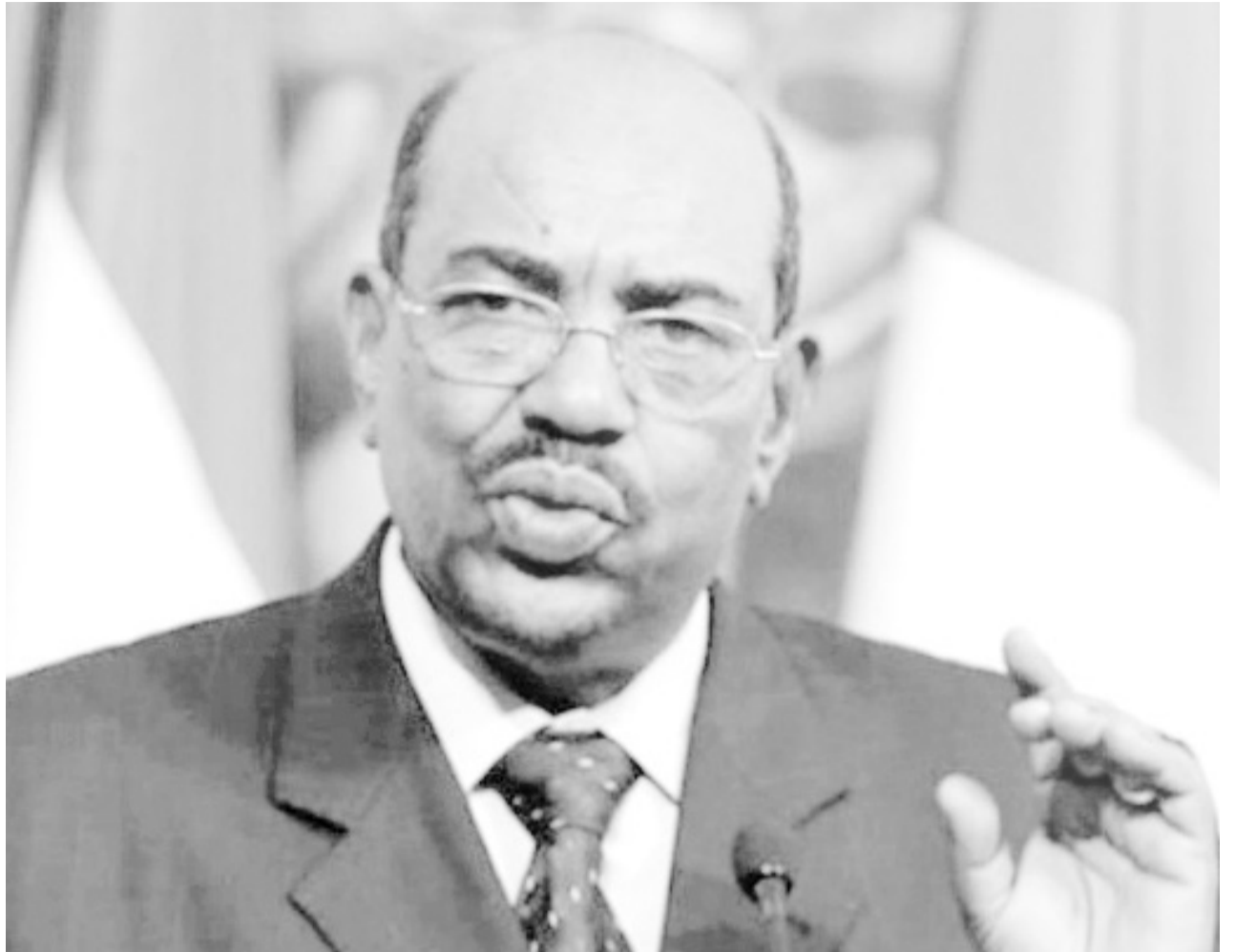
Sudanese President Omar-al-Bashir