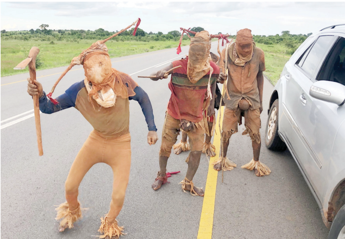
Nyau dancers celebrate after collecting 'New Year tax' from motorists along the Great East Road in Katete District on Tuesday