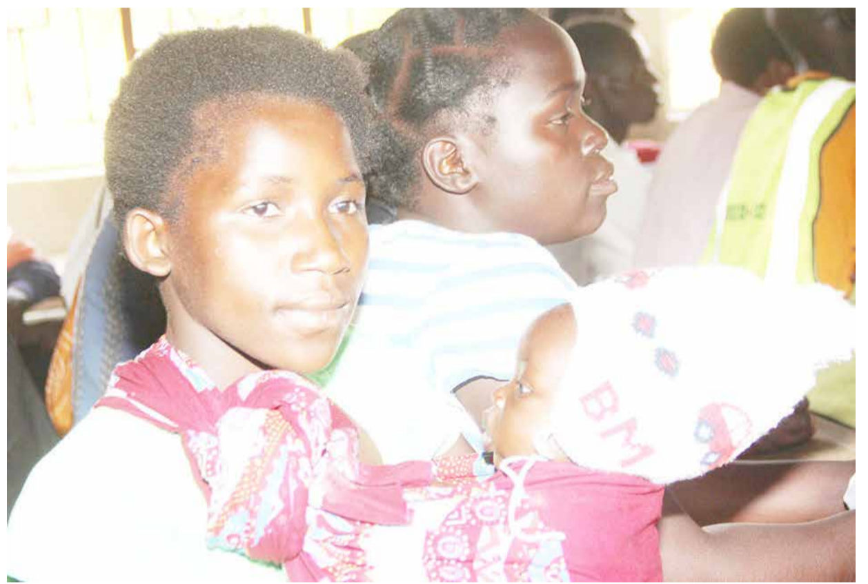
A 15-year-old grade Seven drop out of Kasempa district in North Western Province breast feeding her six-month-old baby