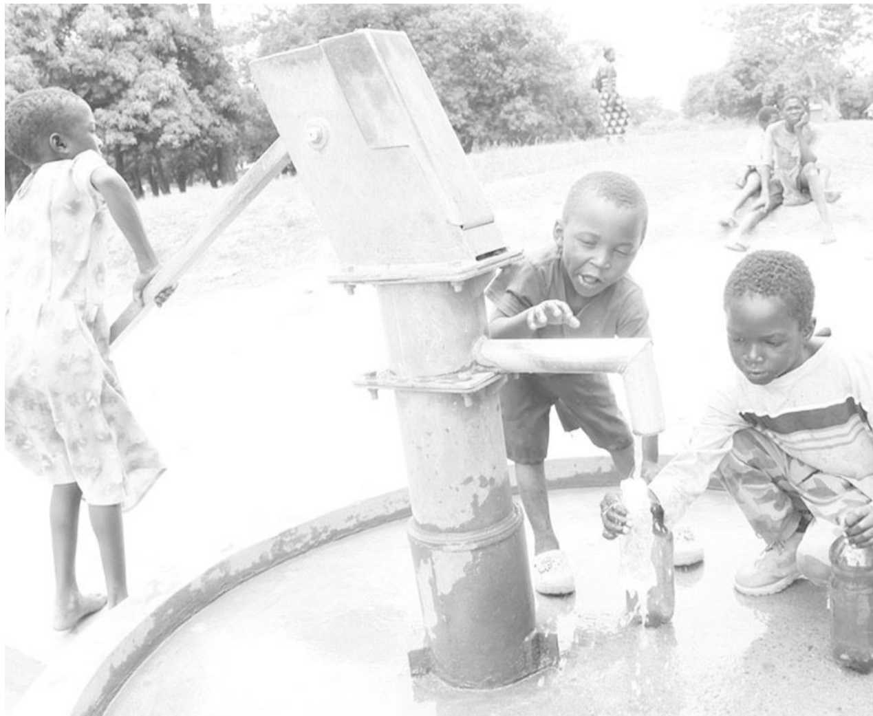
Children of Lusaka's Kalikiliki Compound at a hand pump fetching water

from ZRA we talking of close to 800,000 people had so far registered for their T-pin which is quite some good progress but it's not all those who have submitted their T-pin to the banks so registration is one thing. Banks are been trained, they've been trained to help customers to understand how to register their T-pin online which is quite a faster process because the ZRA has able automated and enhanced system plus it doesn't take long for a person to log into to the system and also to apply for a T-pin online," said Mwanza.