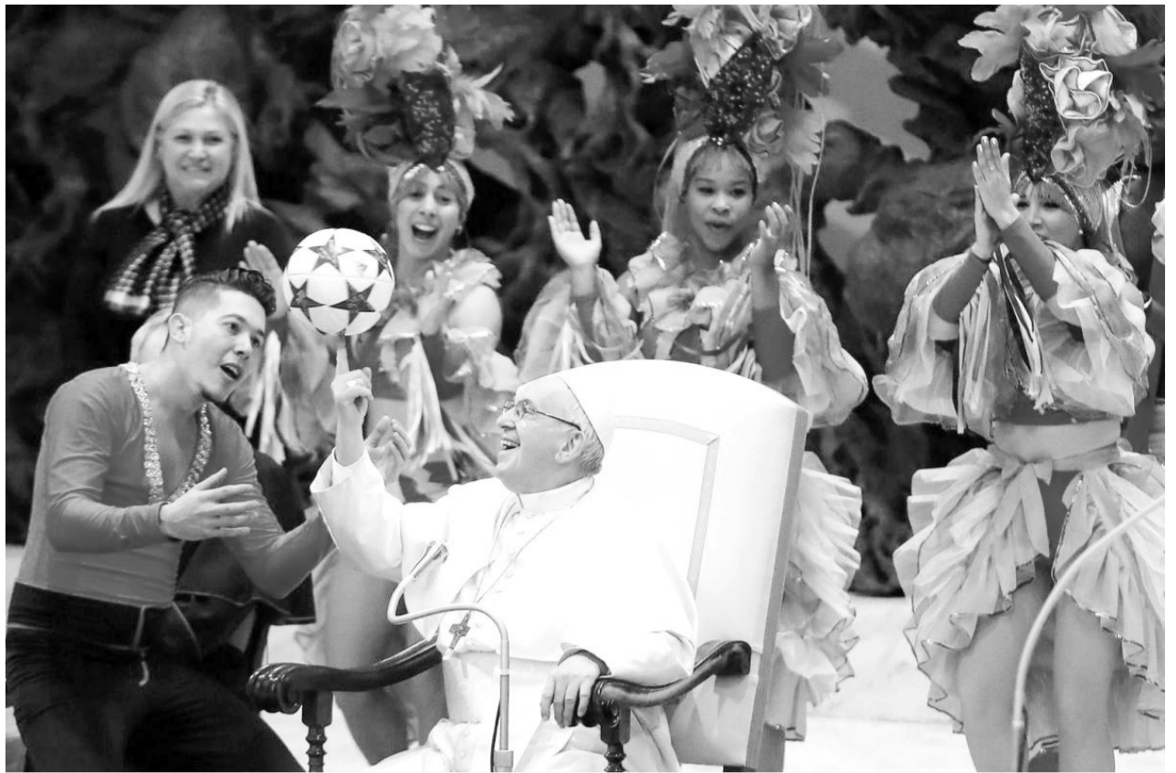
Pope Francis plays with a ball as members of Circus of Cuba perform during the Wednesday general audience in Paul VI Hall at the Vatican January 2, 2019. PHOTO: REUTERS

Thousands of people have fled their homes due to the attacks and reprisals by security forces. REUTERS