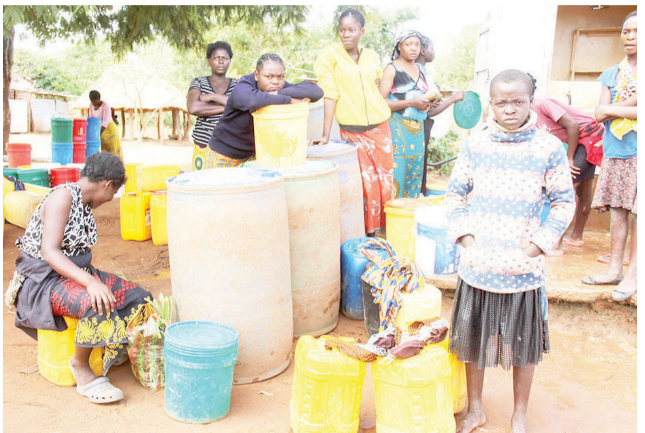
Water blues: Residents of Lusaka's Kalikiliki Compound wait in line to draw water from a community borehole

By Geoffrey Zulu The Zambia Chamber of Commerce and Industry (ZACCI) says the temporary closure of Kasumbalesa, Mokambo and Sakanya entry points due to the presidential election in the Democratic Republic of Congo (DRC) will negatively affect revenue collection given the absence of border taxes. To page 2