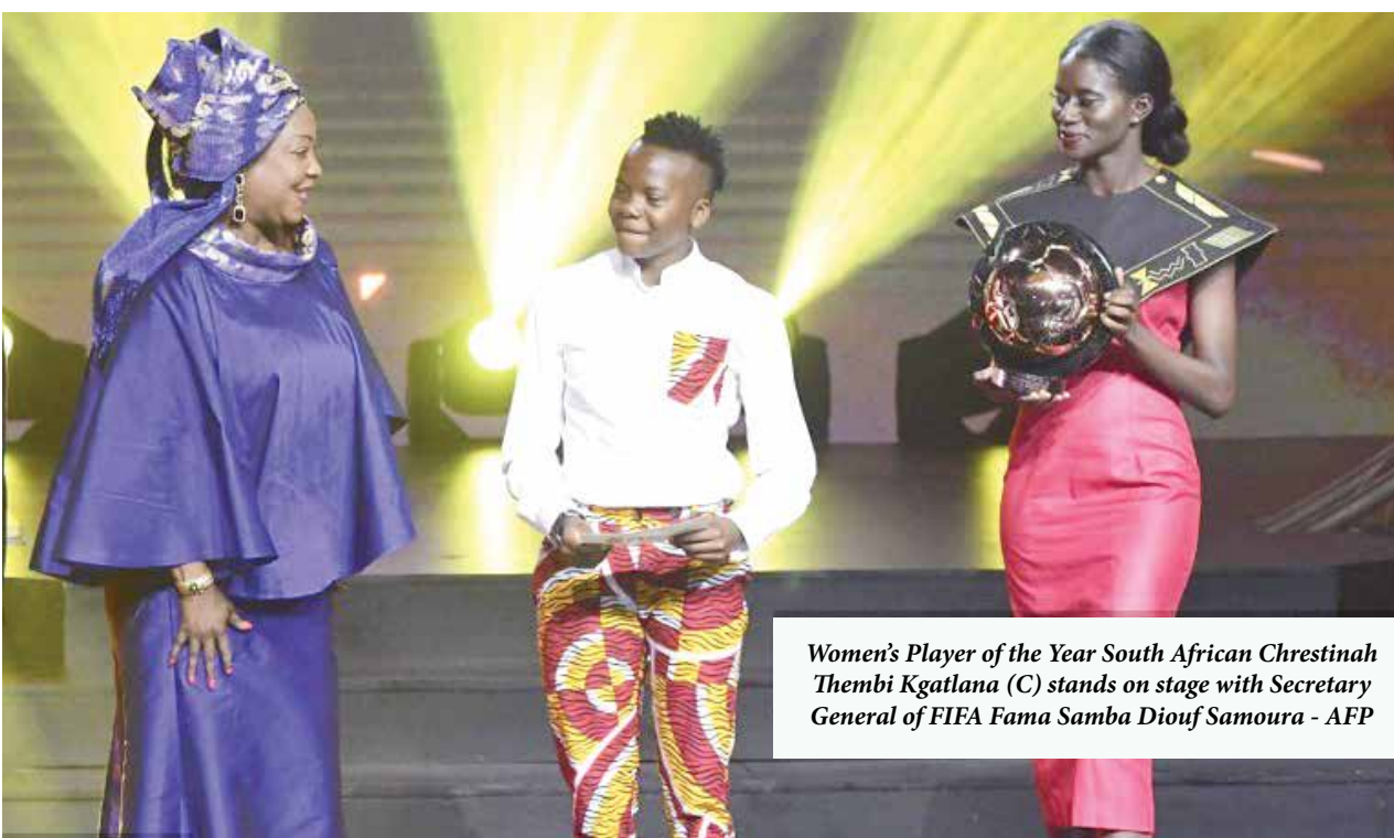
Women's Player of the Year South African Chrestinah Thembi Kgatlana (C) stands on stage with Secretary General of FIFA Fama Samba Diouf Samoura

...FAZ takes charity shield final to Kitwe