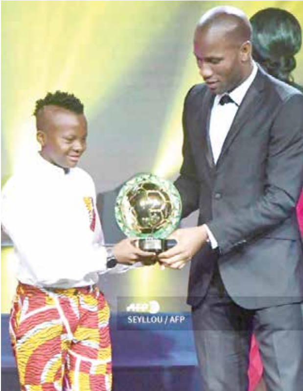
Ivorian soccer player Didier Drogba (R) presents South African Chrestinah Thembi Kgatlana (L) with the Women's Player of the Year trophy