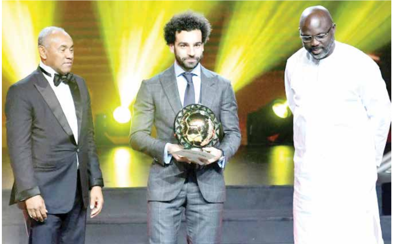
CAF President Ahmad Ahmad (L) poses after he handovered the 2018 African Footballer of the Year Award also called Ballon d'Or to Liverpool's Egyptian forward Mohamed Salah (C). Right is Liberian President George Weah during an award ceremony in dakar on Tuesday