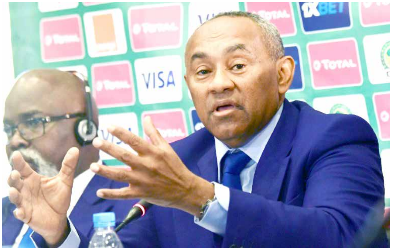
CAF President Ahmad Ahmad announces Egypt as host of the 2019 Africa Cup of Nations (CAN) between June 15 and July 13, during a press conference in an Hotel in Dakar on January 8, 2019. The CAF executive committee preferred Egypt to South Africa as replacements for original hosts Cameroon, who were dropped due to delays in preparations and concerns over security.

The contest between Egypt and South Africa was necessitated after CAF dropped original hosts Cameroon last November because of delays in preparations and security concerns.