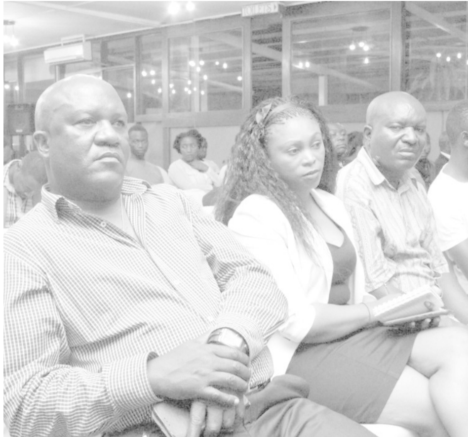
Members of the public during the OSISA/News Diggers public discussion forum on new mining tax and job losses on Thursday January 24, 2019