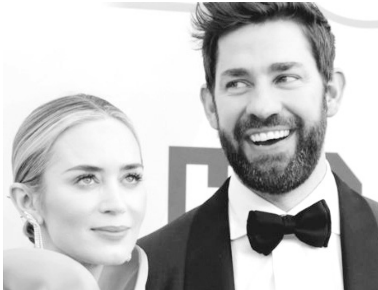
Emily Blunt and John Krasinski.

picking up the best actor award for playing Freddie Mercury in Bohemian Rhapsody .