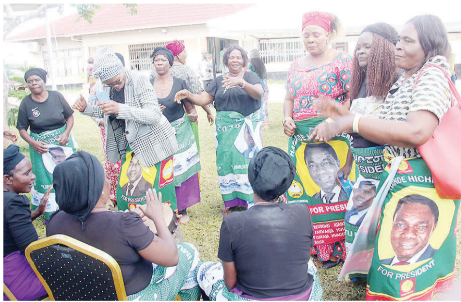
HH and his deputy GBM join the bereaved family of the late former vice-president Lupando Mwape. Right, the UPND and ruling PF chior sings at the house of mourning