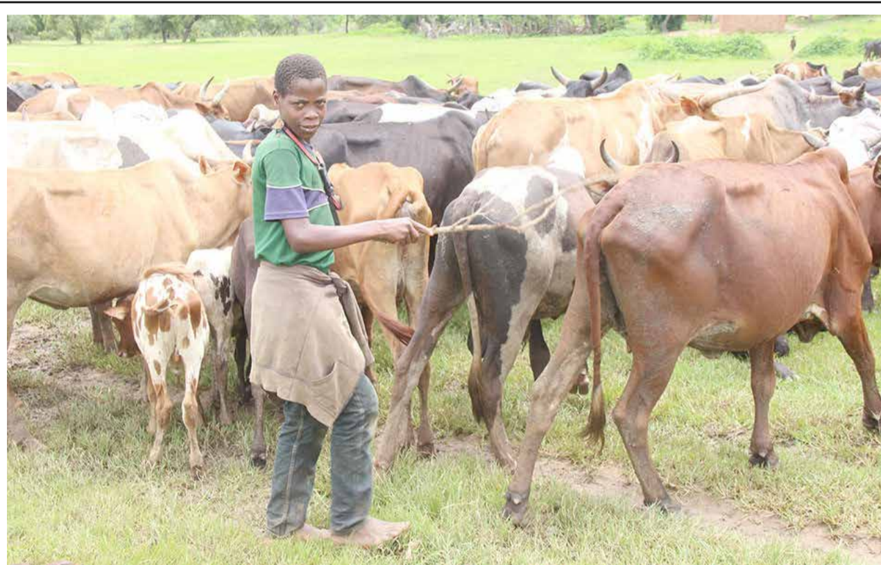
A grade five dropout boy of Chindwale village in Katete district heading after cattle

"Secondly, we want to make it clear that we have never bullied any council CEO. As a matter of fact, Lusaka City Council under ministerial instructions, pulled down our billboards in 2017 regardless of the billboard approvals and a named Lebanese company