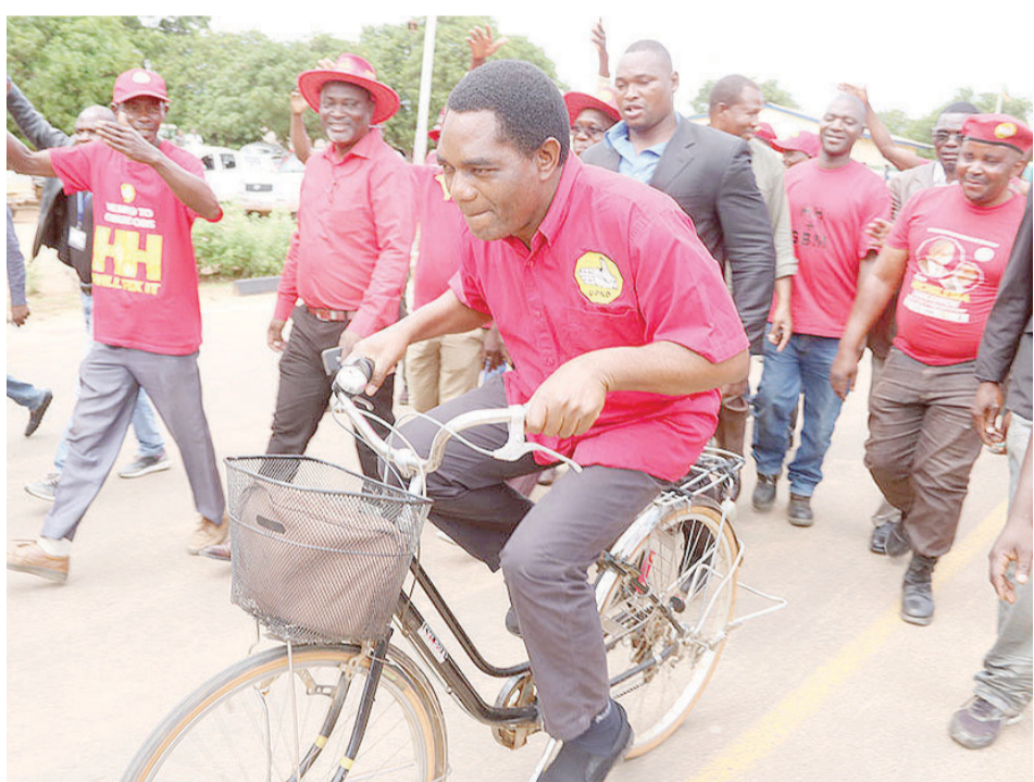
Hakainde Hichilema cycles around Lundazi town during a campaign, shortly after he stormed Lundazi Police Station to complain about PF violence

Govt forms special joint cyber crime crack squad