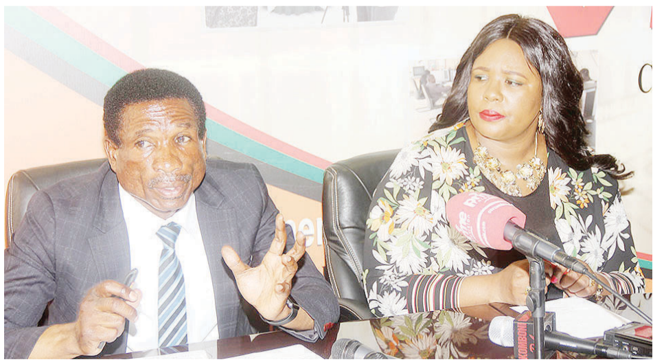
Agriculture Minister Michael Katambo addresses the media at a joint press briefing with Information and Broadcasting Minister Dora Siliya in Lusaka on February 6, 2019

Zamsort shines at Cape Town Indaba Story page 4