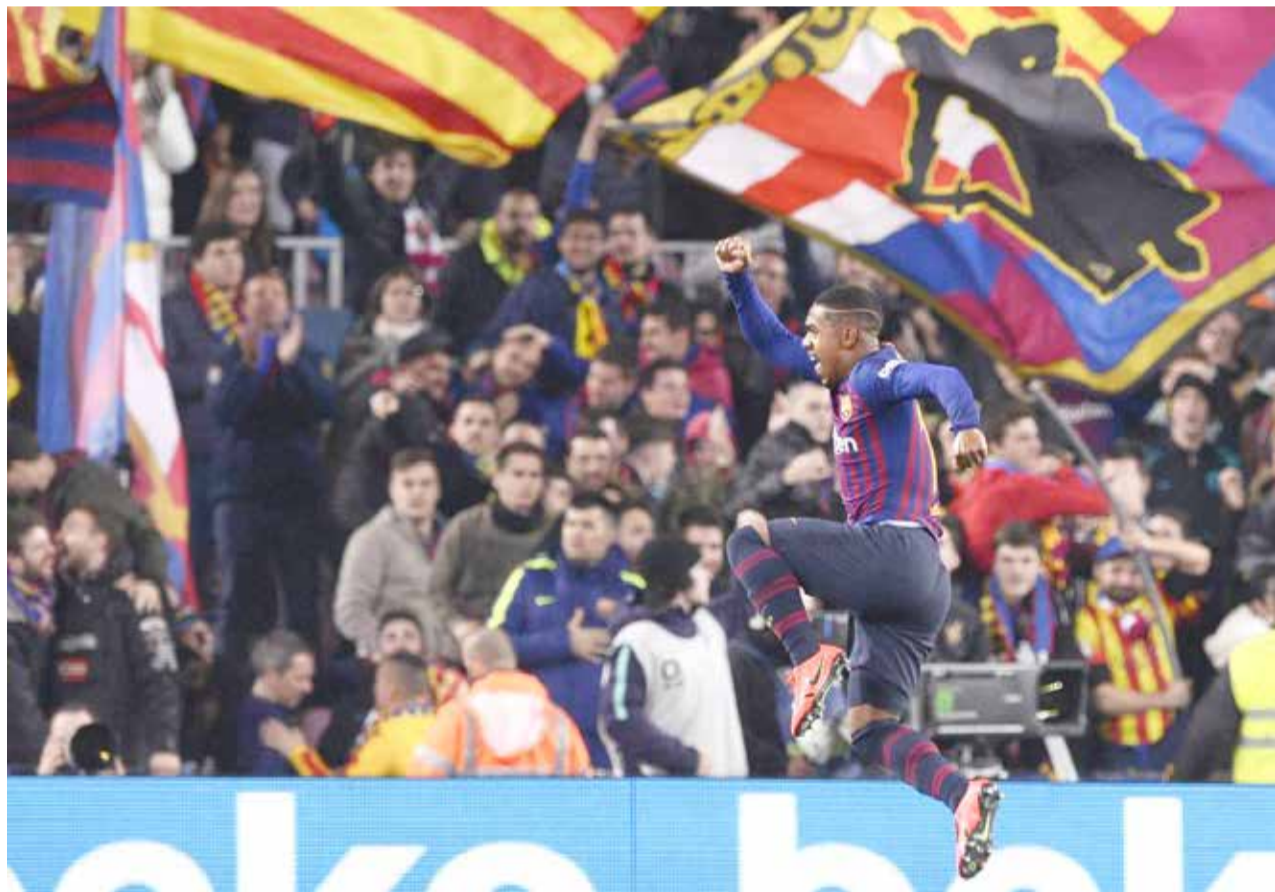
Barcelona's Malcom celebrates scoring his teams equalizer against Real Madrid in the Copa del Rey on Wednesday