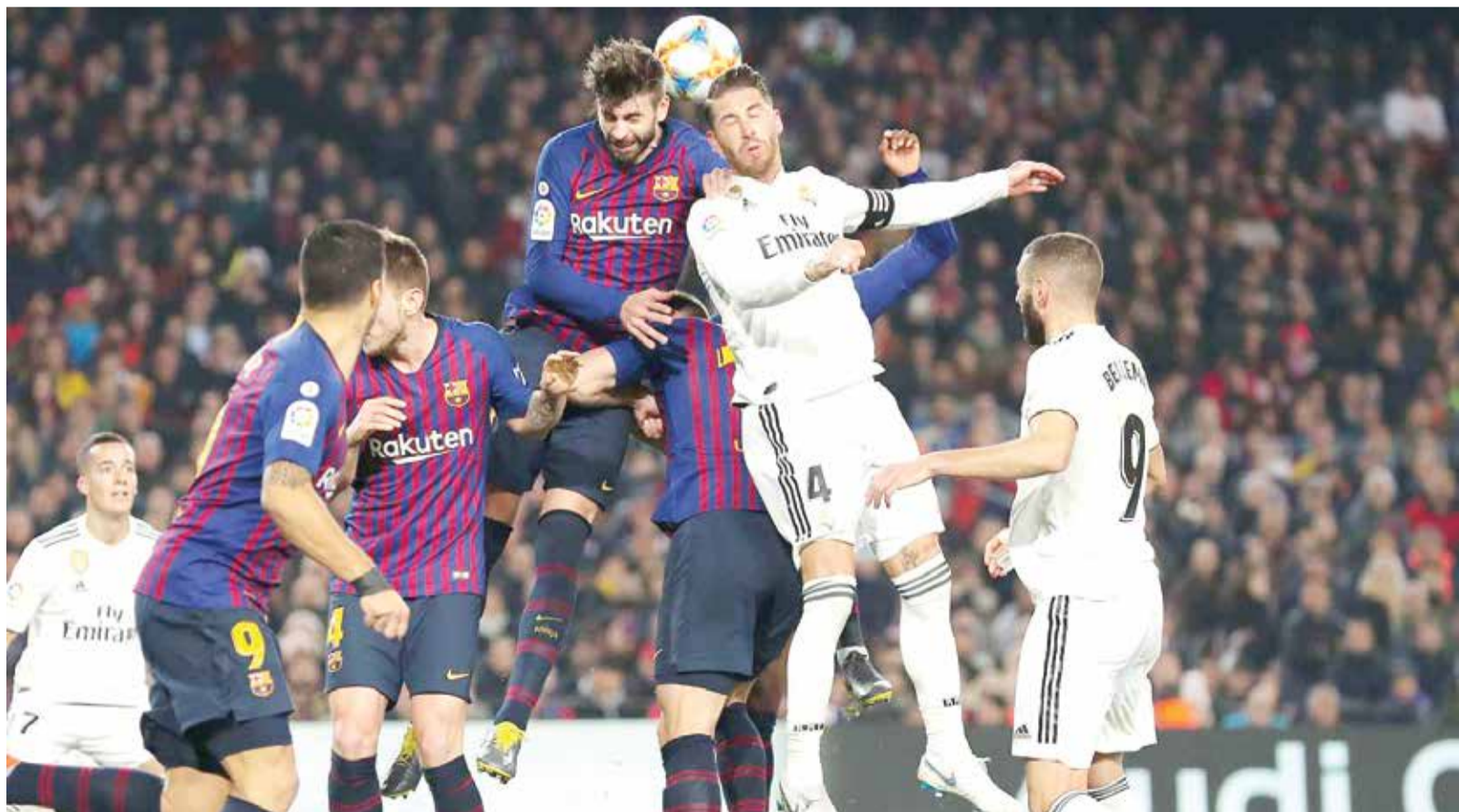
Barcelona and Real Madrid players battle it out in the Copa del Rey at Camp Nou on Wednesday